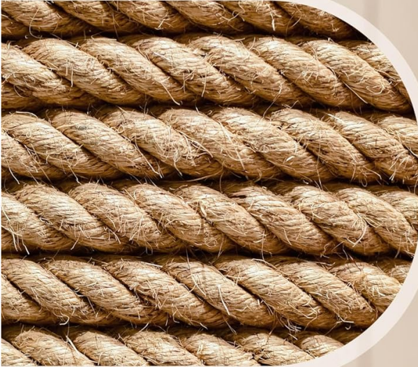
Cuerda de Sisal Única Hecha a Mano