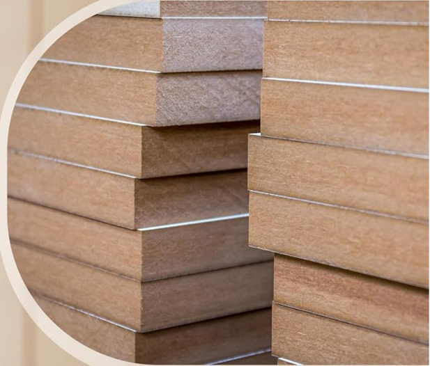
Tablero de Partículas Sólido