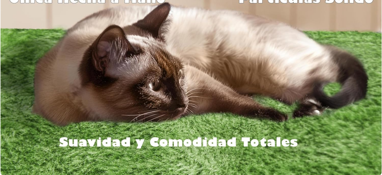
Suavidad y Comodidad Totales

Image: A cat enjoying the soft plush surface, highlighting the comfortable and durable materials used in the cat tree's construction.