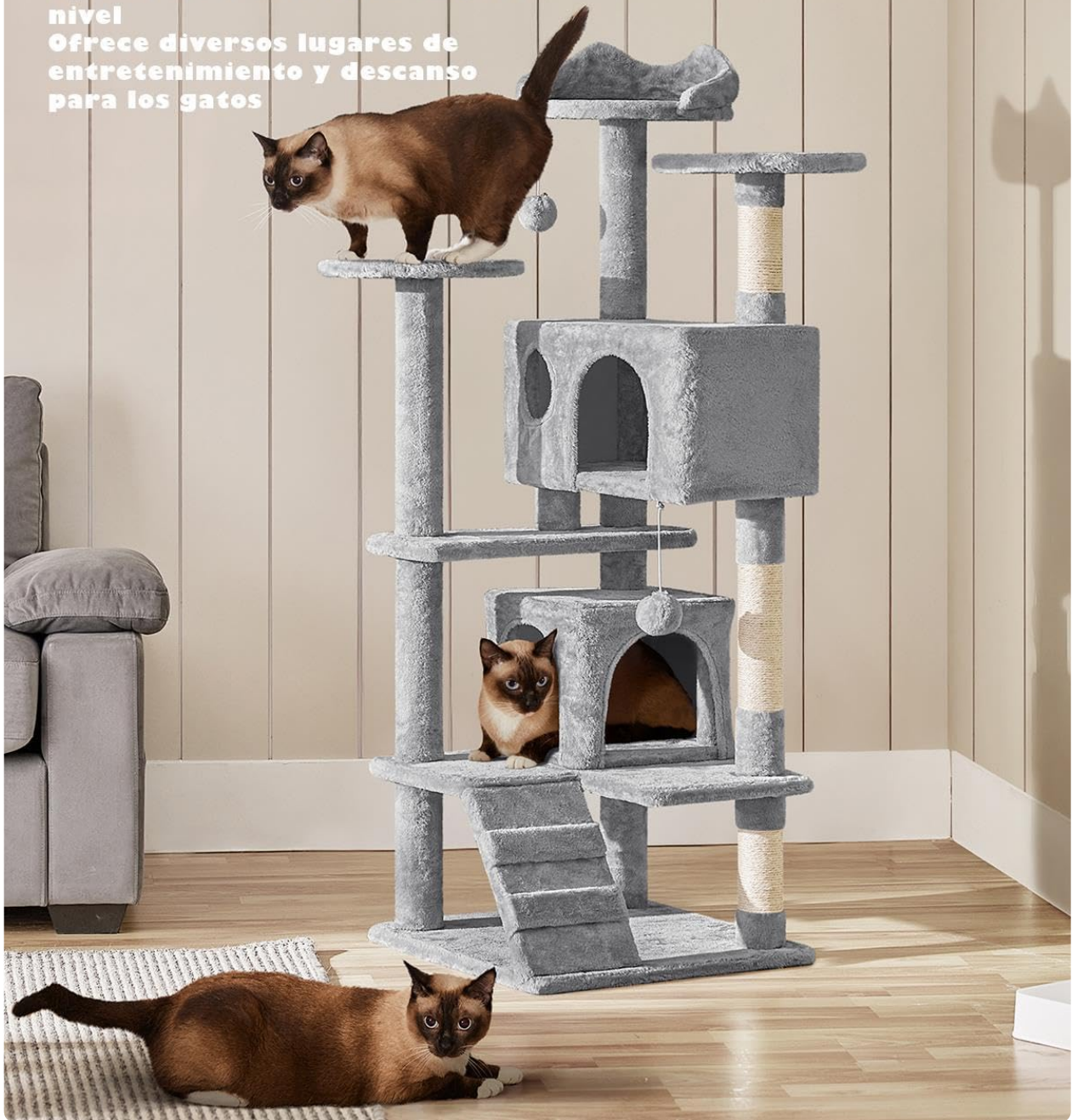
Image: Cats exploring various levels and features of the cat tree, including perches and enclosed spaces.

Aporta diversión única en cada nivel Ofrece diversos lugares de entretenimiento y descanso para los gatos