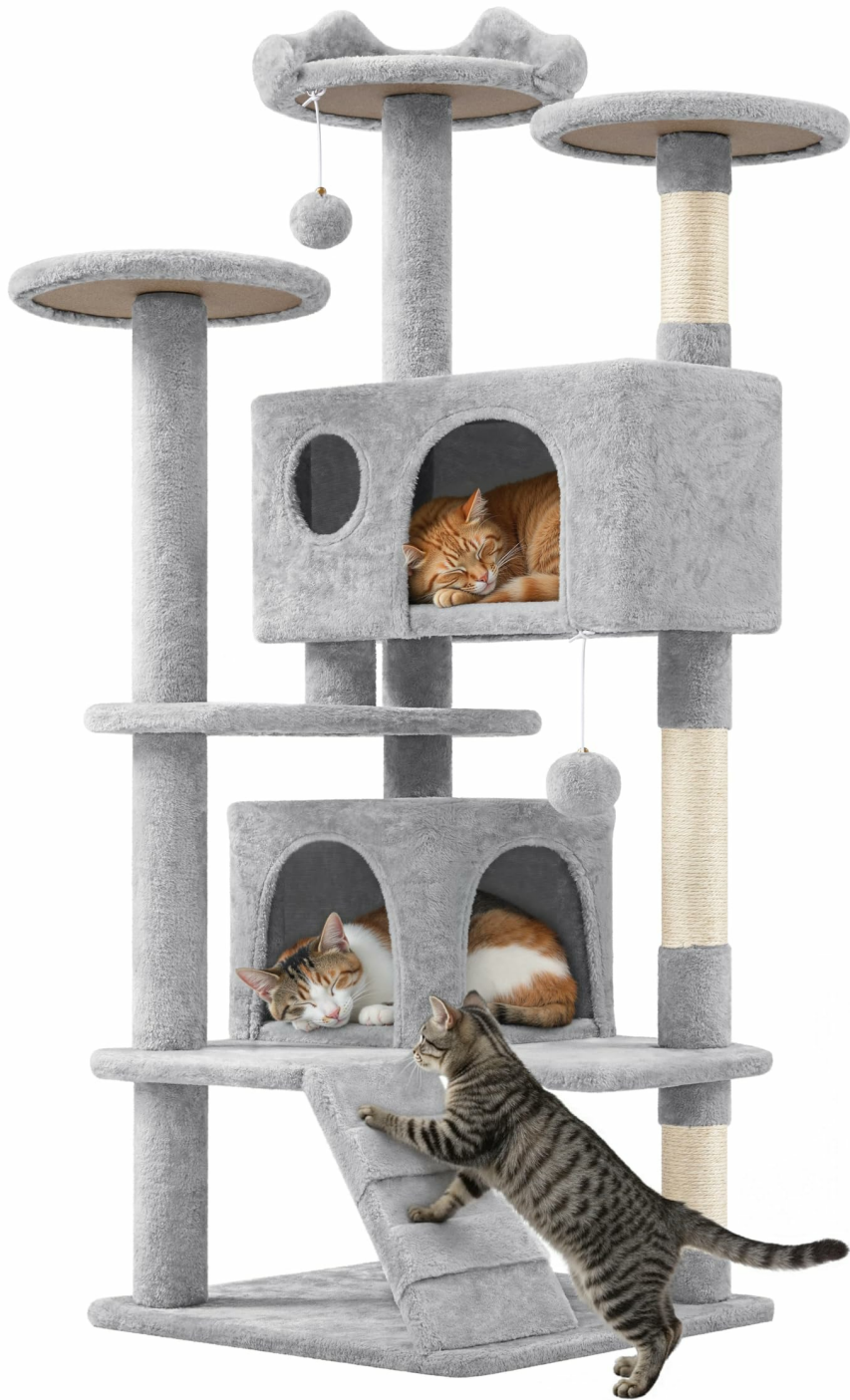
Image: The Yaheetech 139cm Multi-Level Cat Tree, featuring multiple platforms, scratching posts, and two enclosed condos, designed for cat activity and rest.