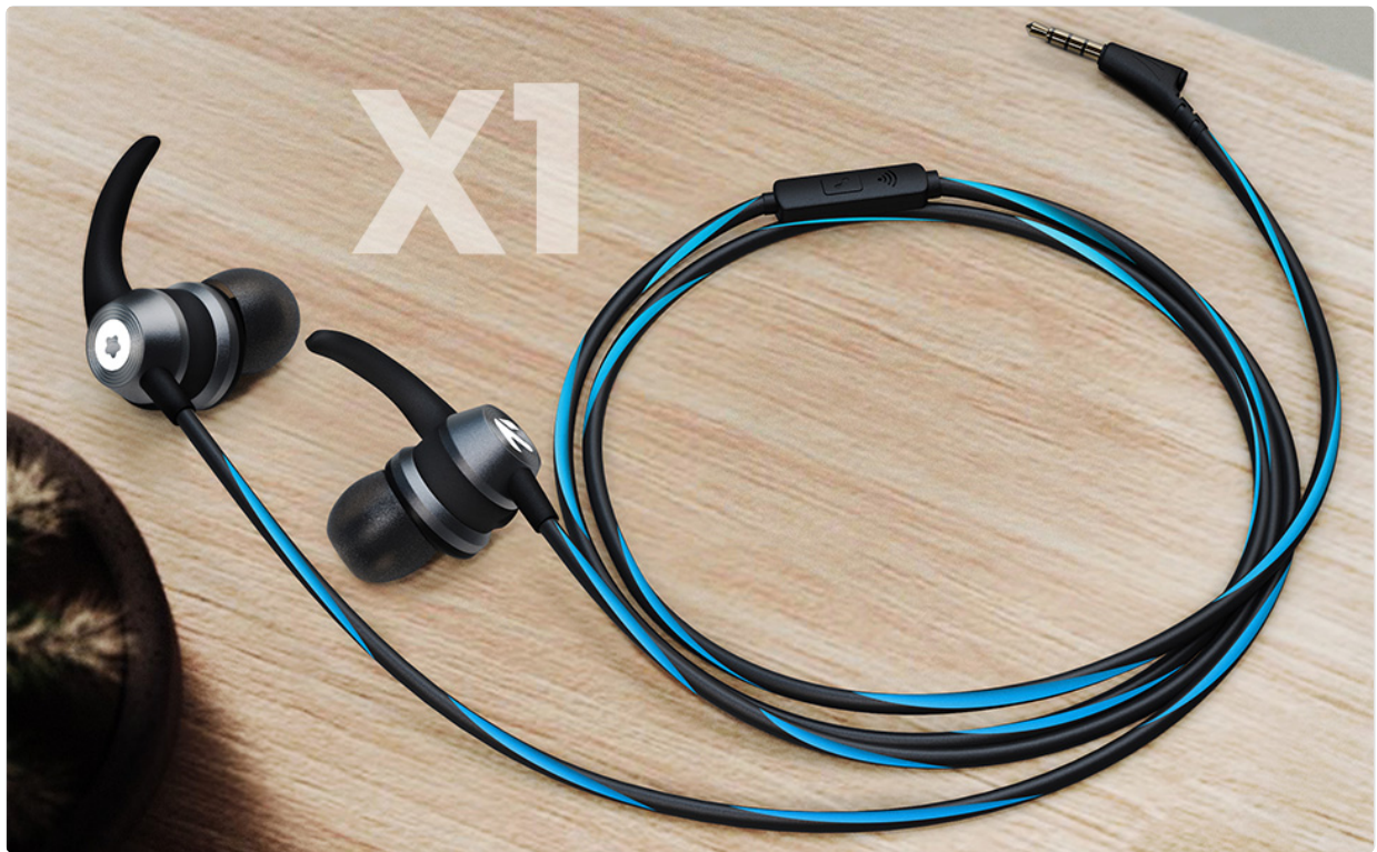
Image: A visual representation of the 10mm drivers, the in-line controls, and the durable L-shaped 3.5mm audio connector of the earphones.