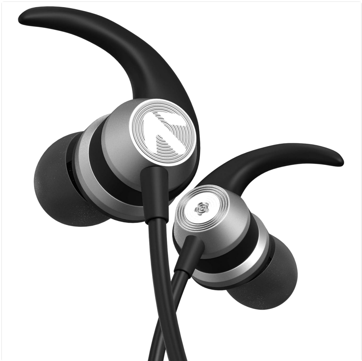
Image: GOBOULT BassBuds X1 In-Ear Wired Earphones, showcasing their sleek design.