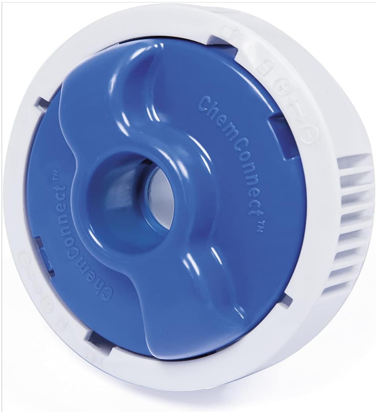
Image: A detailed view of the Bestway ChemConnect dispenser, a blue and white device designed to release pool chemicals into the water.