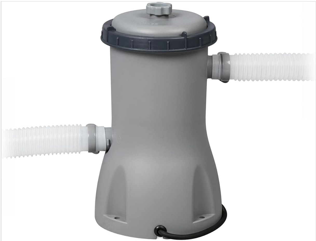
Image: A Bestway Type II filter cartridge, a pleated paper filter designed to trap debris from pool water.