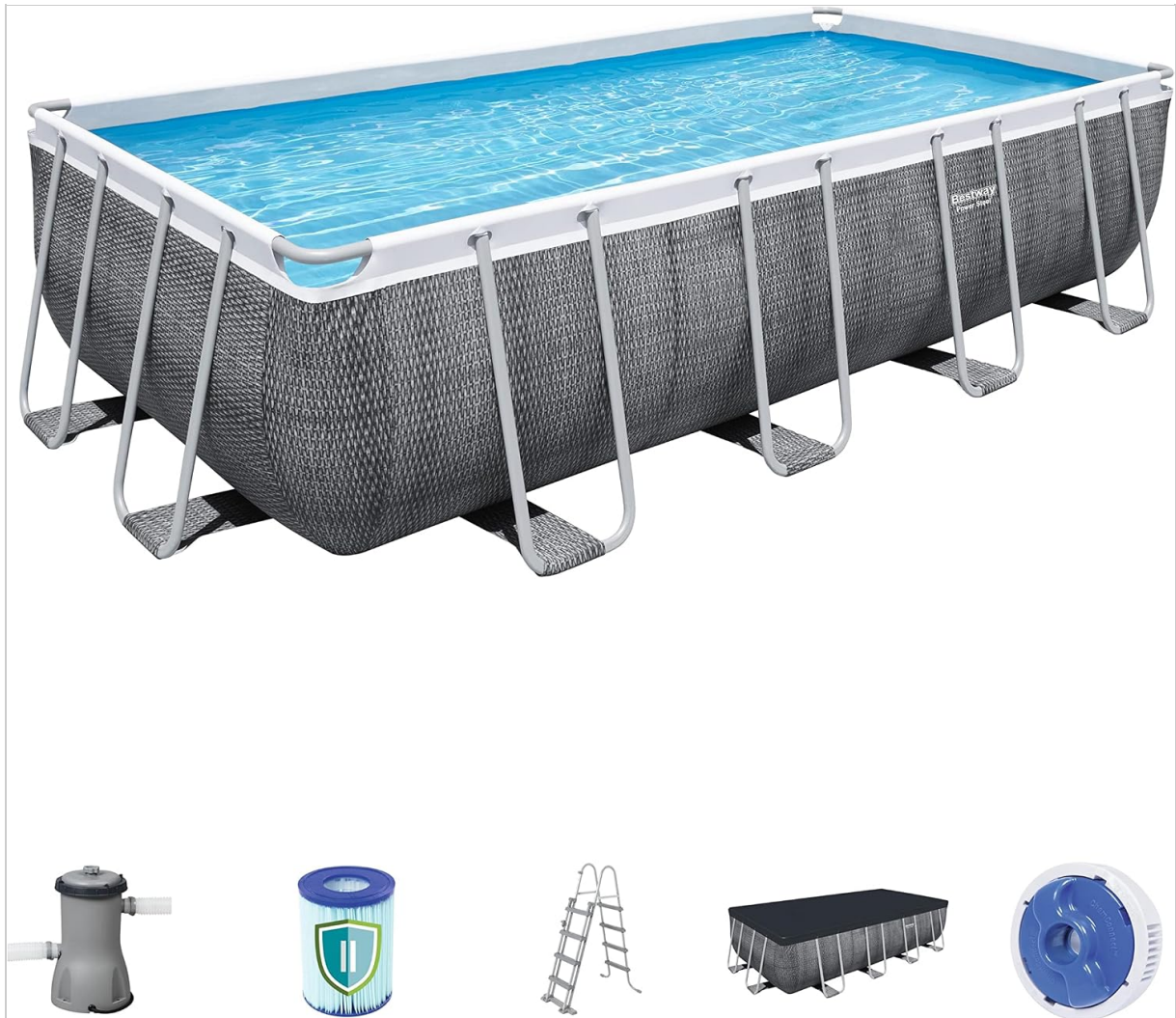
Image: An exploded view showing the main components of the Bestway Power Steel Rectangular Pool, including the pool liner, frame parts, filter pump, ladder, cover, and ChemConnect dispenser.