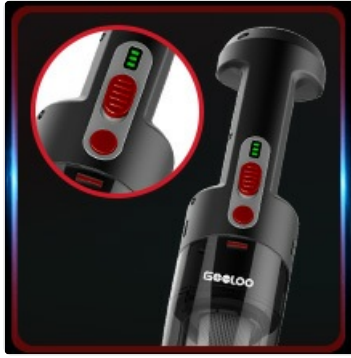
Image: Close-up of the vacuum cleaner's intelligent voltage detection feature, showing battery status indicators.