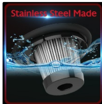
Image: Close-up of the stainless steel HEPA filter, illustrating its washable design for easy maintenance.