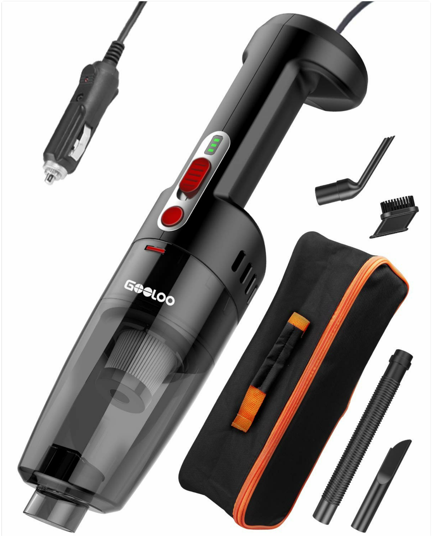
Image: Overview of the GOOLOO Car Vacuum Cleaner showcasing its compact size, strong suction, HEPA filter, and long power cord.