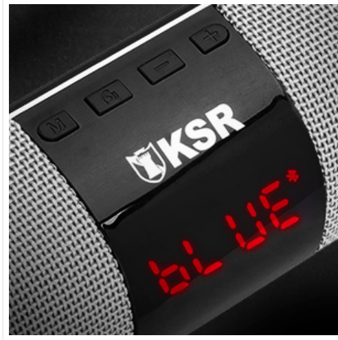
Image 6.1: The speaker's display showing 'BLUE' during Bluetooth operation.