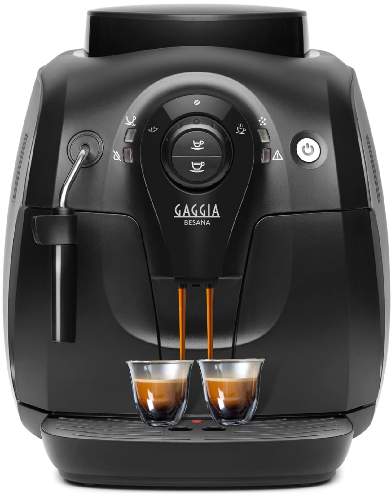
Figure 1: Gaggia RI8180/01 Besana Espresso Machine