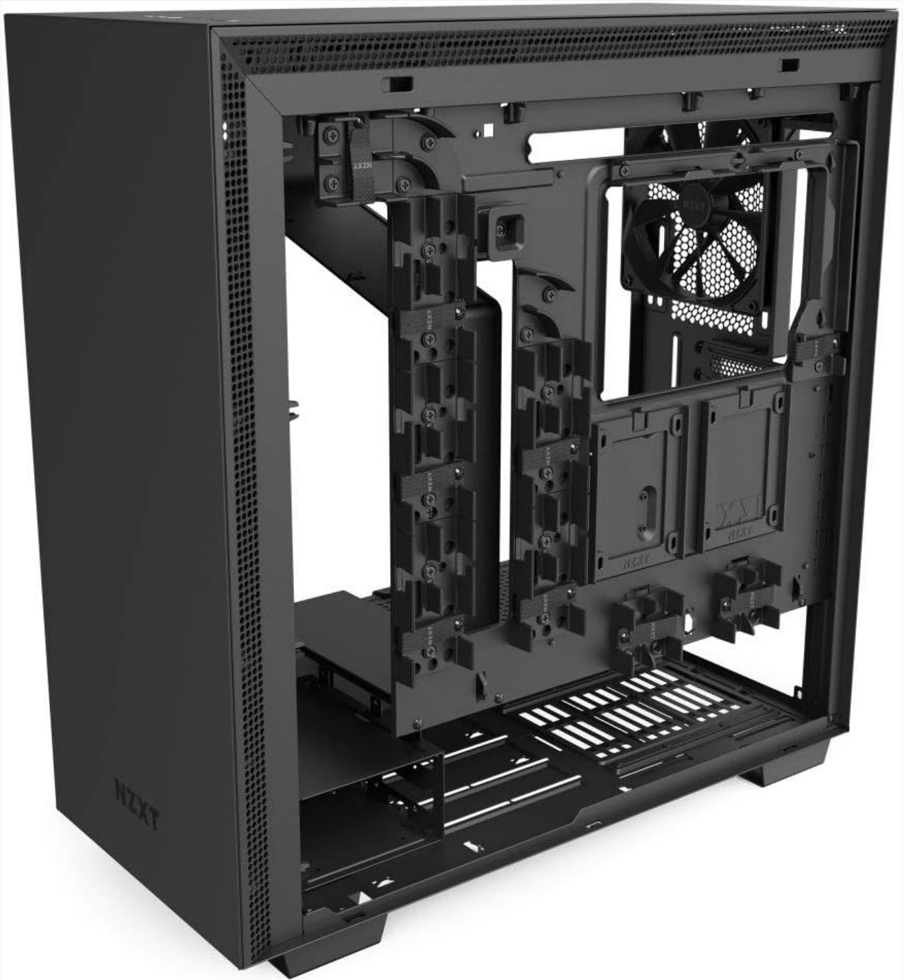
Figure 2: Internal view highlighting cable management and drive bays.