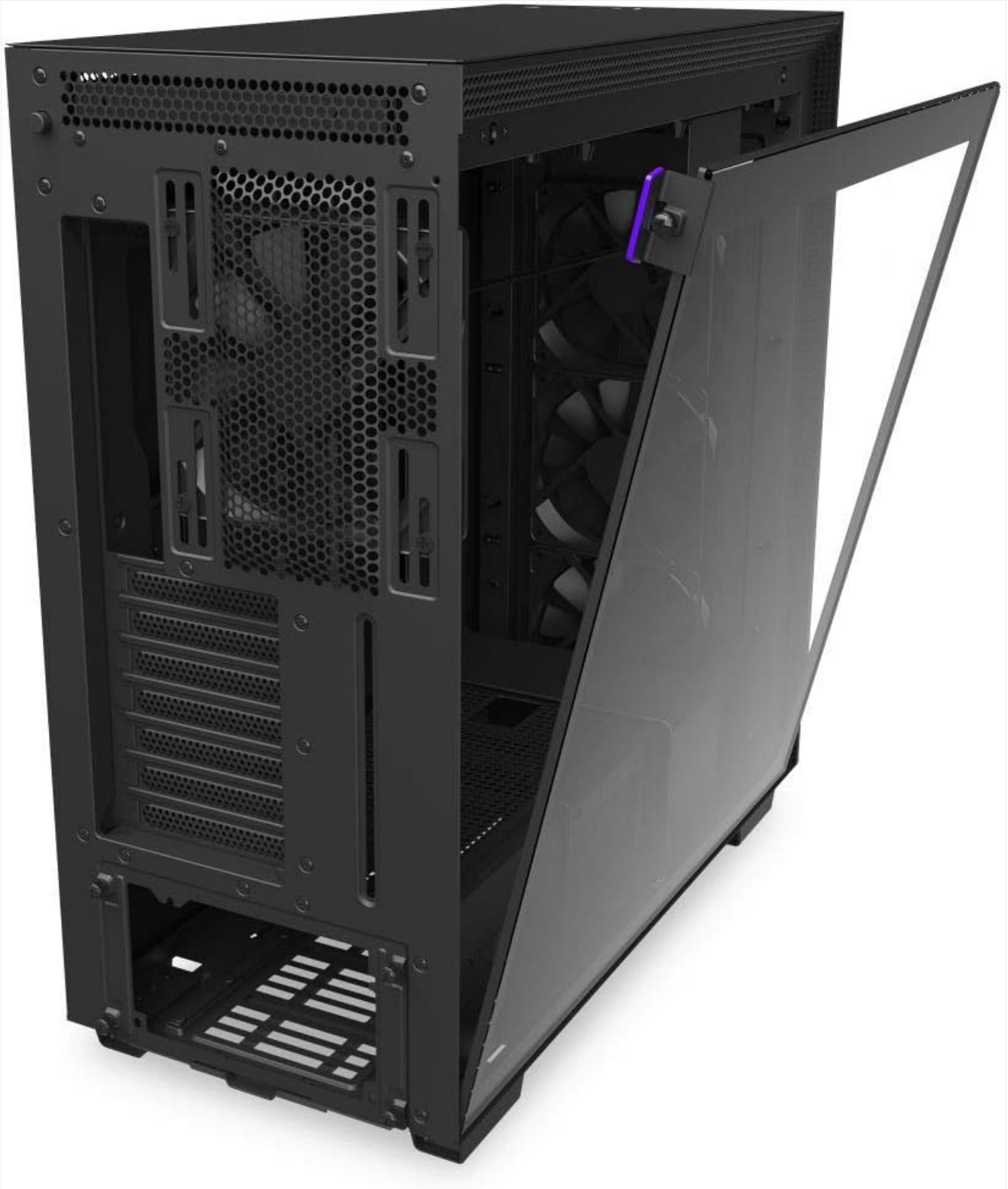
Figure 3: Tempered glass side panel open for component access.

Your browser does not support the video tag.