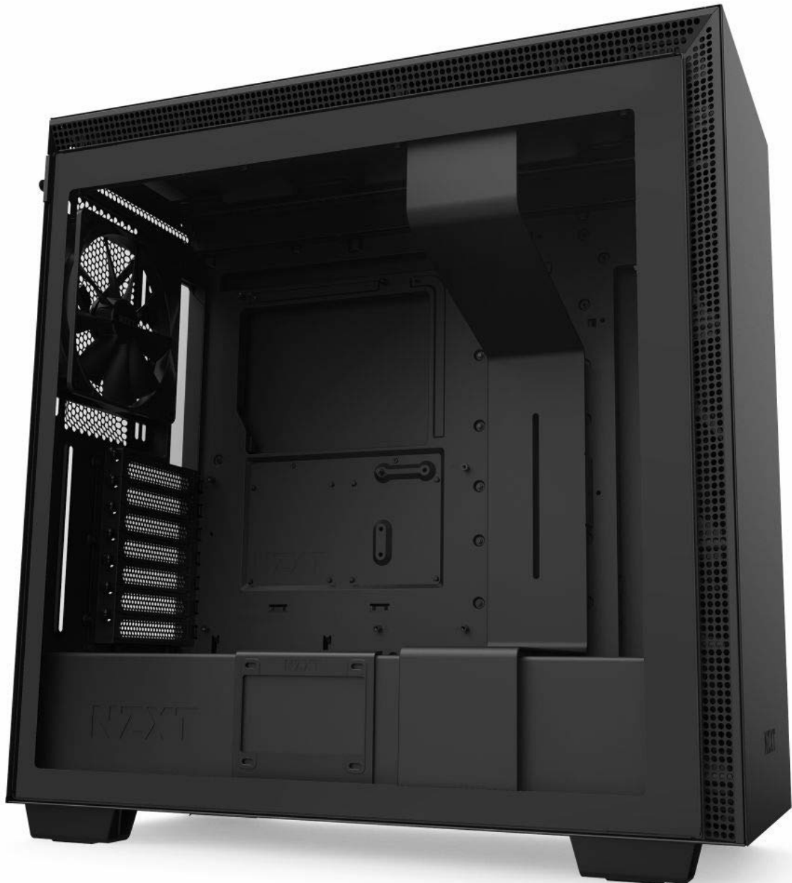
Figure 1: Front view of the NZXT H710 ATX PC Gaming Case.