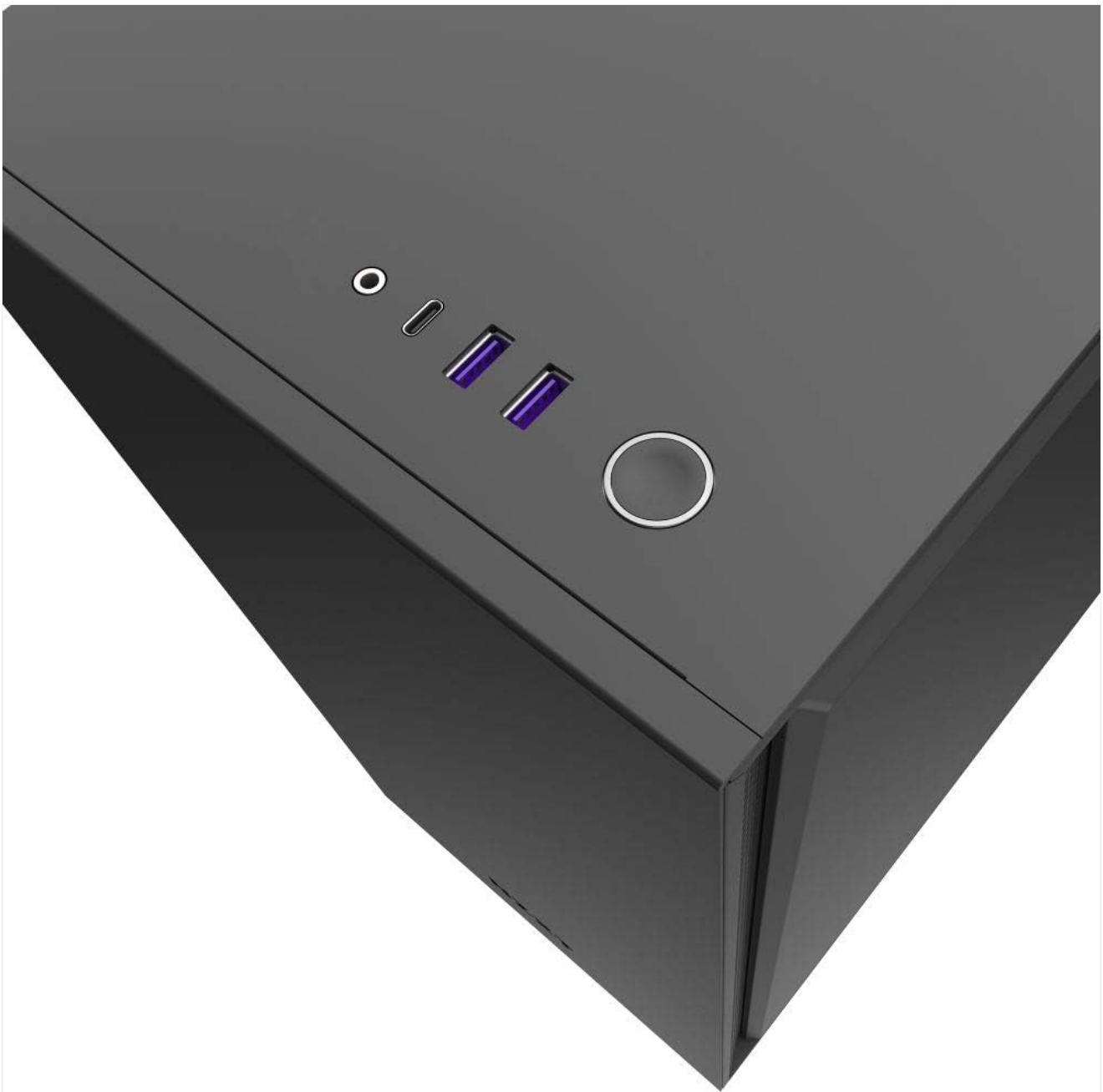
Figure 4: Top I/O ports for convenient connectivity.