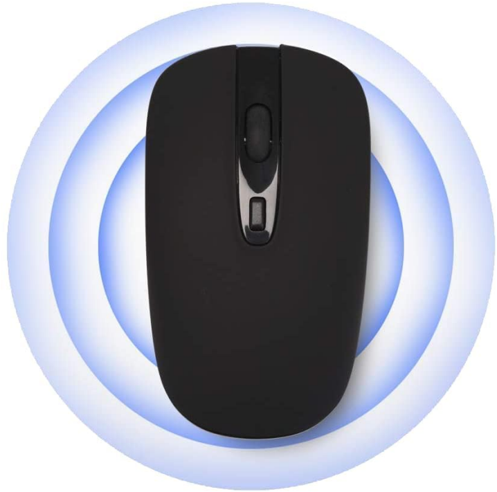
Figure 3: Noiseless click and adjustable DPI features