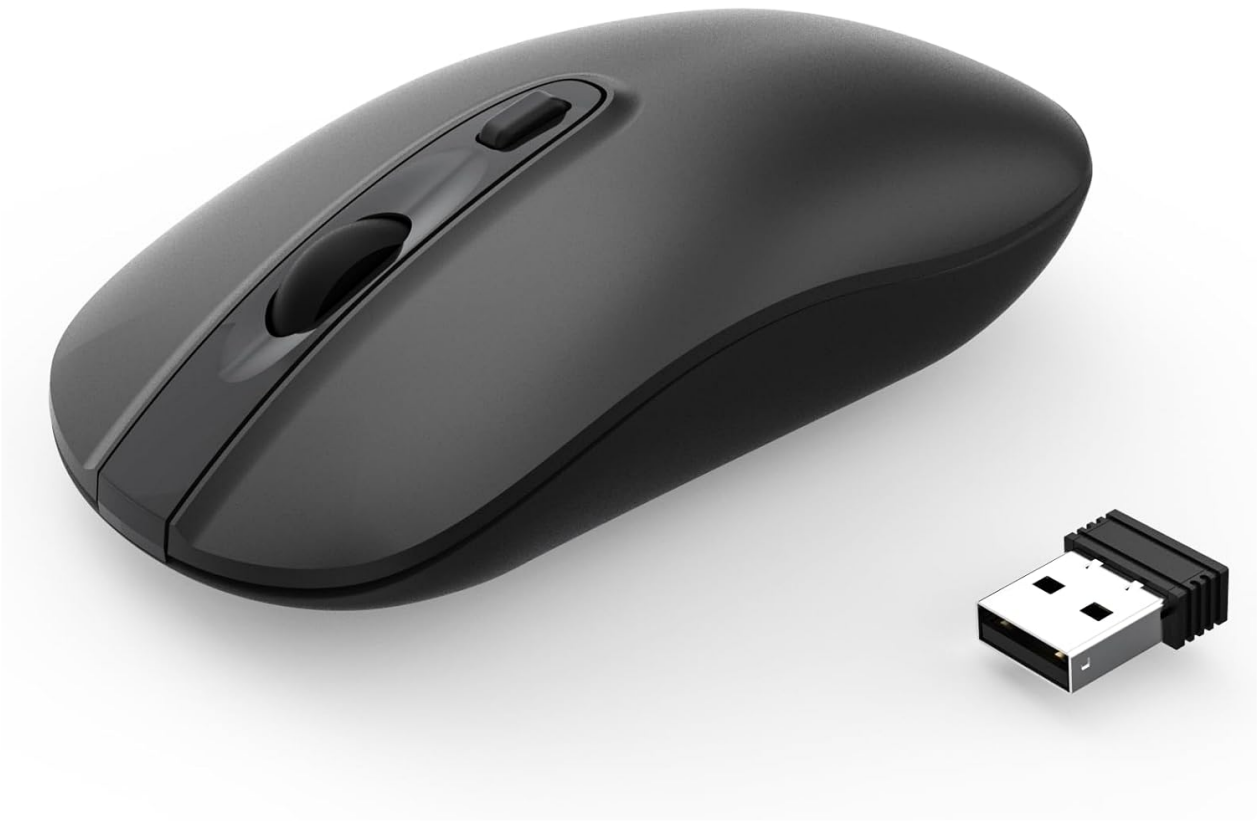
Figure 1: Cimetech Wireless Mouse with Nano Receiver