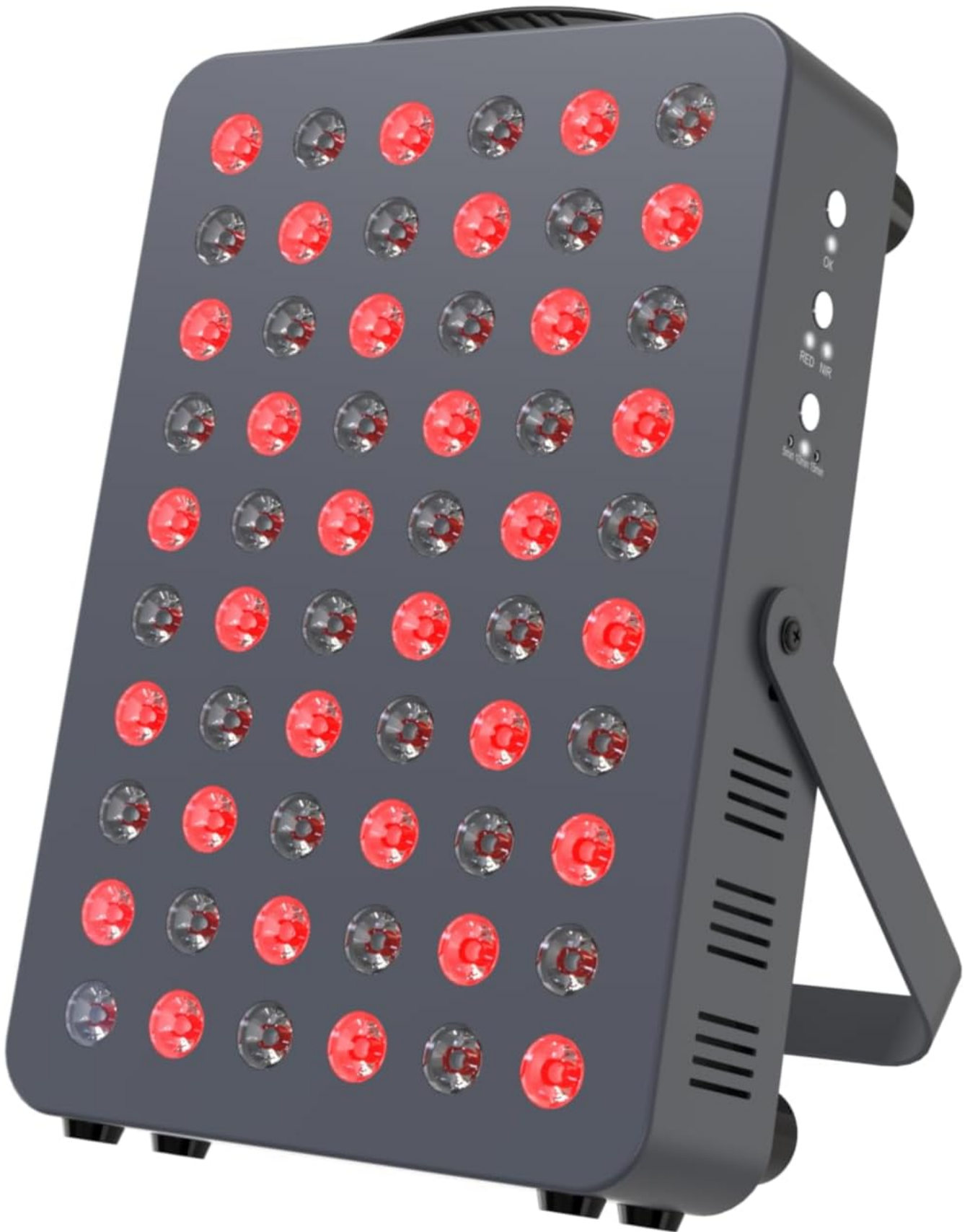
Image: The Hooga HG300 red light therapy device is shown standing on a wooden surface, demonstrating its built-in kickstand for tabletop use.