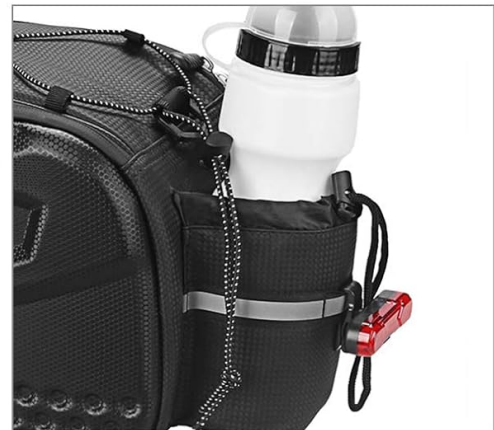
Water Bottle Pocket