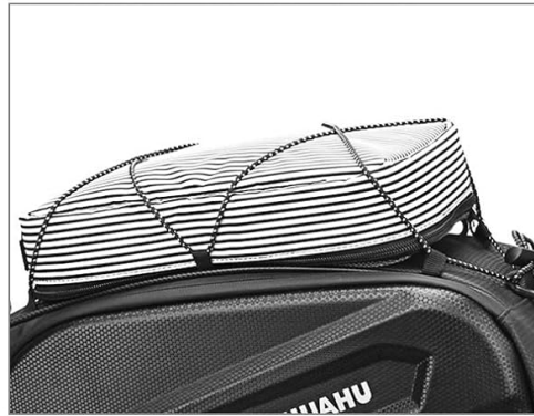
Elastic Fixing Cord