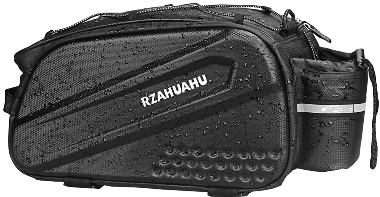
Image 7: The bag's waterproof material repelling water droplets, ensuring contents stay dry.