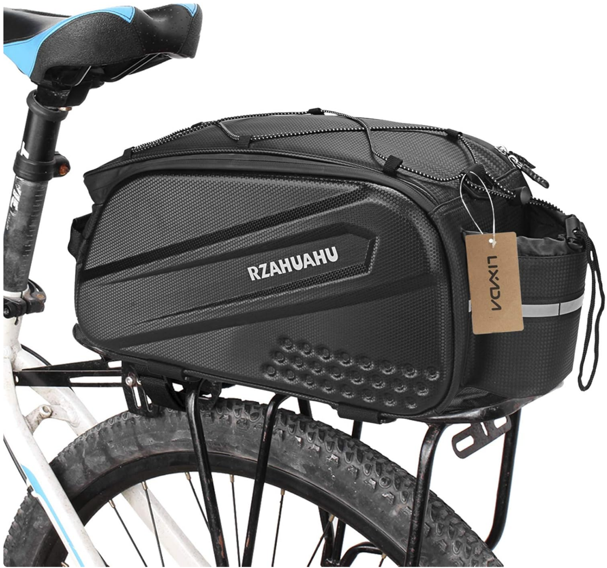
Image 1: Lixada 10L Bicycle Pannier Bag securely mounted on a bike's rear rack.