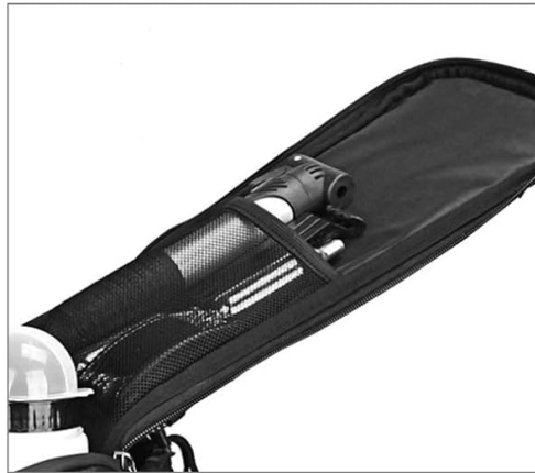
Internal Mesh Pocket for Bike Tools