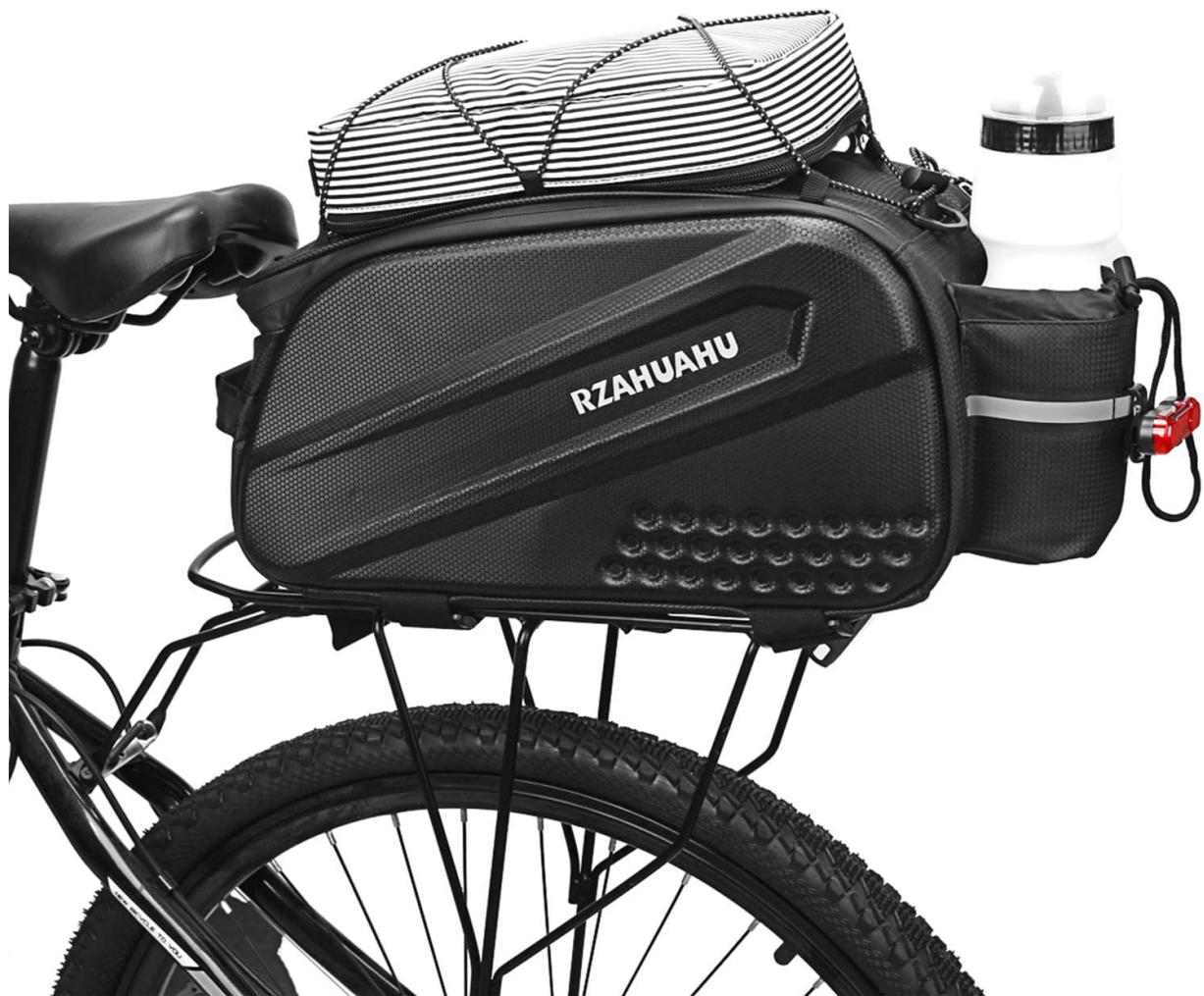
Image 6: The elastic cord on top of the bag securing additional items, and a water bottle in its side pocket.