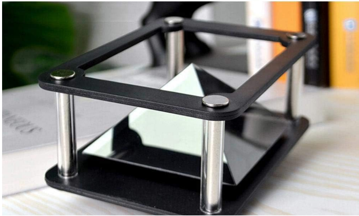
Image: A smartphone positioned on the holographic display stand, ready for projection.