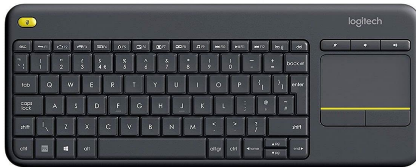
Image: The Logitech K400 Plus Wireless Touch Keyboard, showing its compact design with integrated touchpad.