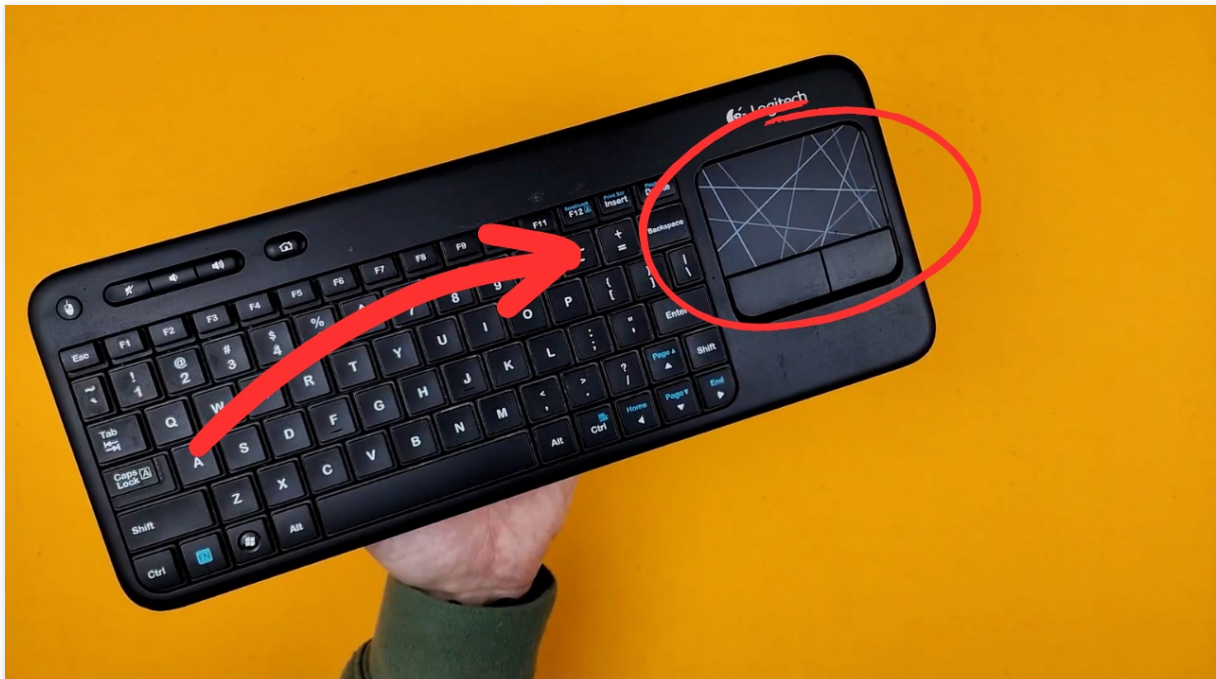
Image: A detailed view of the Logitech K400 Plus keyboard keys, highlighting the QWERTY layout.

The K400 Plus features a standard QWERTY layout with additional function keys and an integrated touchpad.