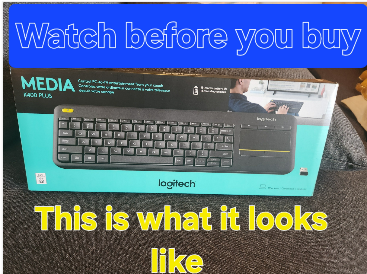
Image: A hand demonstrating the use of the integrated touchpad on the Logitech K400 Plus.