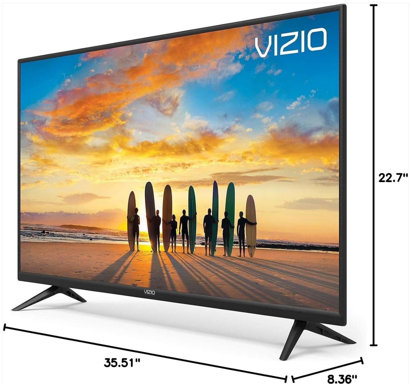
Image: VIZIO V405-G9 TV Dimensions.