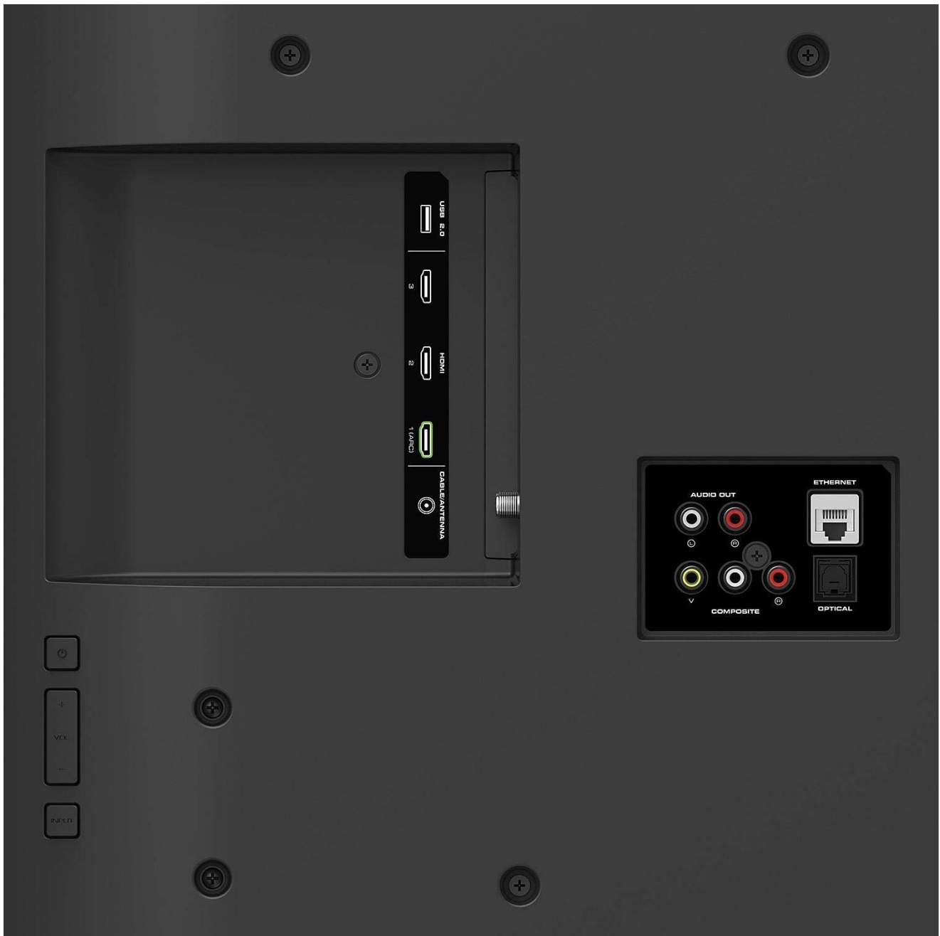
Image: Rear input ports of the VIZIO V405-G9 TV.

Connect the power cord to the TV and then to a wall outlet. For external devices such as Blu-ray players, game consoles, or cable boxes, use the HDMI ports located on the back of the TV. The VIZIO V405-G9 features 3 UHD-Ready HDMI Ports.