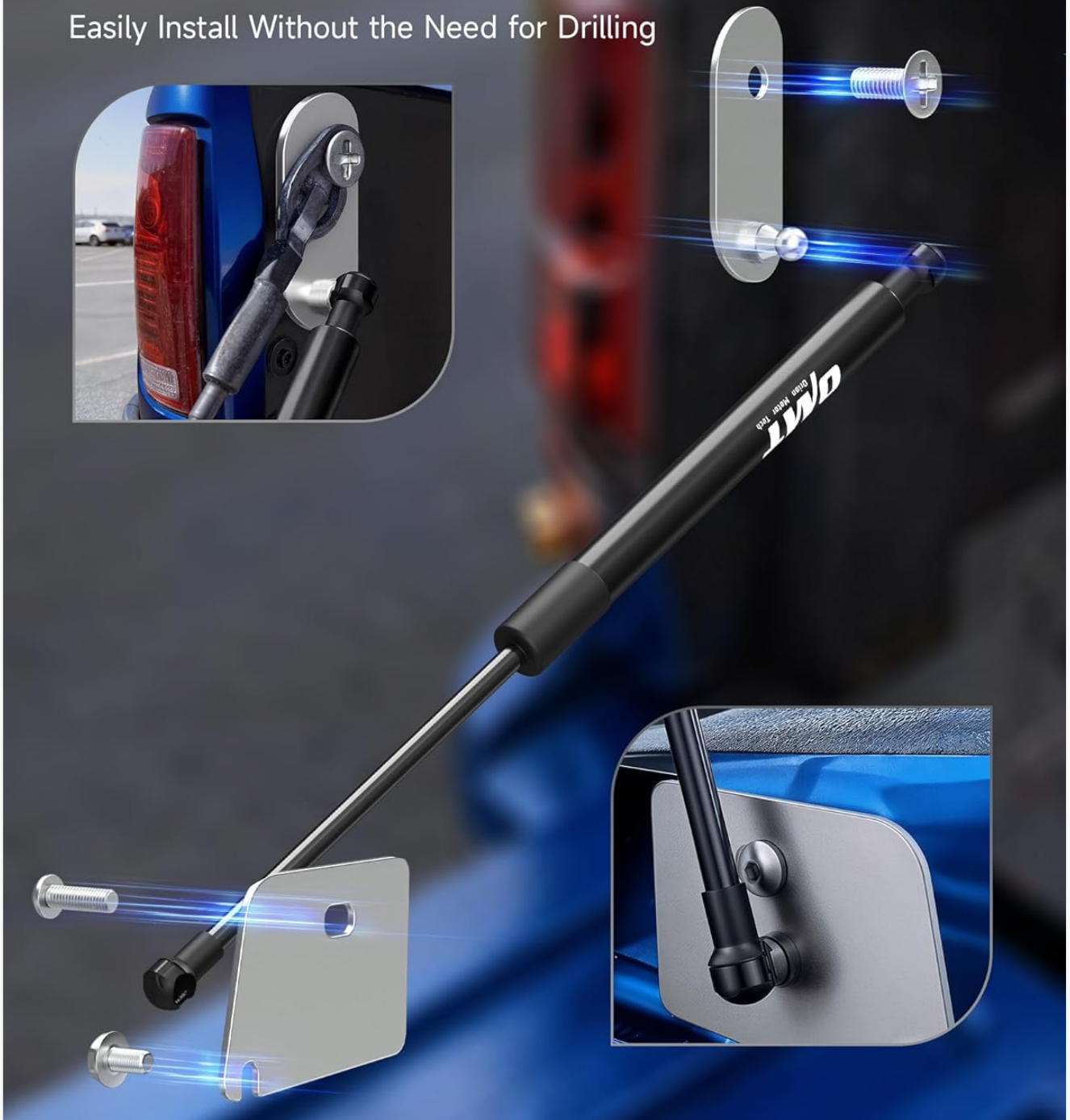
Figure 3: Visual guide for installing the tailgate assist shock.

Easily Install Without the Need for Drilling