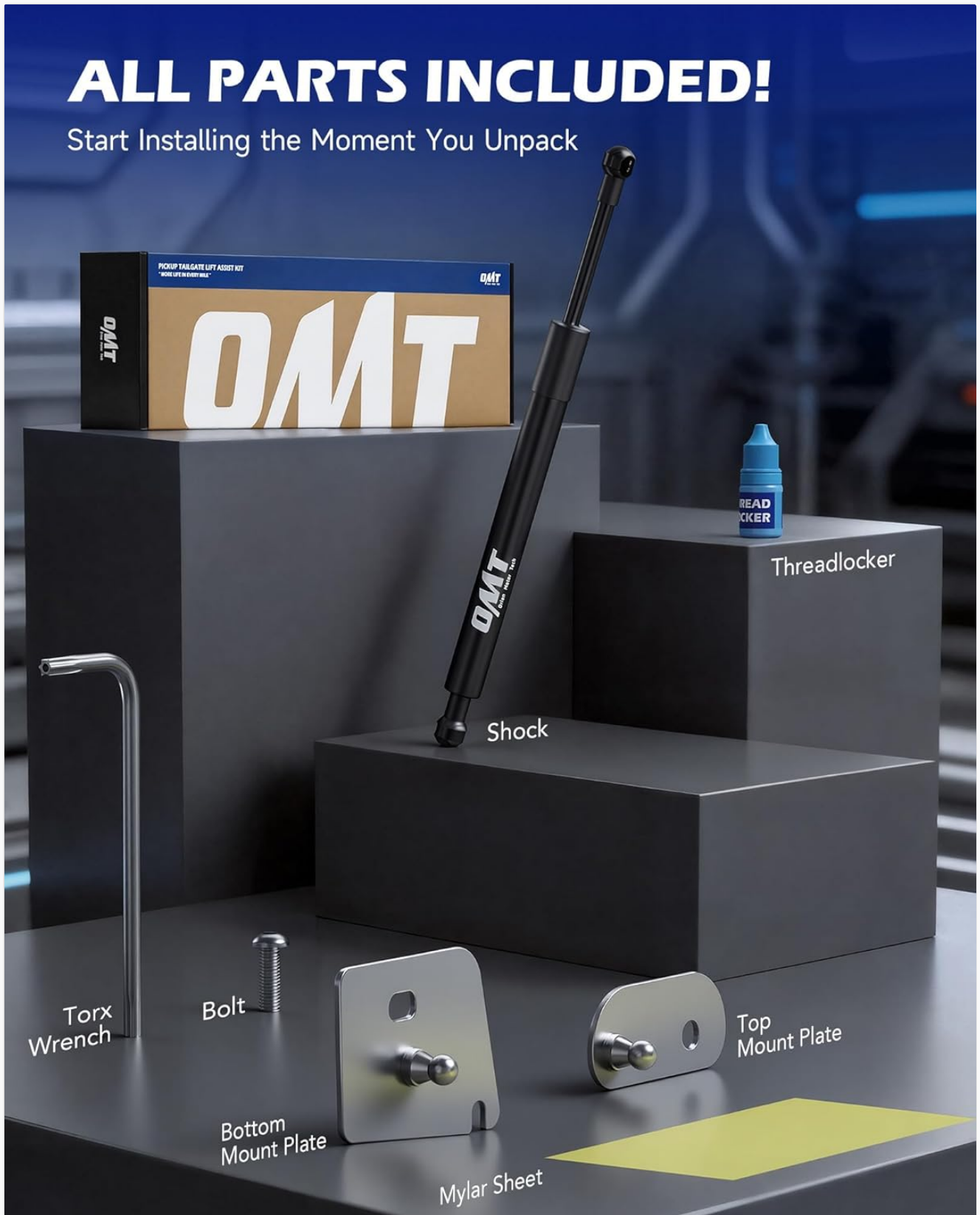
Figure 1: All components included in the kit.