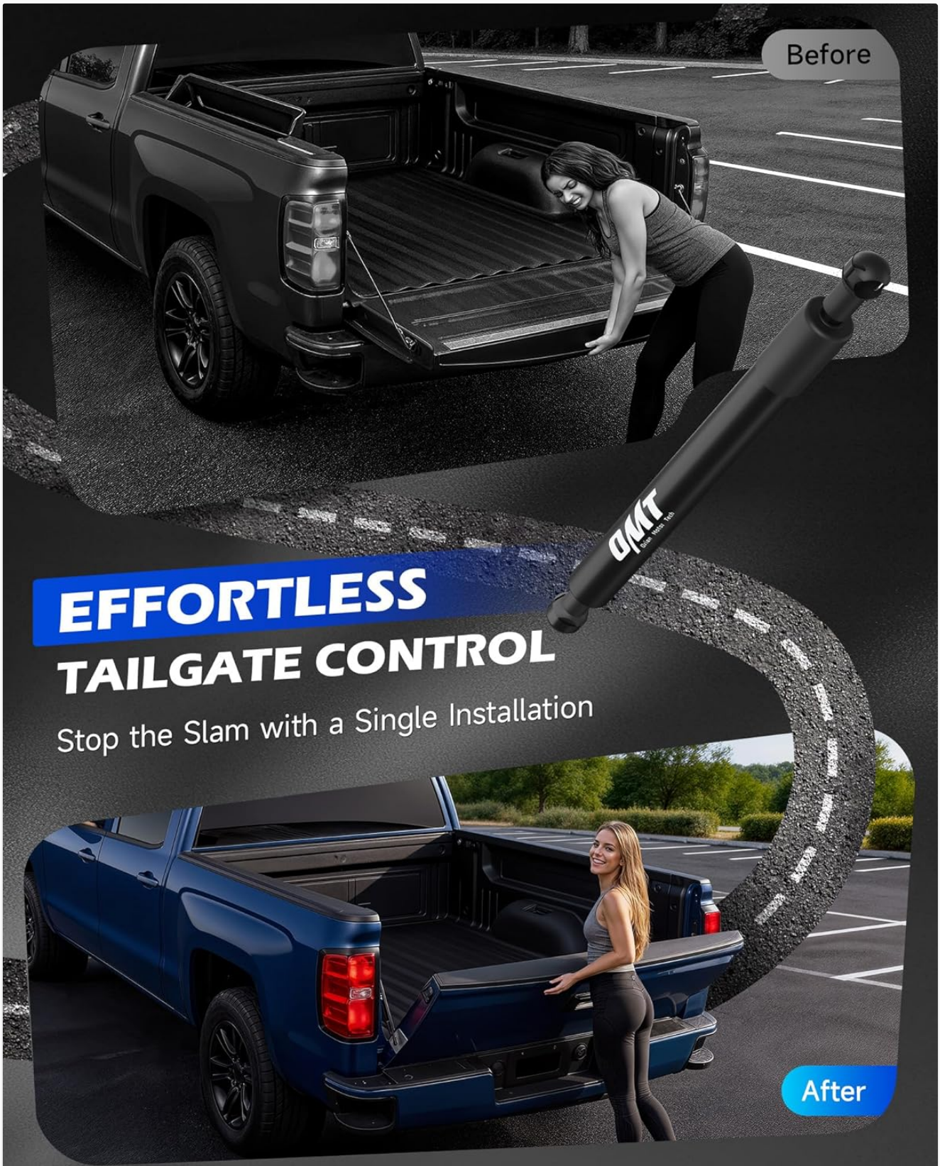
Figure 4: Demonstrates the controlled tailgate lowering provided by the assist shock.