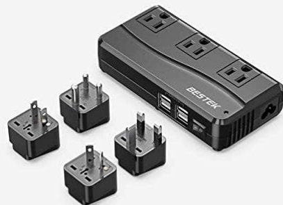
Figure 2: The compact design makes it ideal for travel.

Small and lightweight, easy to carry wherever you go