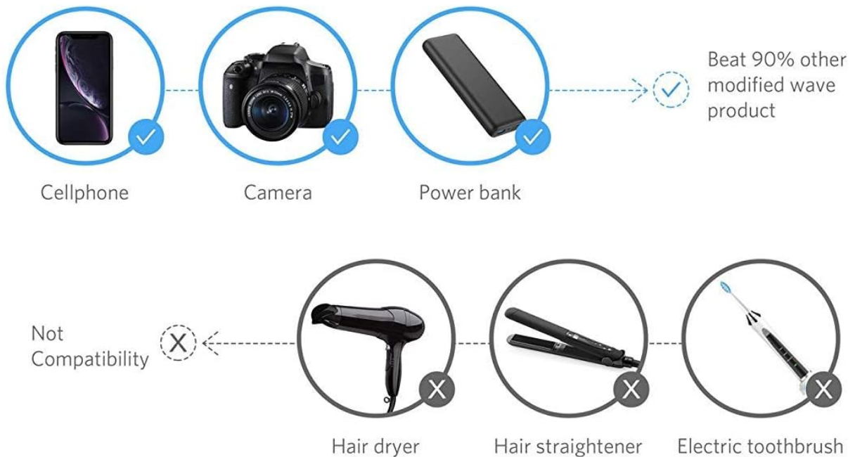
Figure 7: Visual guide to compatible and incompatible devices.