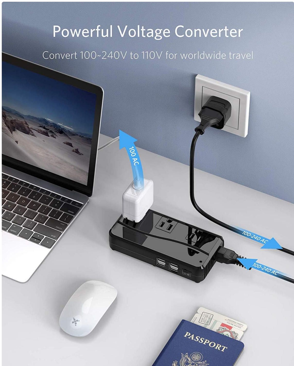
Figure 4: Connecting the adapter to a wall outlet.