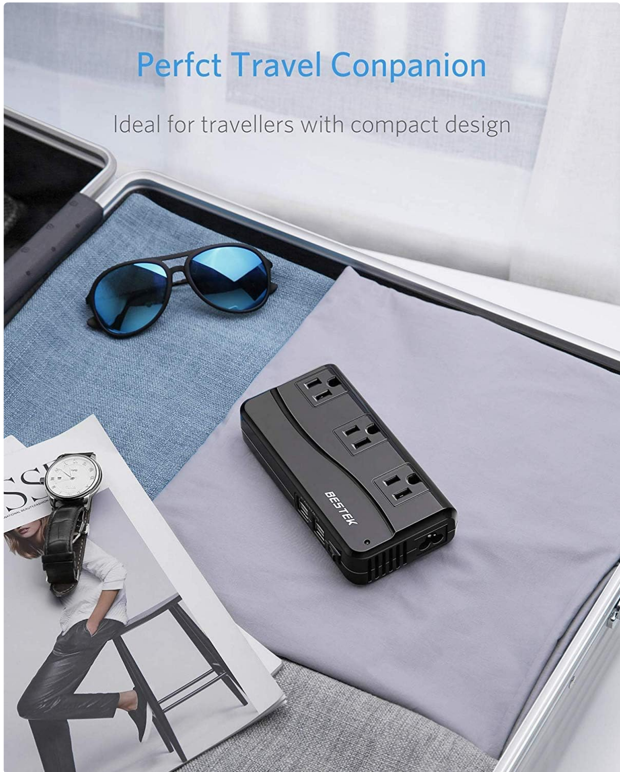
Figure 8: Proper storage in luggage for travel.