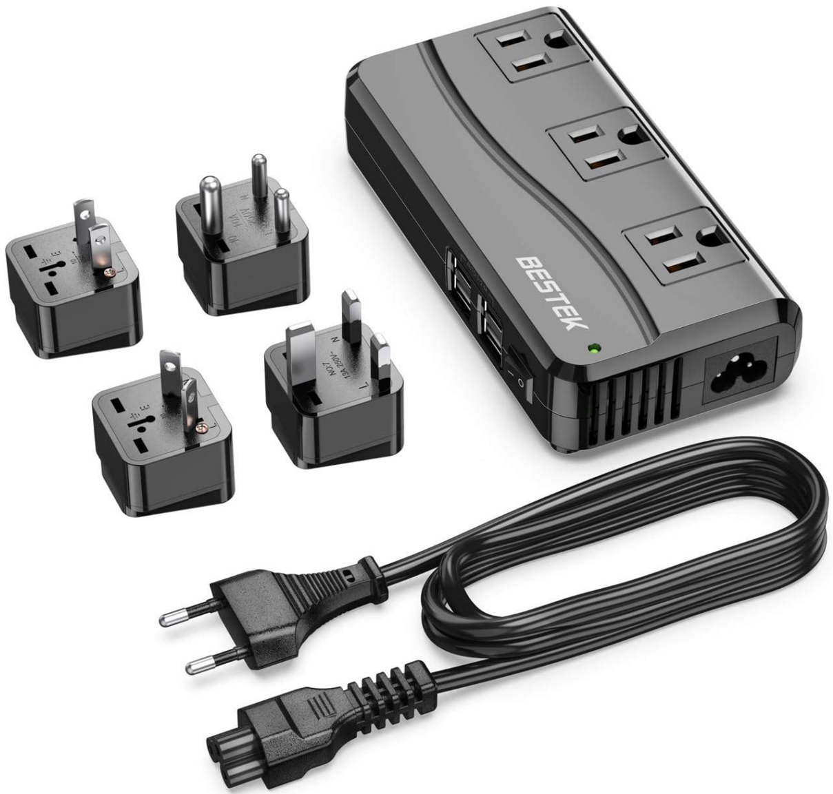
Figure 1: BESTEK Universal Travel Adapter and included international plug adapters.