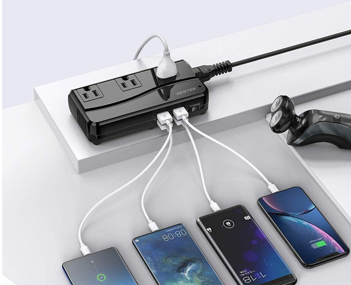
Figure 6: Multiple devices connected for charging.

Video 1: Demonstration of the BESTEK Universal Travel Adapter with 6A 4-Port USB Charging.