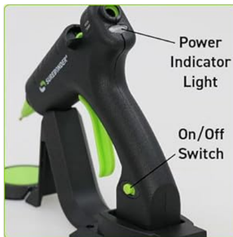
Figure 4: Power indicator light and ON/OFF switch location.

Locate the ON/OFF switch on the side of the glue gun. Slide the switch to the 'ON' position. A power indicator light will illuminate, indicating the gun is heating.