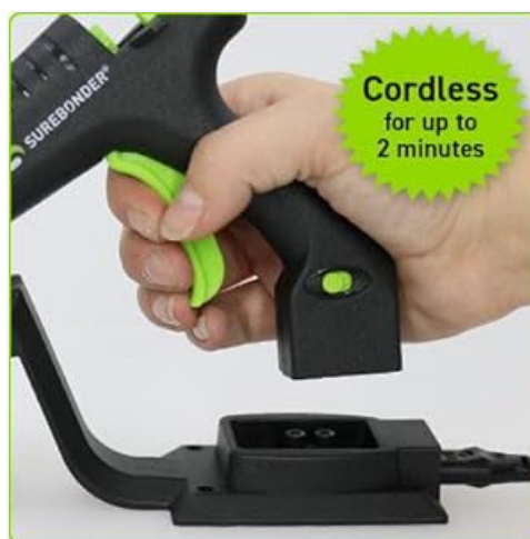
Figure 2: Cordless operation by lifting the glue gun from its base.