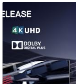
Image: Visual representation of 4K UHD and Dolby Digital Plus technologies.

Experience stunning clarity and vibrant colors with 4K Ultra HD resolution and HDR10 support, delivering enhanced contrast and a wider color spectrum.