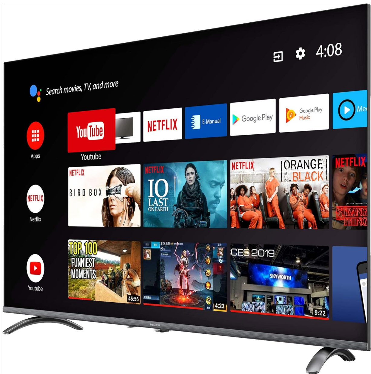
Image: Front view of the Skyworth 55 Inch 4K HDR Smart TV displaying its smart interface with various apps.