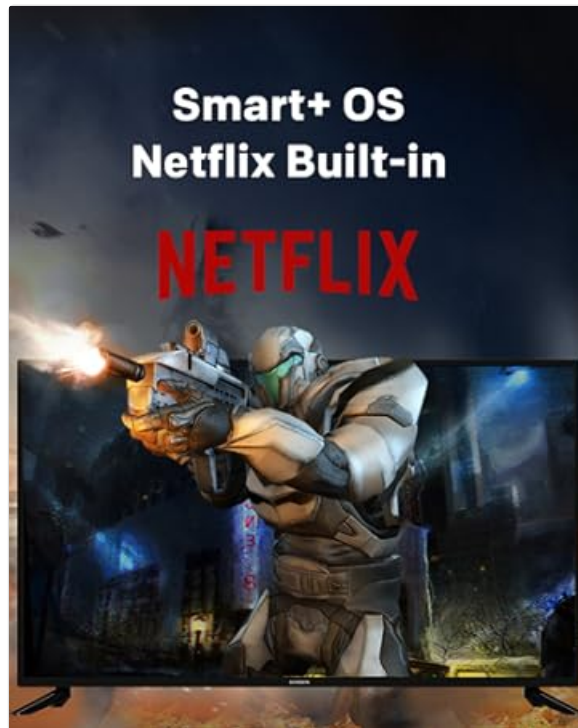
Image: The Netflix logo prominently displayed, indicating built-in streaming capabilities.

Access popular streaming services like Netflix, YouTube, Hulu, and Vudu directly from your TV. Chromecast built-in allows you to cast content from your mobile devices to the big screen.