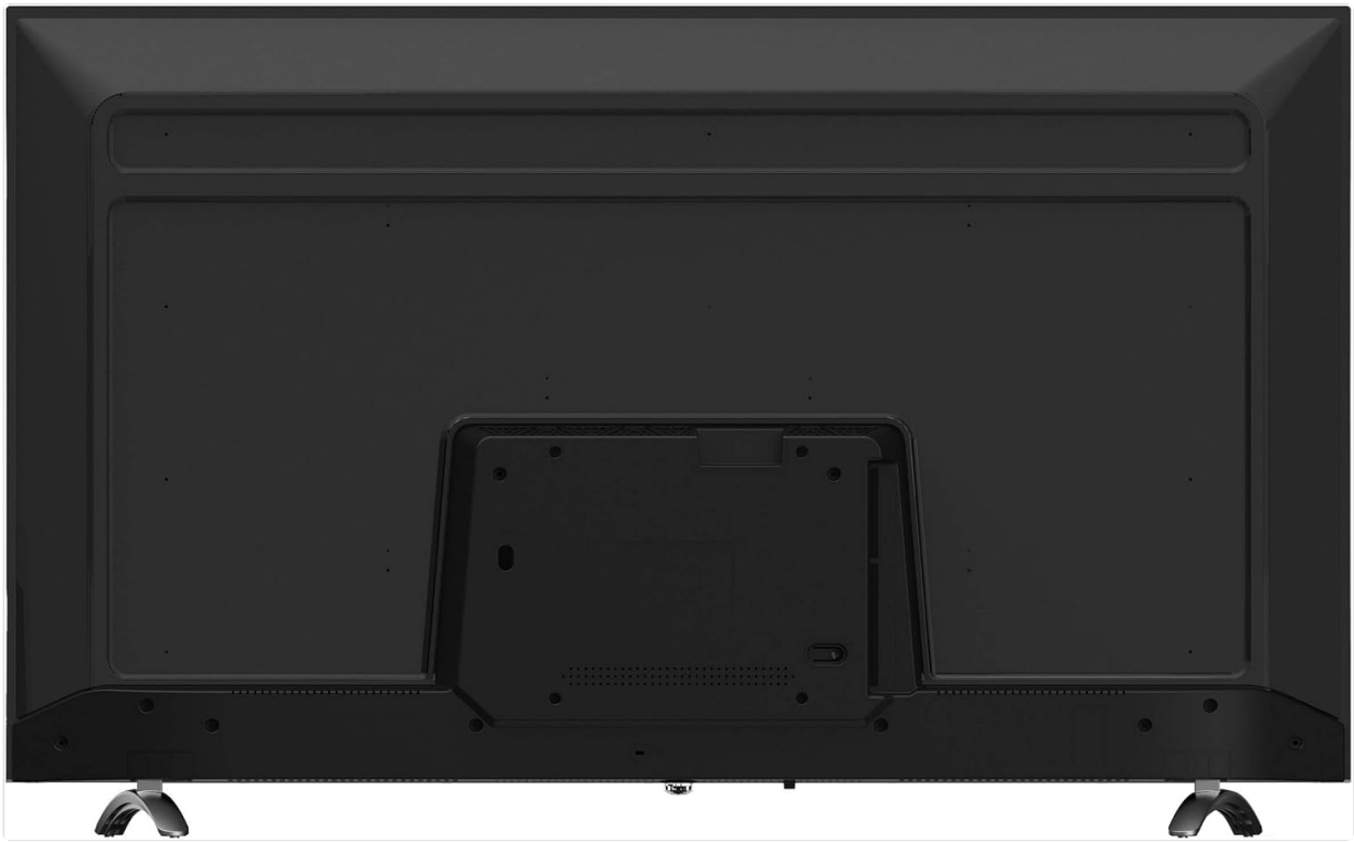
Image: Rear view of the Skyworth 55 Inch 4K HDR Smart TV, highlighting the input ports for connectivity.