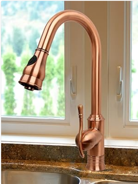
Figure 6.1: Daily Maintenance. Regularly wipe the faucet with a soft cloth to maintain its finish.