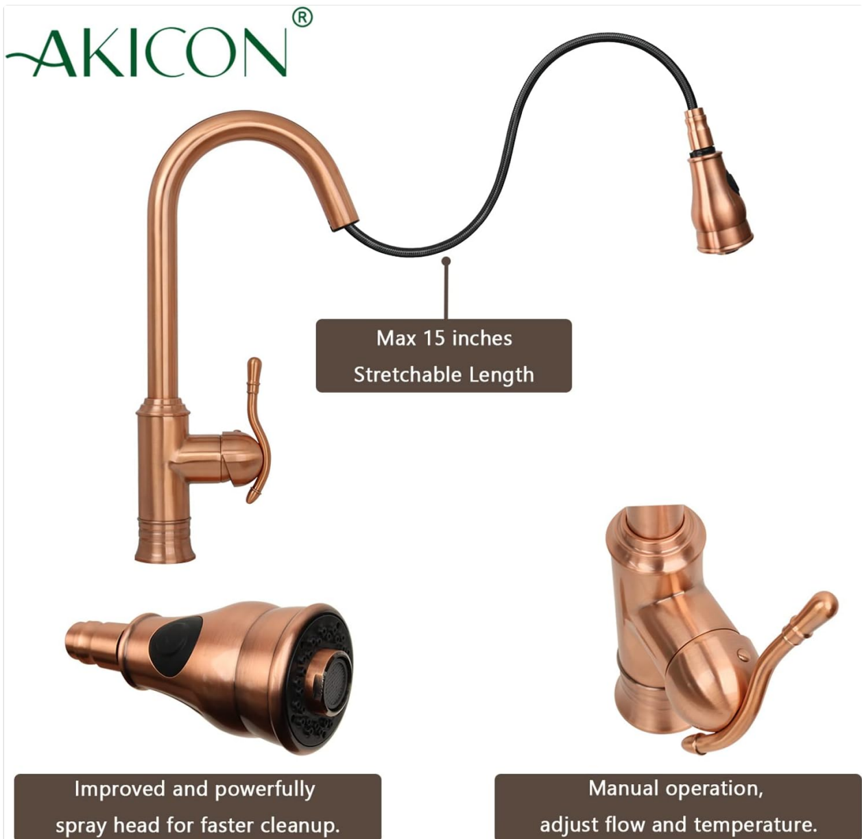
Figure 5.2: Pull-Down Sprayer. The hose offers a maximum stretchable length of 15 inches for enhanced reach.