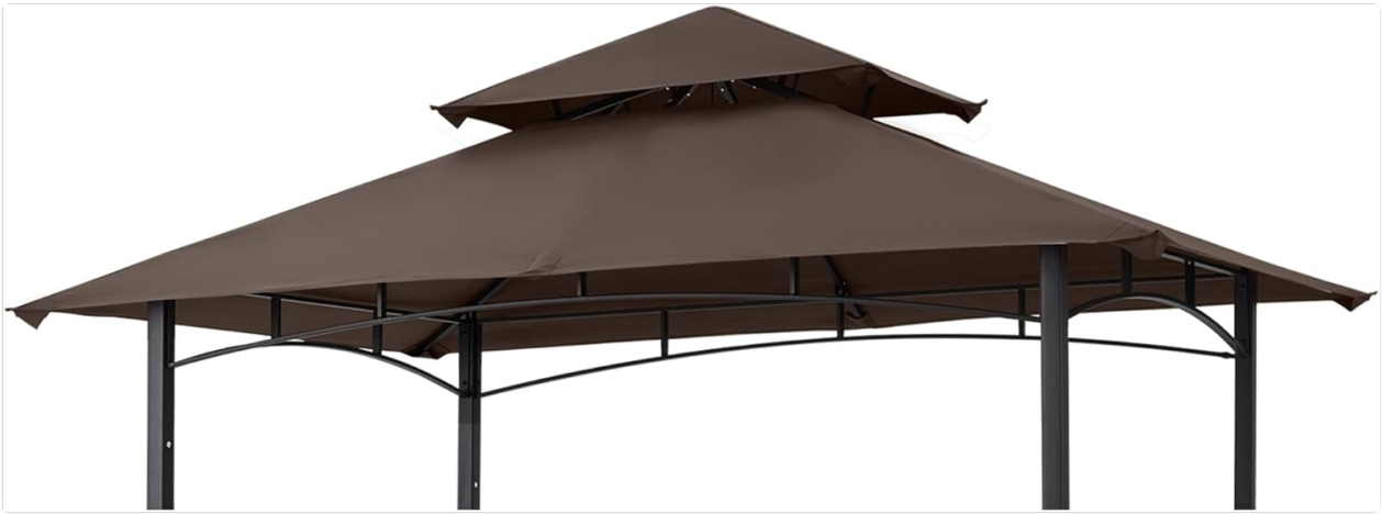
Figure 1: The MASTERCANOPY Grill Gazebo Replacement Canopy Top installed on a frame.