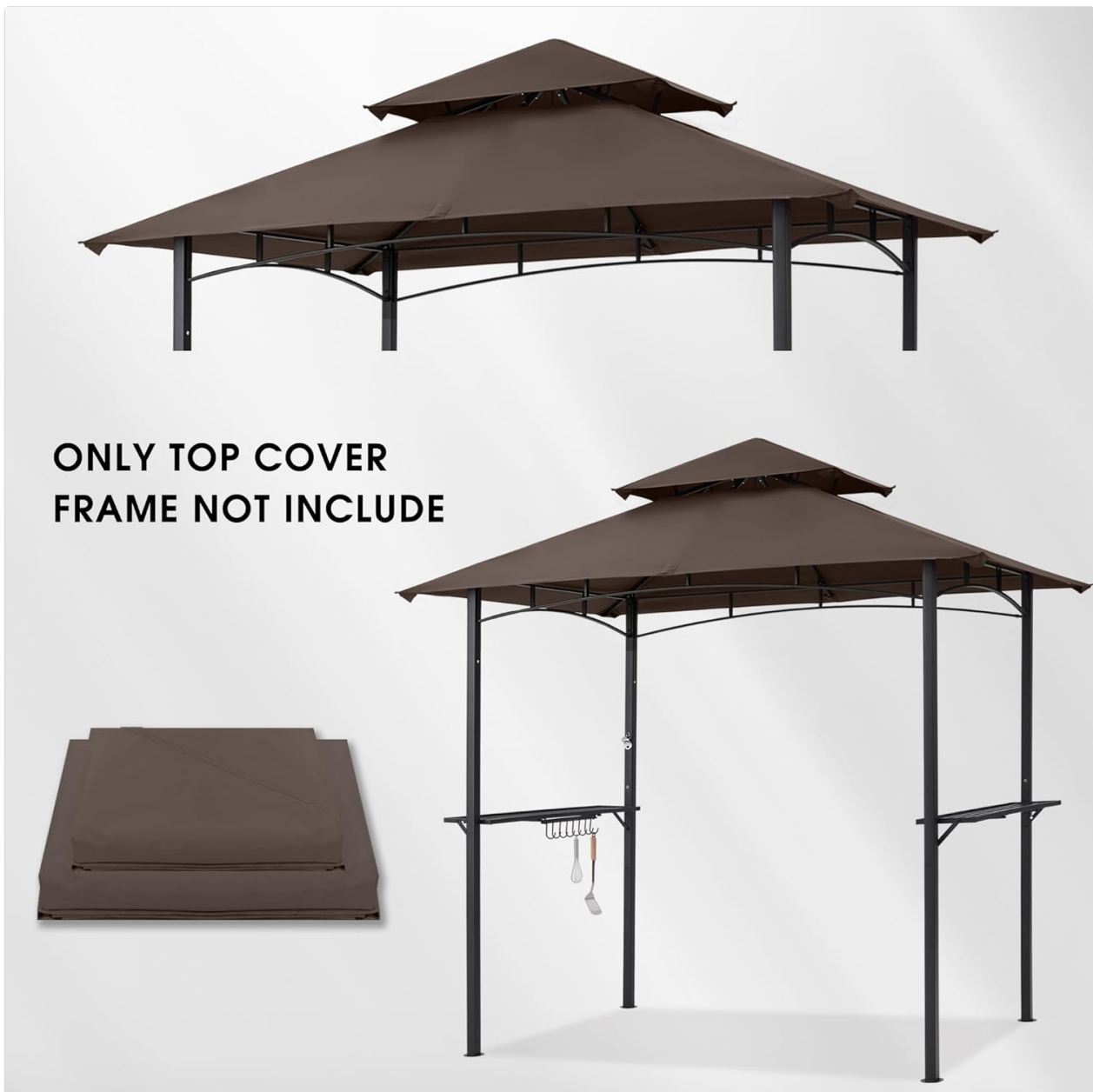
Figure 5: The replacement canopy fabric is sold separately; the frame is not included.