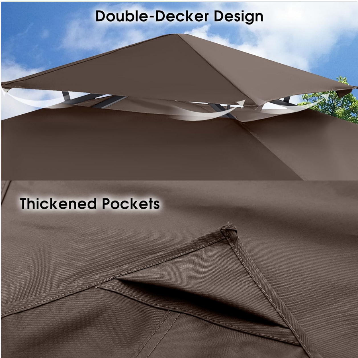
Figure 2: Detail of the double-decker design and thickened corner pockets for durability.