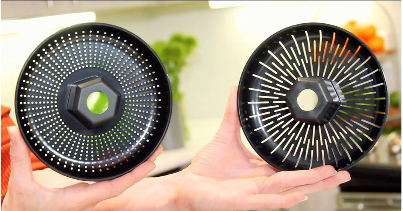
The two interchangeable pulp filters: Low Pulp (left) and High Pulp (right).