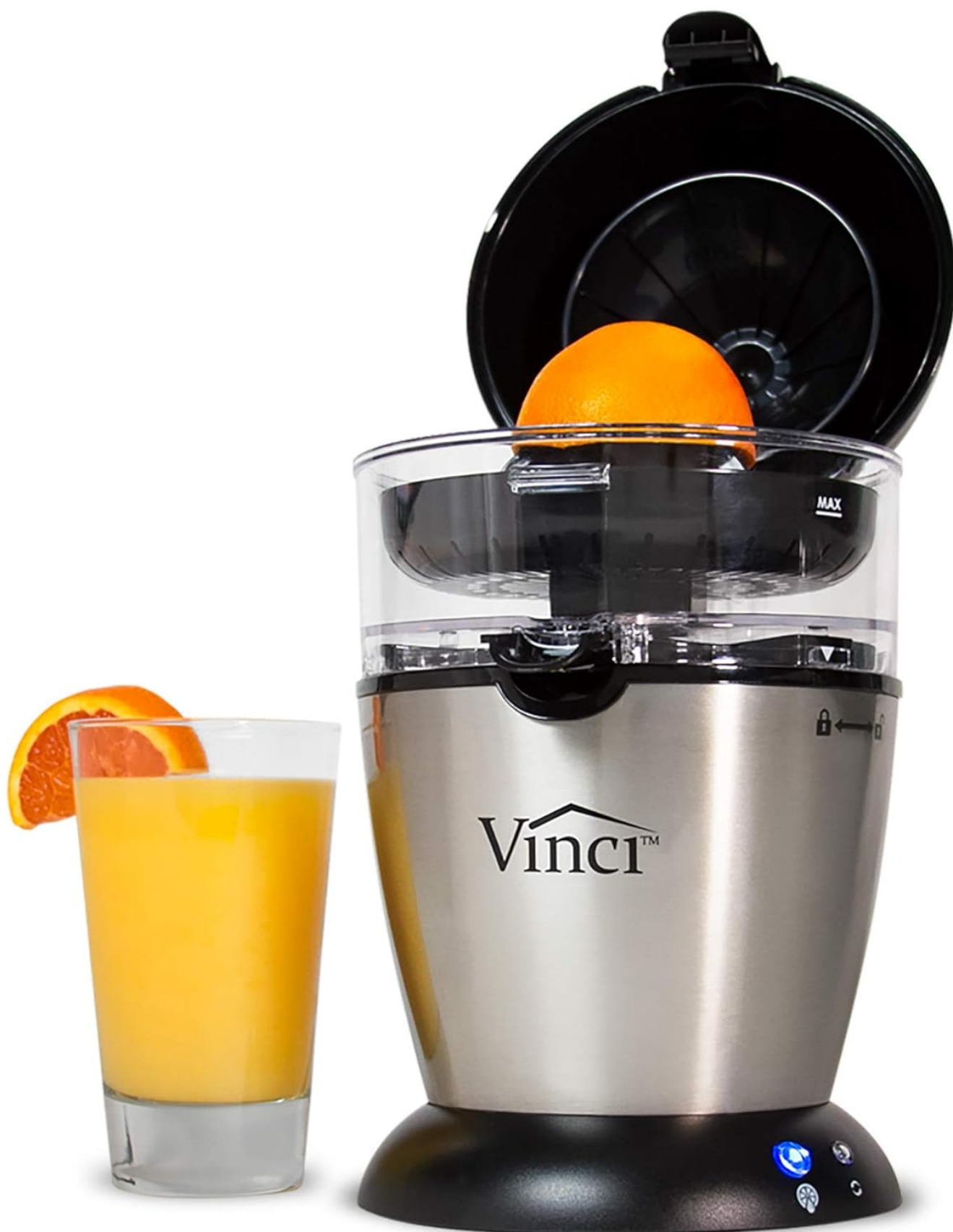
The Vinci Hands Free Electric Citrus Juicer, ready to extract fresh juice, shown alongside a glass of freshly squeezed orange juice.