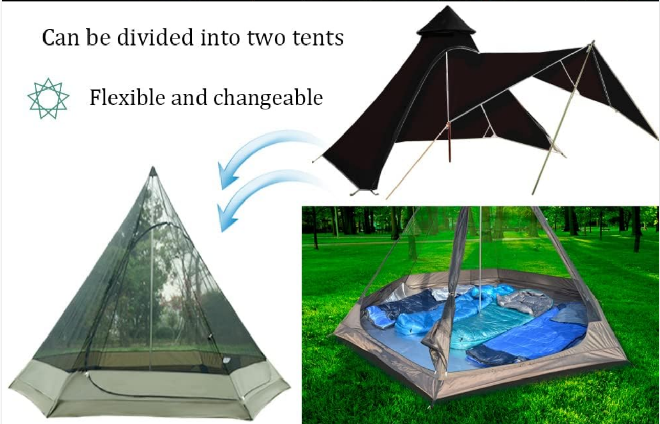
Figure 4.4: Tent's flexible and changeable configuration.