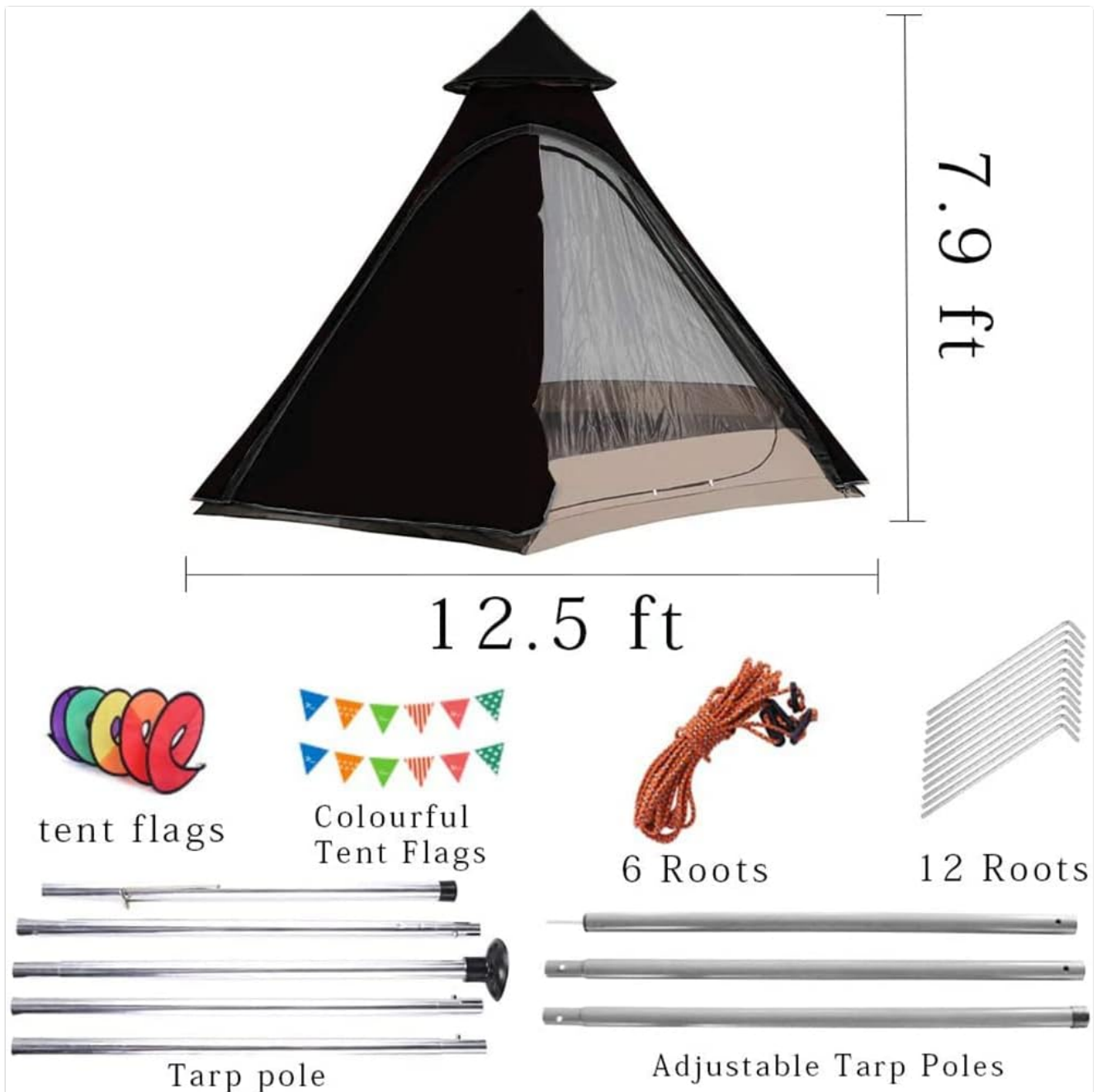
Figure 2.1: Tent dimensions and included components.