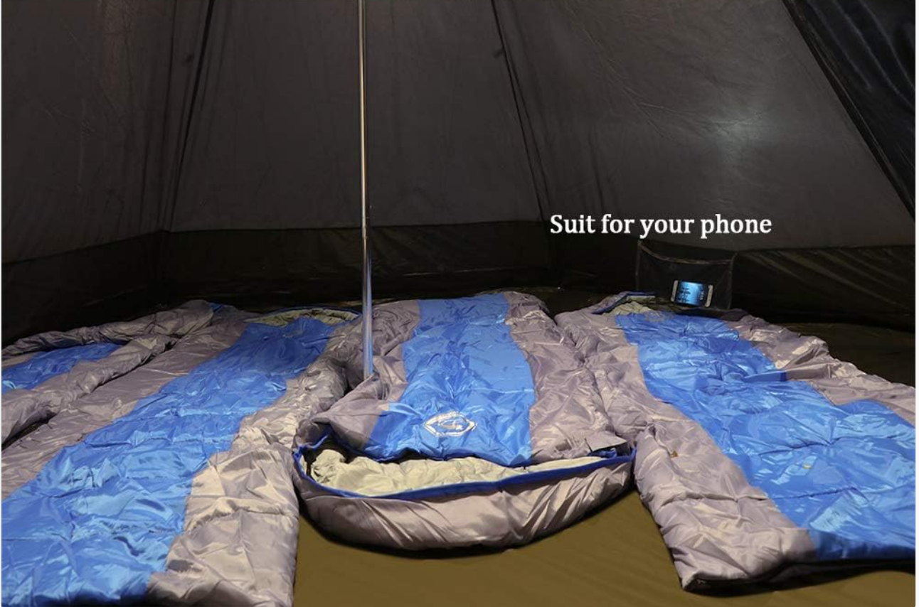
Figure 4.2: Illuminated interior at night.