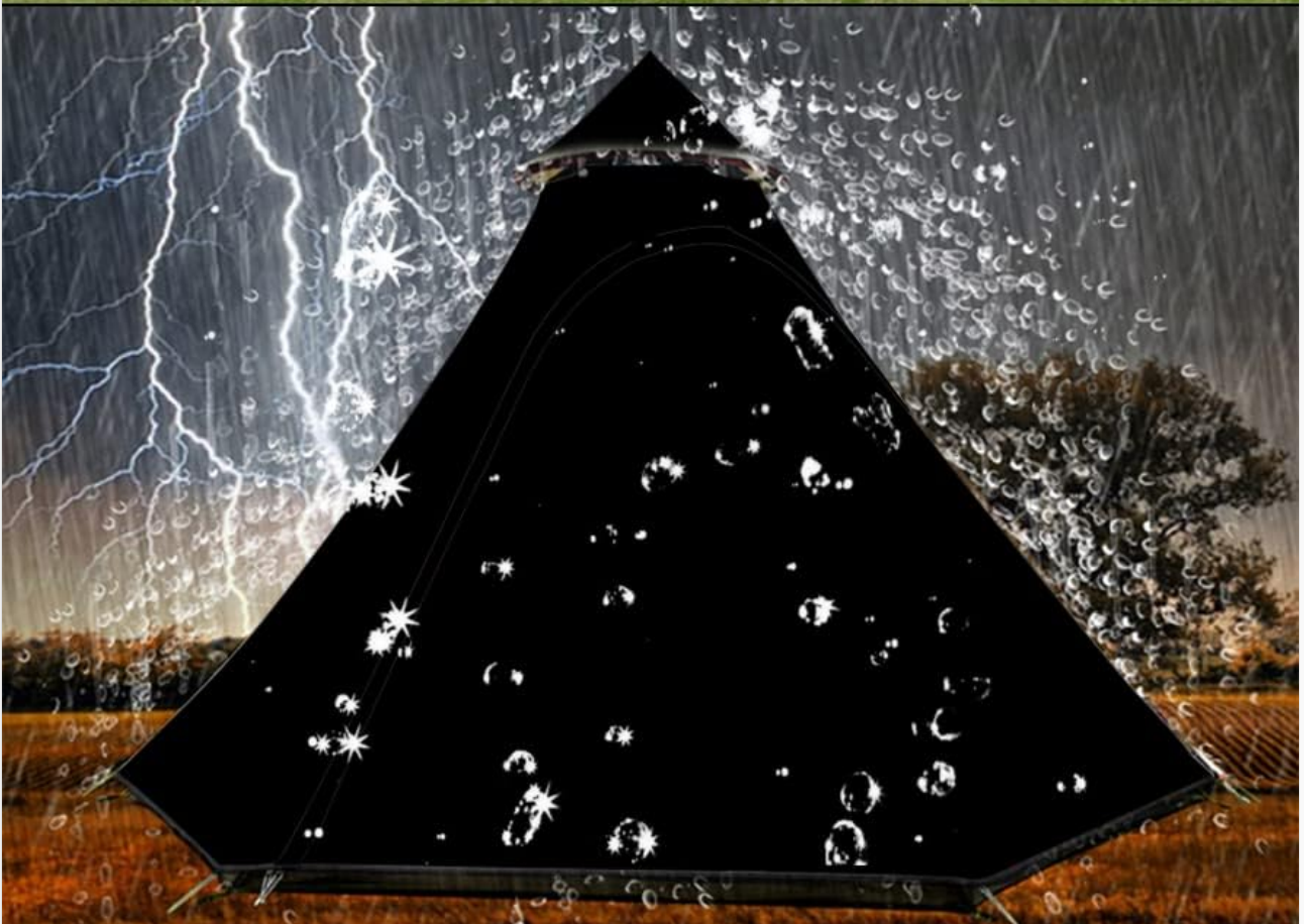
Figure 4.3: Ventilation and waterproof features.