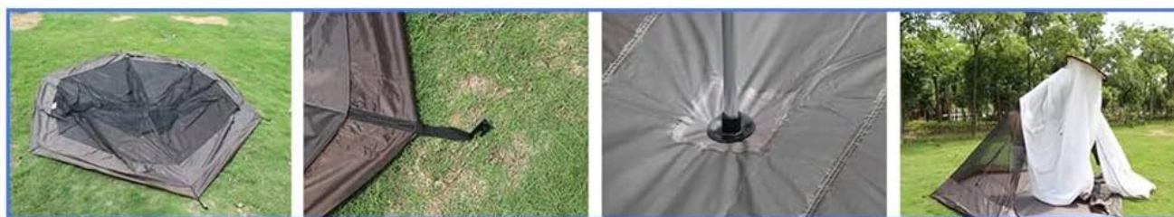
Figure 3.1: Visual guide for tent installation.

Finally, the six corners of the outside tent are fixed with nails.