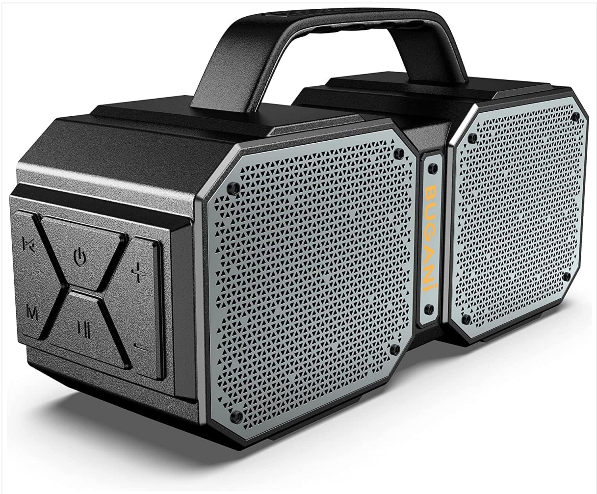
Image: The BUGANI Shock Bluetooth Speaker M83-SPEAKER shown with its included Type-C charging cable, AUX cable, and user manual.