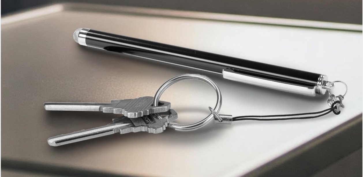
Image: The stylus shown with a keychain attachment, demonstrating its on-the-go convenience.

Always have EverTouch on hand with the included keychain attachments.