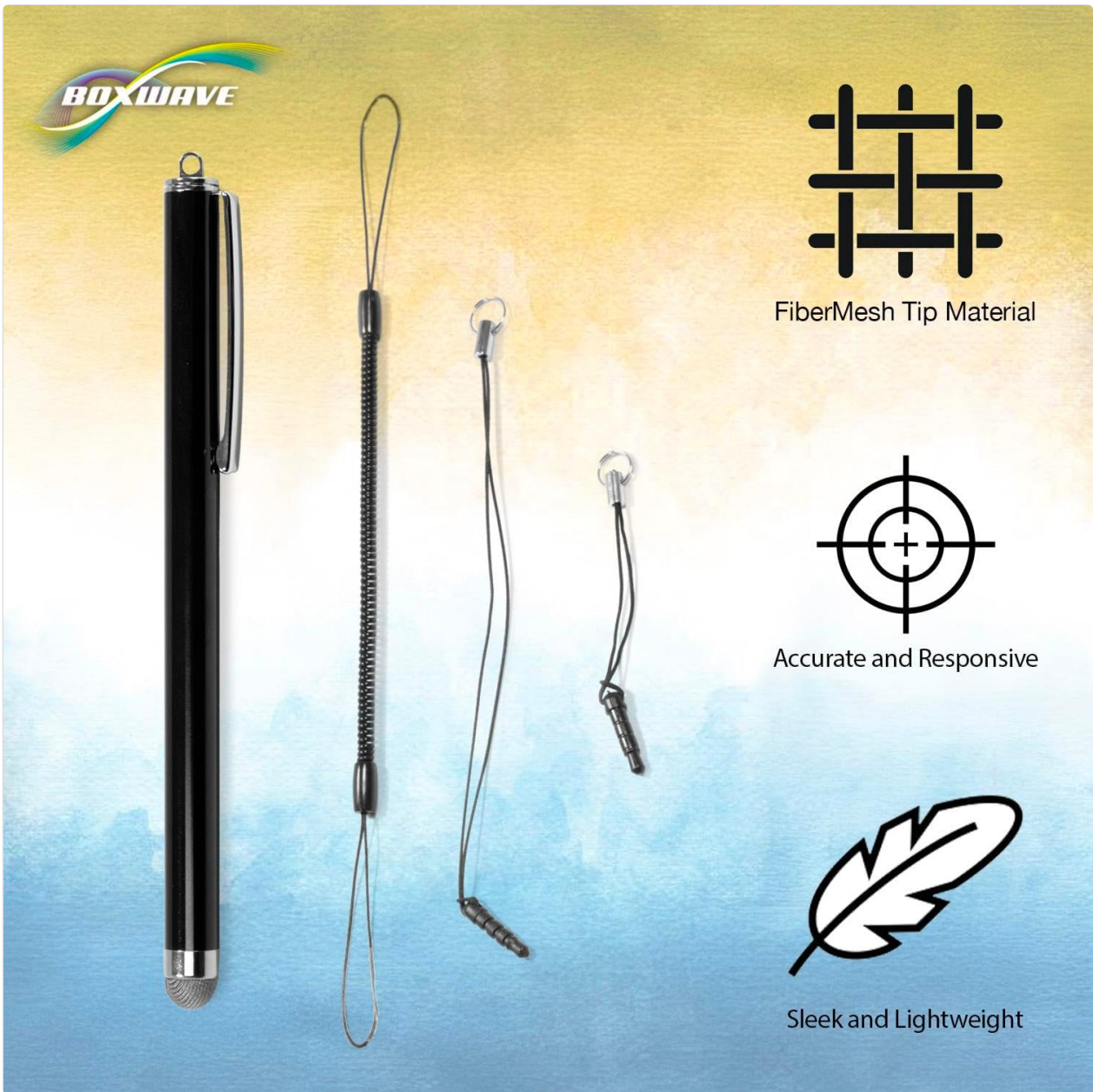
Image: Visual representation of key features: FiberMesh Tip material, accurate and responsive performance, and sleek, lightweight design.