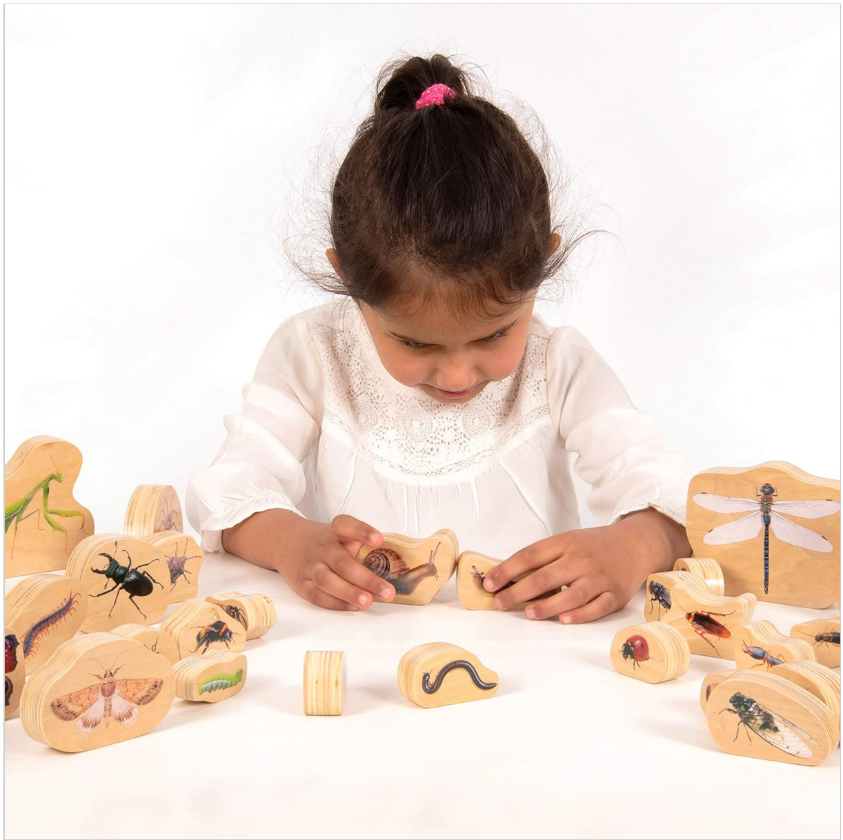
This image illustrates a young child engaged in play with the TickiT Wooden Minibeast Blocks. The child is seen interacting with several blocks, demonstrating how they can be used for imaginative play and arrangement.