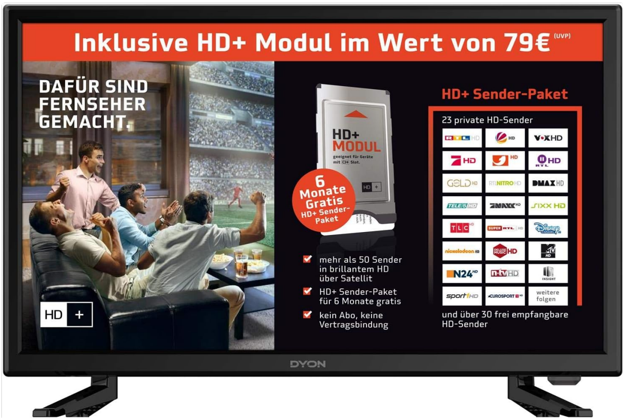
Figure 1.1: The DYON Live 22 Pro HD+ Edition television, showcasing its display with a sports broadcast and an advertisement for the included HD+ module, highlighting its features and channel package.