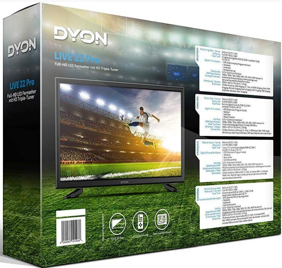
Figure 2.2: Rear view of the DYON Live 22 Pro HD+ Edition TV packaging box, showing various specifications and connection details in multiple languages.