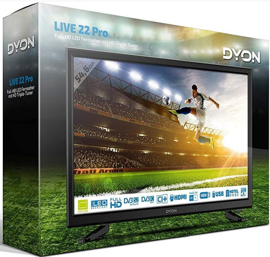
Figure 2.1: Front view of the DYON Live 22 Pro HD+ Edition TV packaging box, displaying the product image and branding.