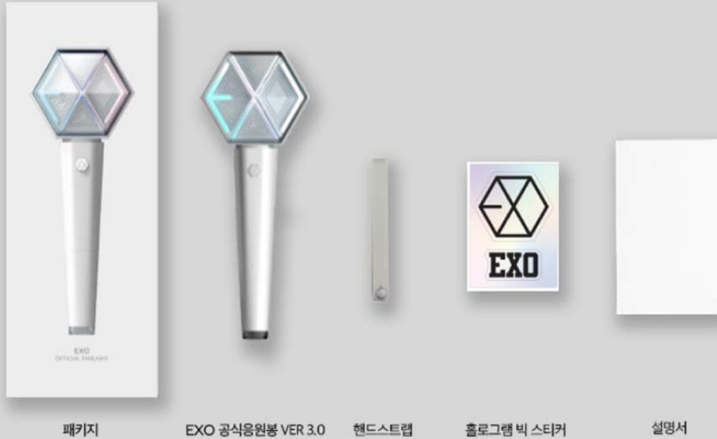
Image 2: Contents included with the EXO Official Lightstick Version 3, showing the lightstick, hand strap, sticker, and manual.