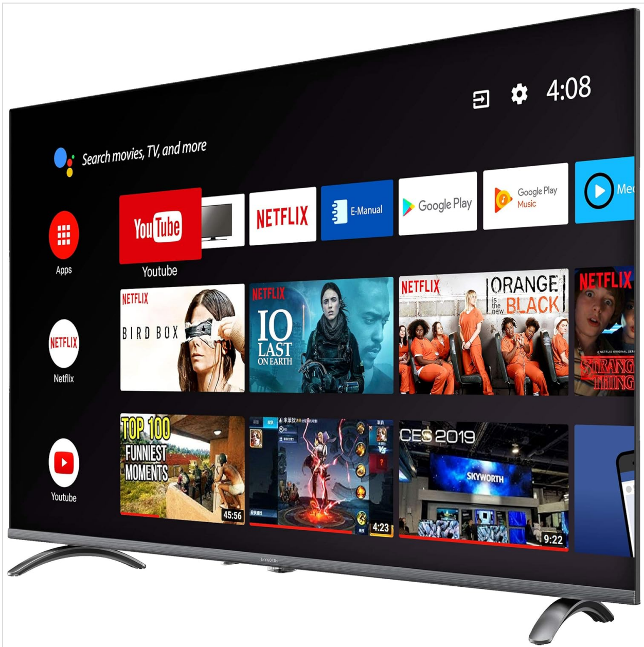
Image: The Android TV home screen with various streaming applications.