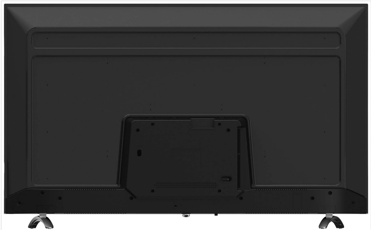
Image: Rear view of the TV, highlighting input ports and VESA mounting points.

If you plan to wall mount your TV, refer to the VESA mounting pattern: 200 x 100mm. Use a compatible wall mount bracket (sold separately) and follow the instructions provided with the wall mount. Ensure the wall can support the TV's weight.