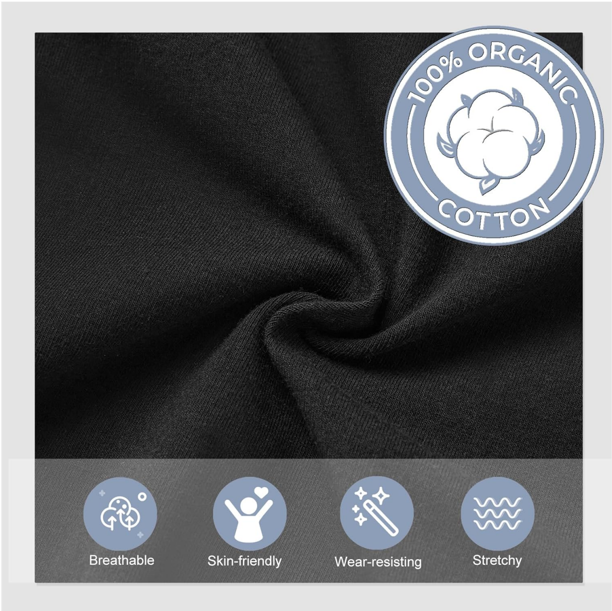
Image 2.1: Close-up view of the leotard's cotton-Lycra blend fabric, highlighting its texture and stretch.