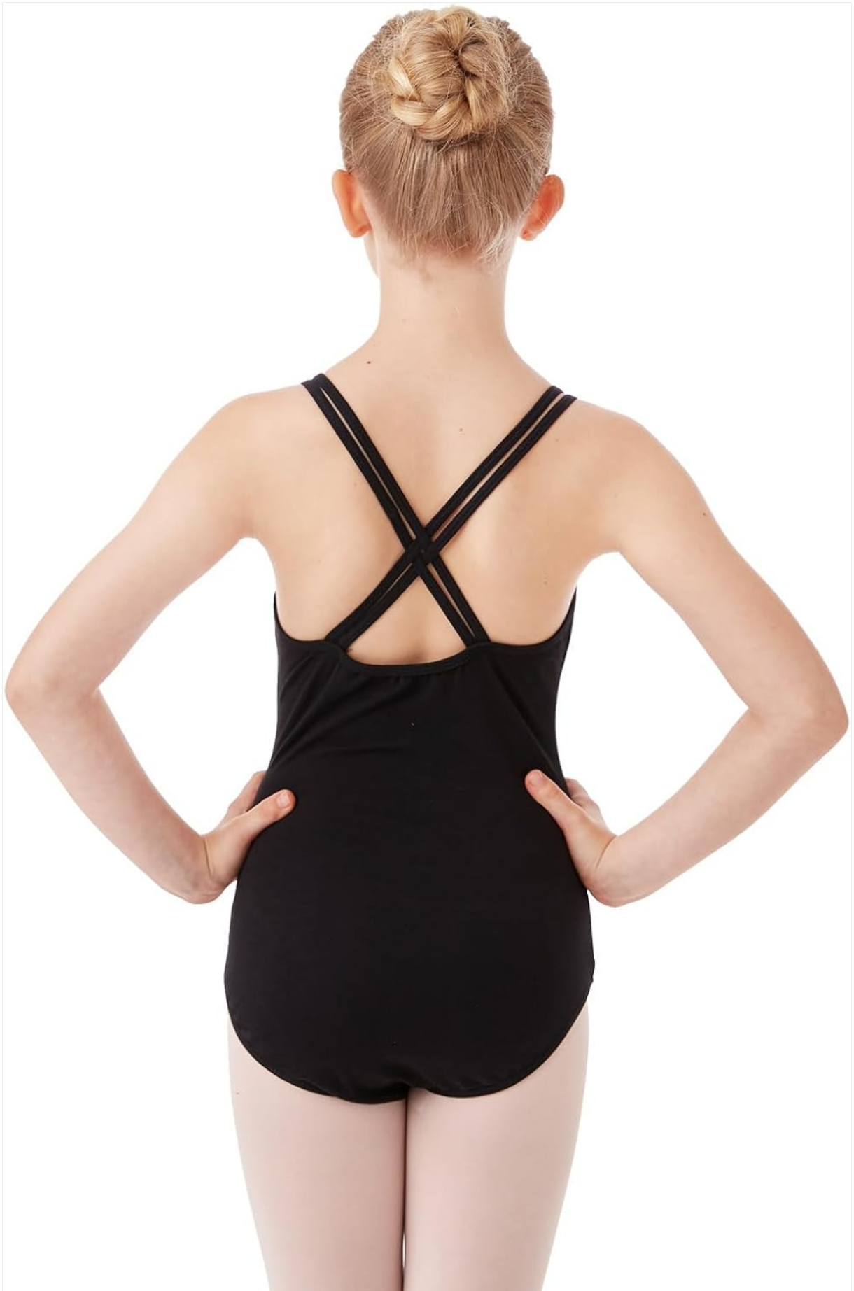
Image 4.2: Back view of the leotard, illustrating the double strap racerback design.