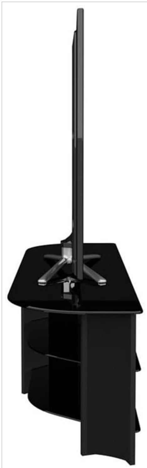
Figure 3: The AVF Varano TV Stand with a television and components in use.