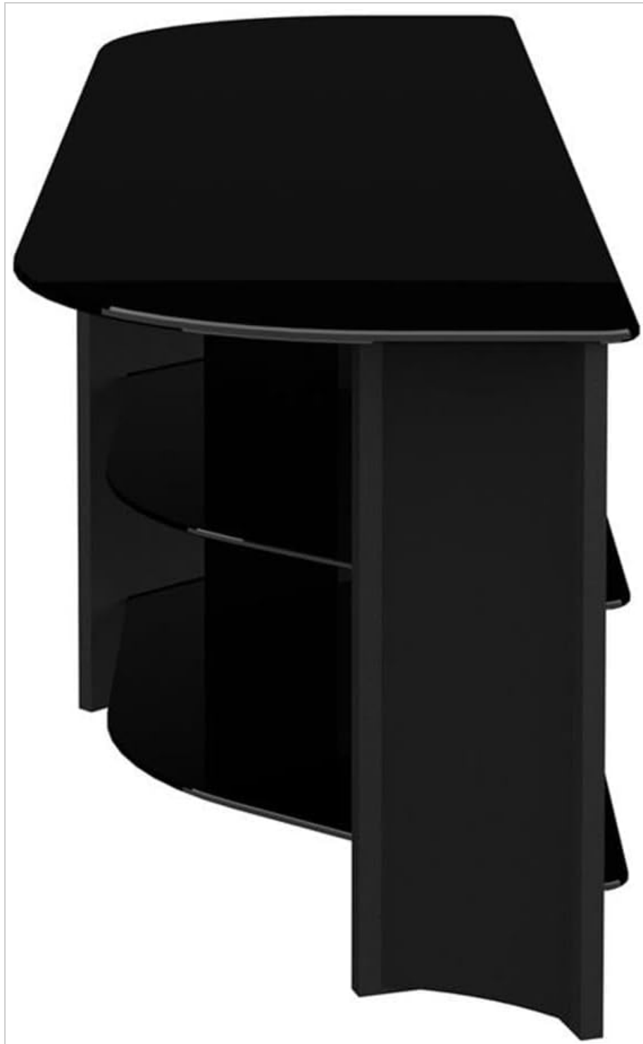
Figure 2: Assembled views of the TV stand, showing front and side profiles.