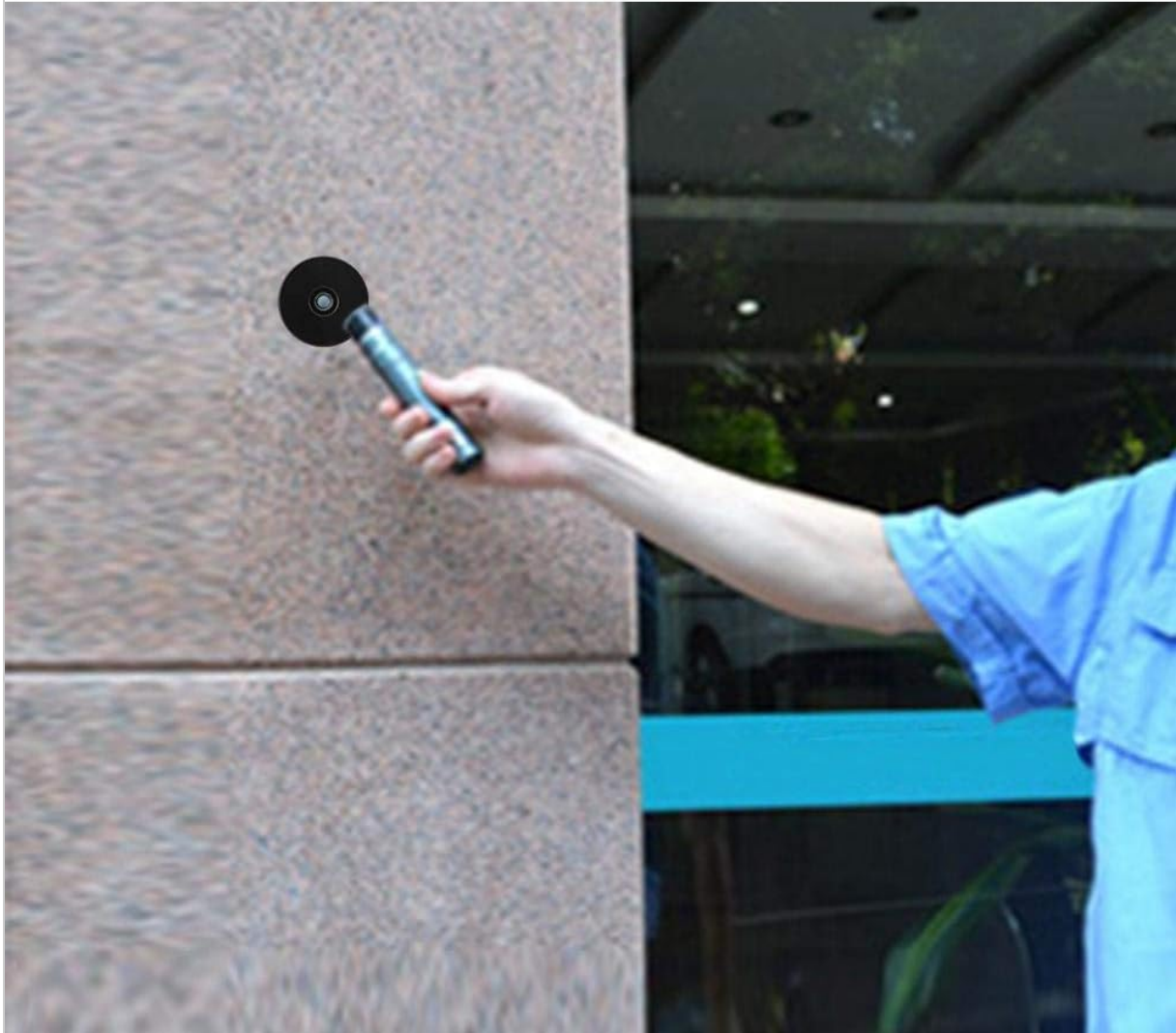
Image: An individual demonstrating the use of an RFID reader to scan a tag affixed to a wall, illustrating typical operation in a guard tour system.

It works by installing a series of RFID tags along the route (each tag has a unique global identification number) and allowing patrol personnel to read the tag using a handheld reader.