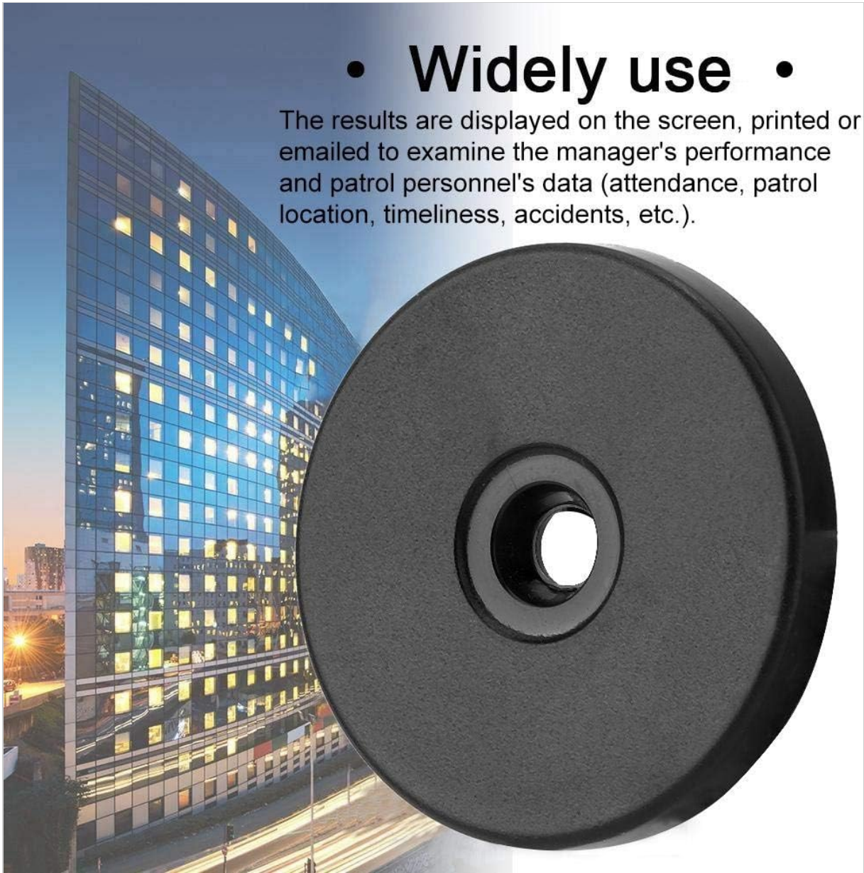
Image: A close-up of an RFID tag with a blurred background of a modern building, symbolizing its broad utility in various environments.

The results are displayed on the screen, printed or emailed to examine the manager's performance and patrol personnel's data (attendance, patrol location, timeliness, accidents, etc.).