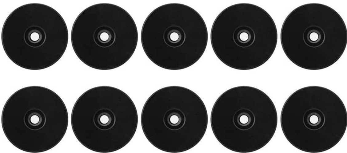
Image: A set of ten black circular RFID EM ID inductive tags, showcasing the quantity included in the package.

Each tag is constructed from high-quality ABS plastic, providing durability and resistance to environmental factors.