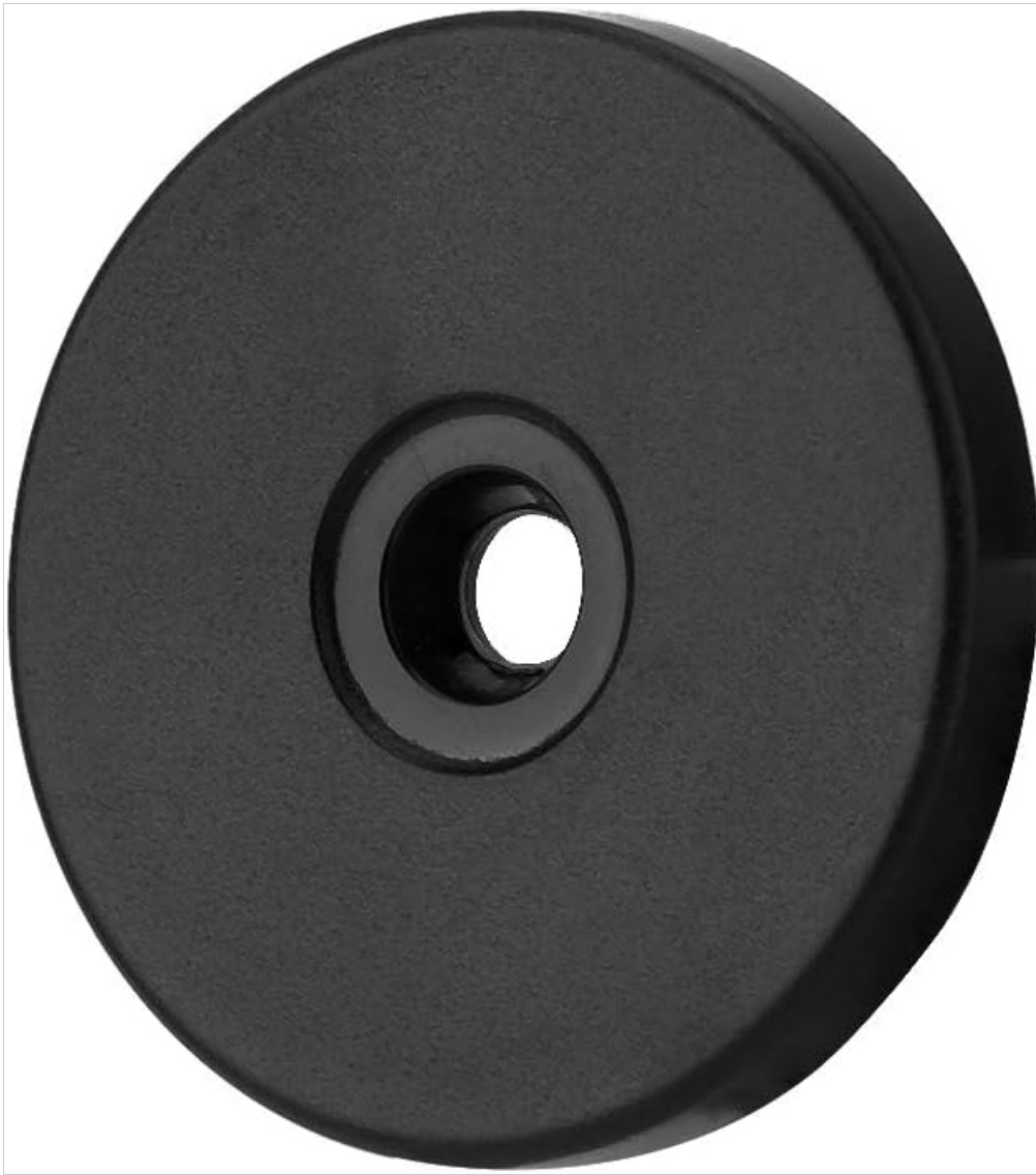
Image: A detailed view of a single black RFID EM ID inductive tag, highlighting its circular design and central opening.