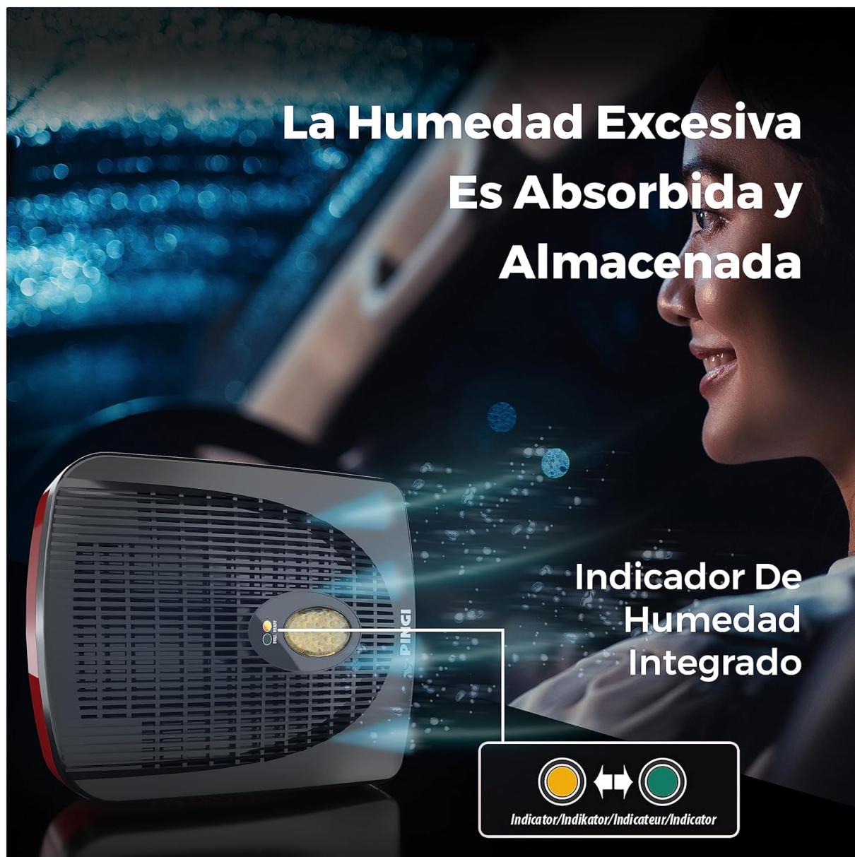
Image: A close-up view of the Pingi ID-A300's humidity indicator, showing the color transition from orange (dry) to green (saturated).