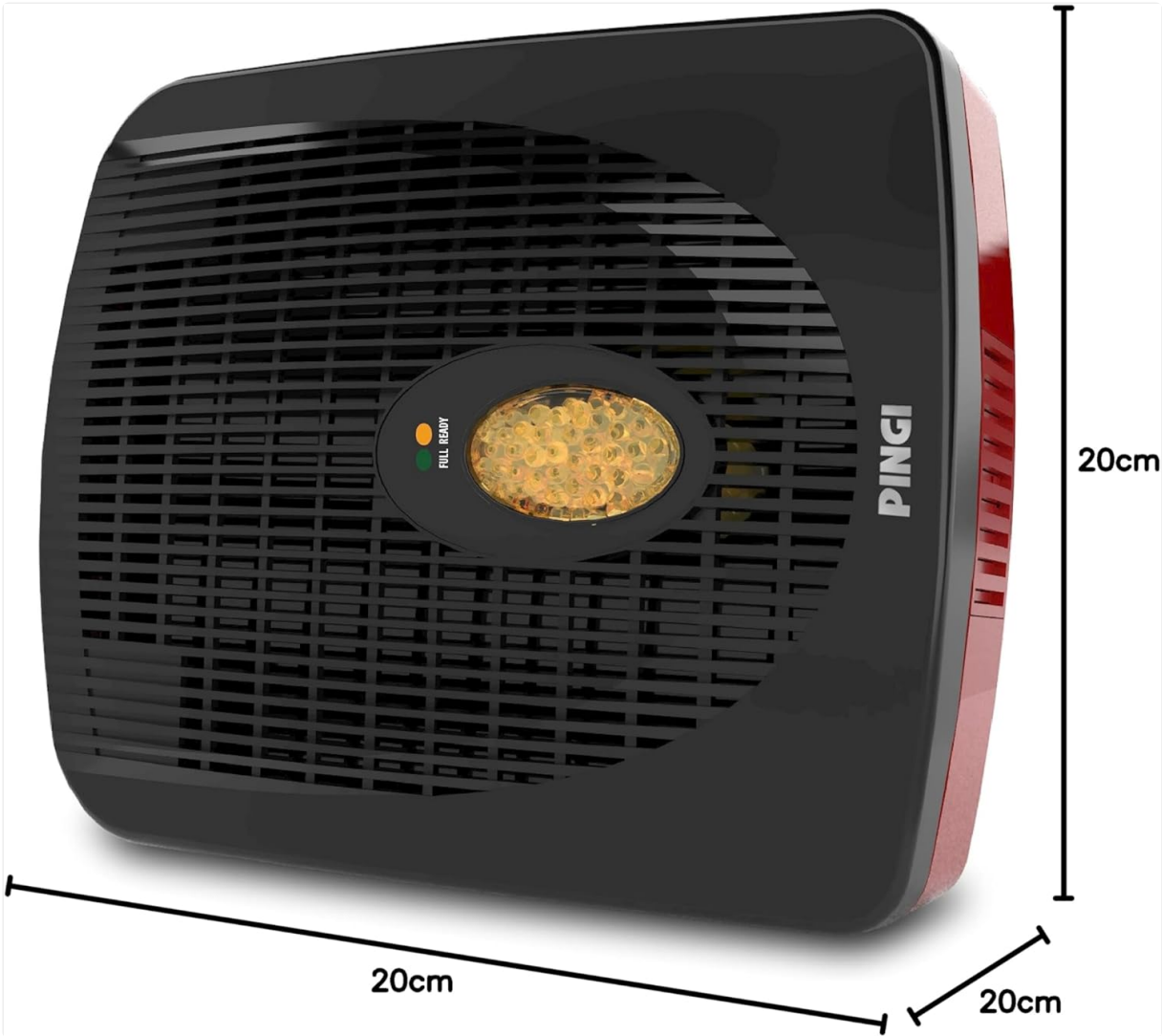
Image: Visual representation of the Pingi ID-A300 dehumidifier with its key dimensions labeled.