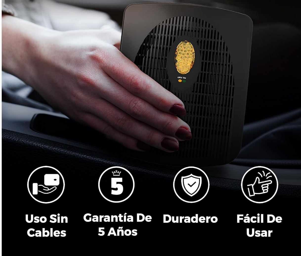
Image: A hand positioning the Pingi ID-A300 dehumidifier on the dashboard of a car, demonstrating typical placement.