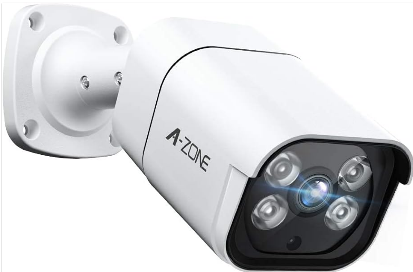
Figure 1: A-ZONE 5 Megapixel POE Security Camera. This image shows the white bullet-style camera with its mounting base, highlighting the lens and infrared LEDs on the front face.

This manual provides detailed instructions for the A-ZONE Two-Way Audio 5 Megapixel POE Powered Security Camera, model AZ-K5P1080-B. This camera is designed for enhanced surveillance, offering high-resolution video and two-way audio communication capabilities.