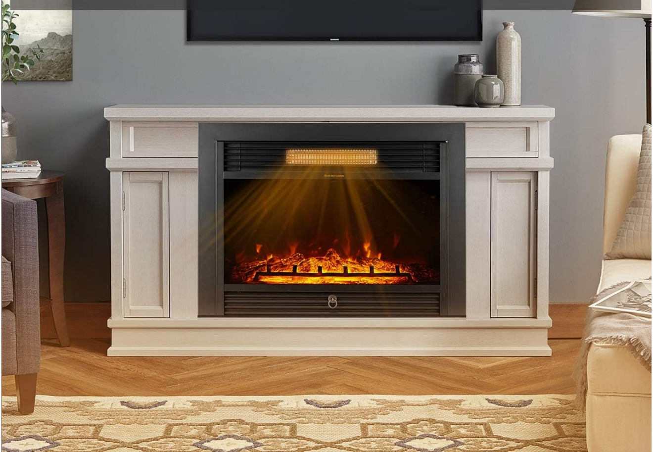
Front view of the YODOLLA 28.5" Electric Fireplace Insert.

[With two alternative heat settings: 750w(2559BTU) and 1500watt (5118BTU).]