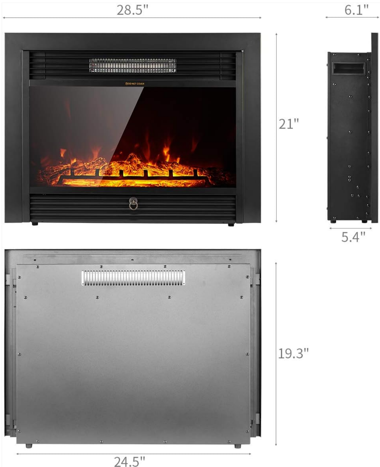
Dimensions of the YODOLLA 28.5" Electric Fireplace Insert.