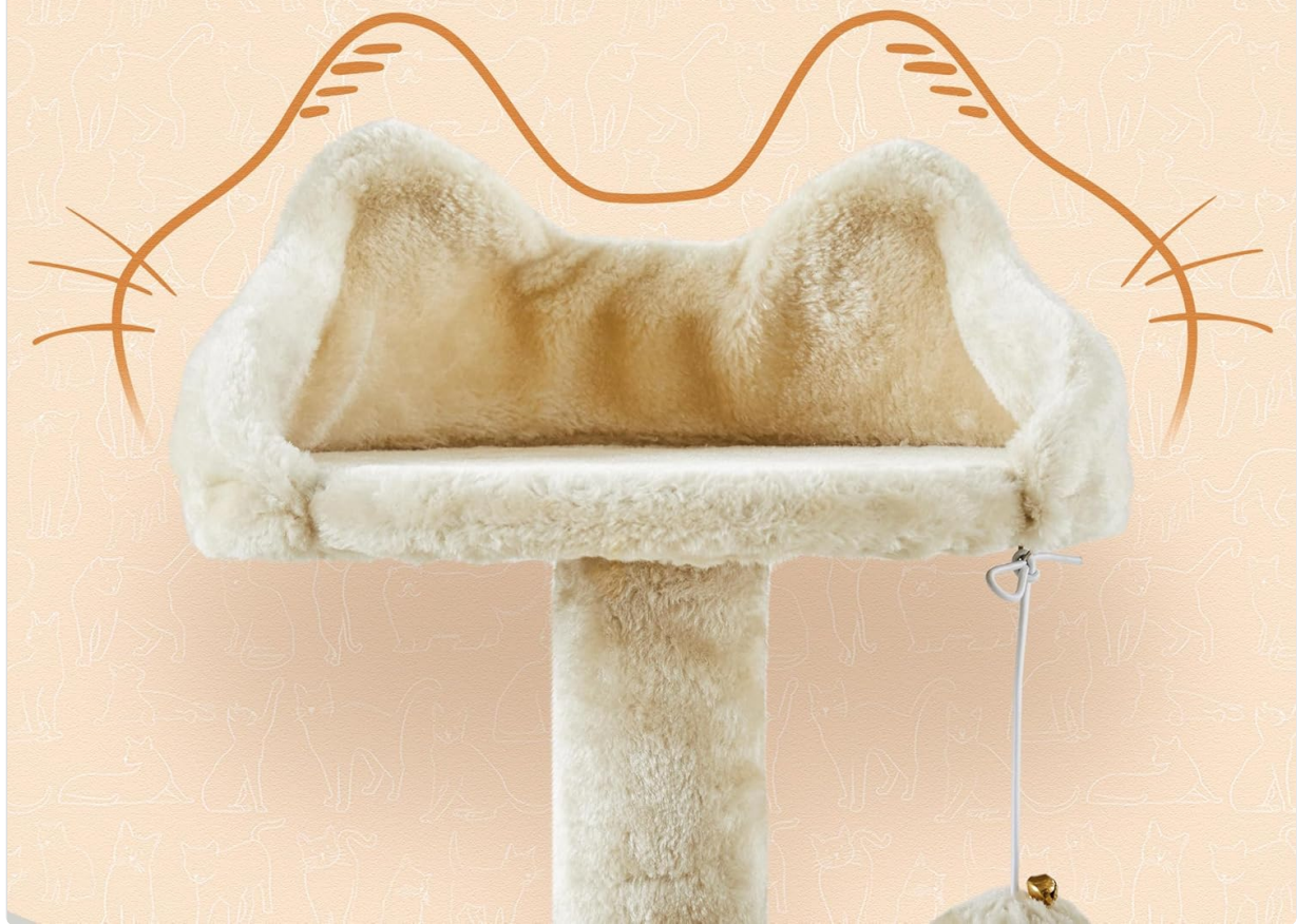
Image: A close-up view of the top perch, featuring a unique cat-ear design for added comfort and aesthetic appeal.