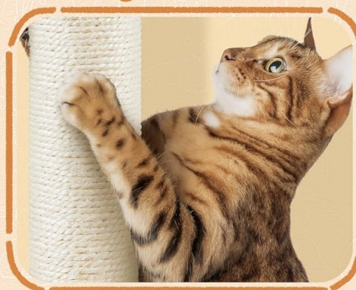
Natural Sisal Post

Image: Detailed view of the materials used in the cat tree: soft plush fabric covering, durable particleboard core, and natural sisal rope on scratching posts.