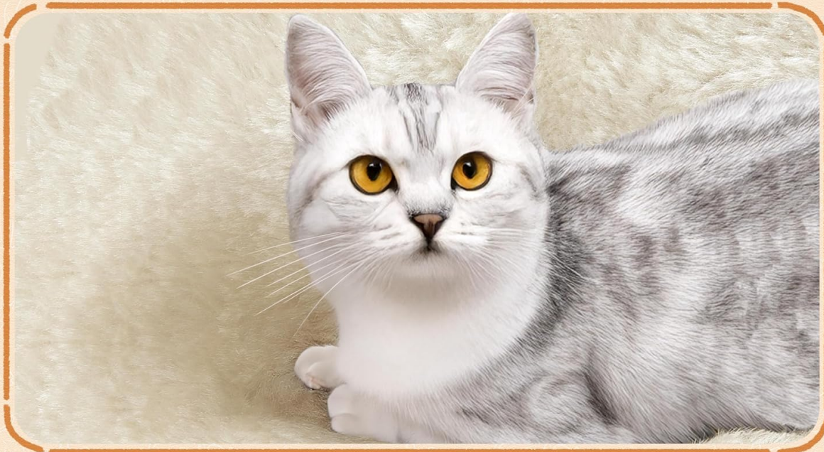
Plush Fabric Covering