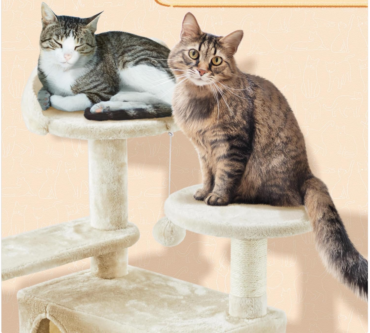
Image: Two cats comfortably resting on the multi-level top lookout perches of the cat tree.