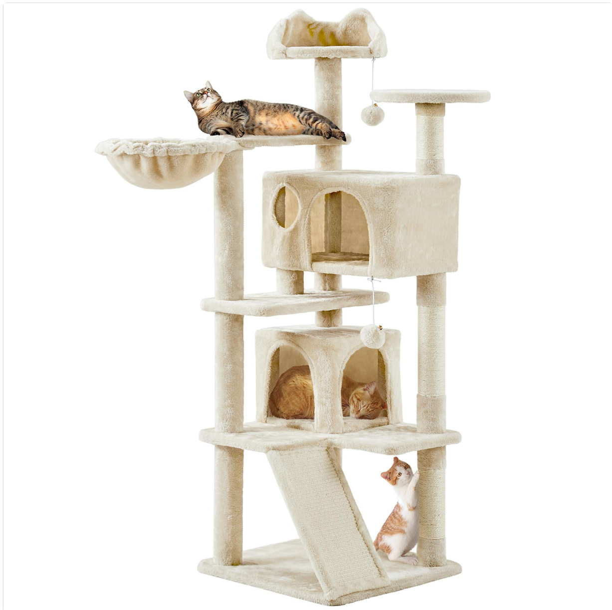
Image: The Topeakmart 55-inch Multi-Level Cat Tree in beige, showcasing its various levels, condos, and scratching posts.