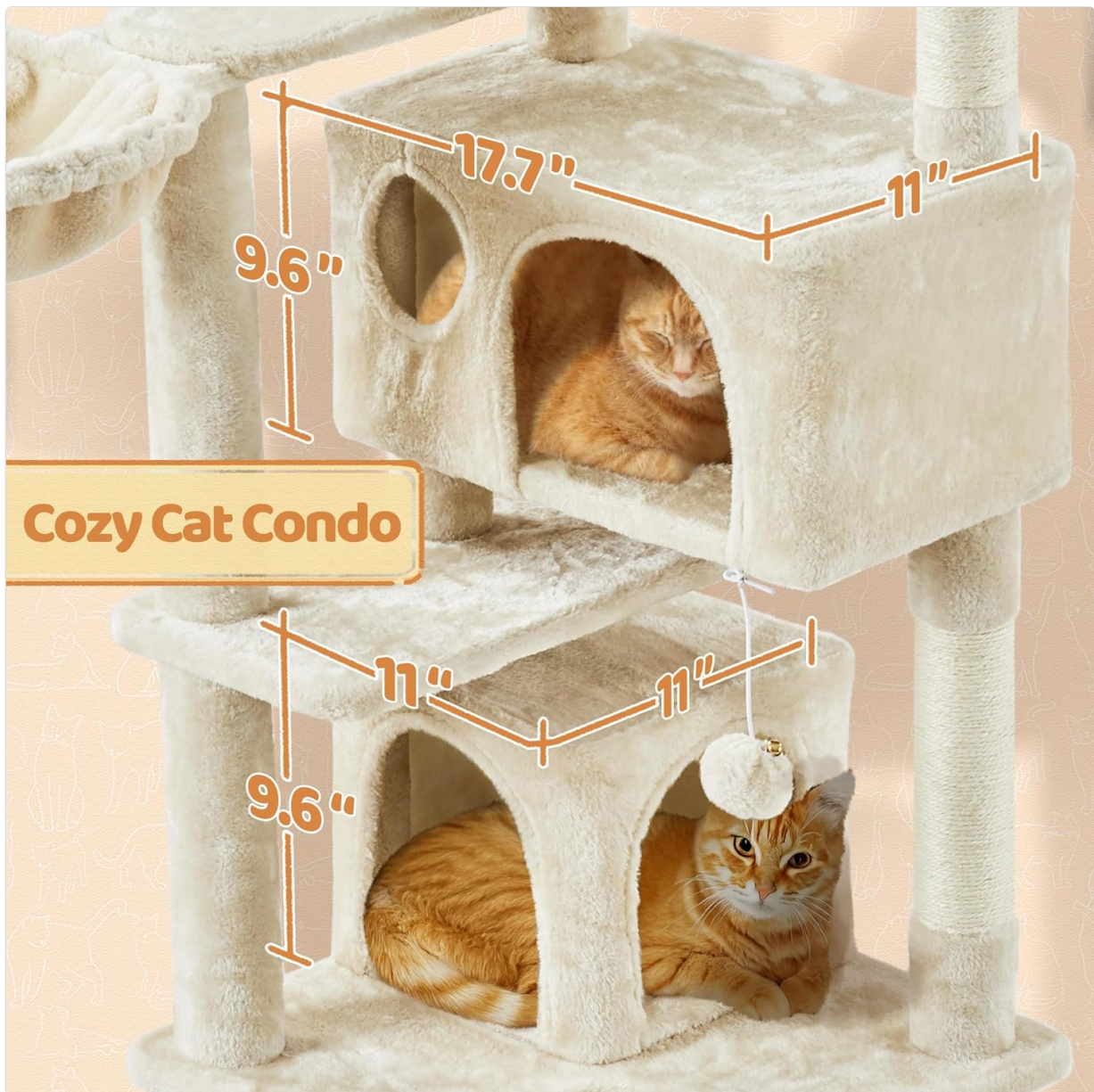
Image: A close-up view of the cozy cat condos, highlighting their dimensions for cat comfort.