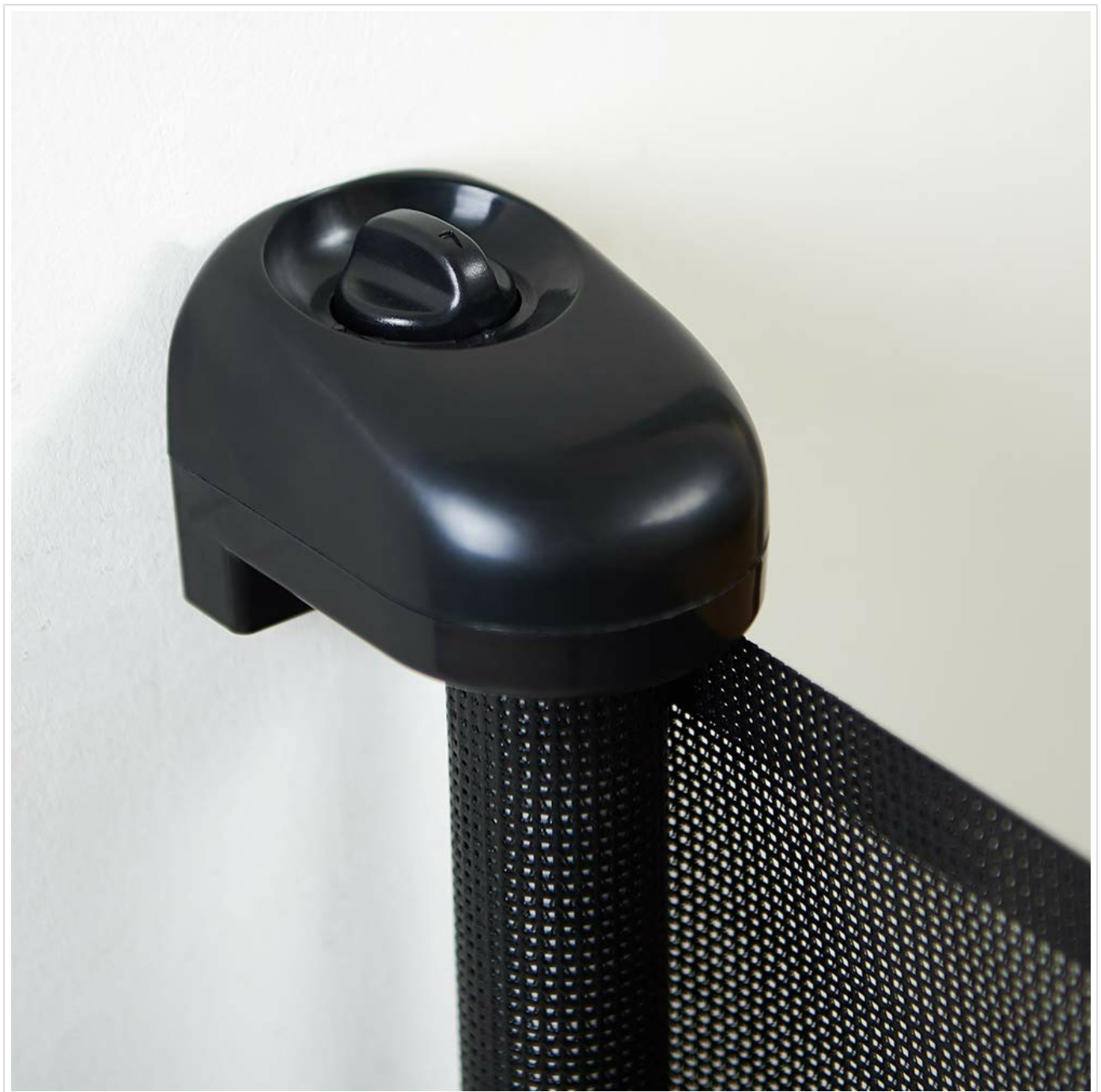
Figure 3: Close-up of the gate's locking mechanism.