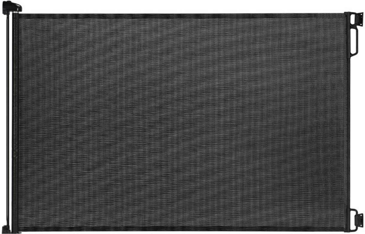
Figure 1: EasyBaby Extra Wide Retractable Baby Gate (Model E70113) in extended position.