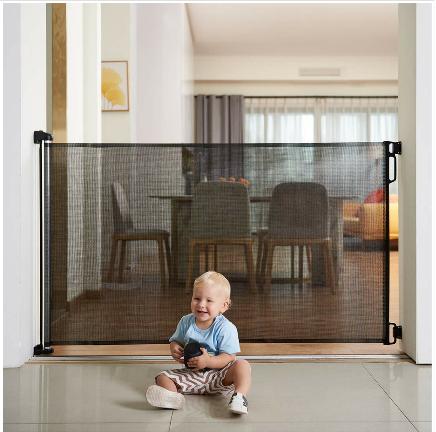
Figure 4: Baby safely contained by the extended gate.