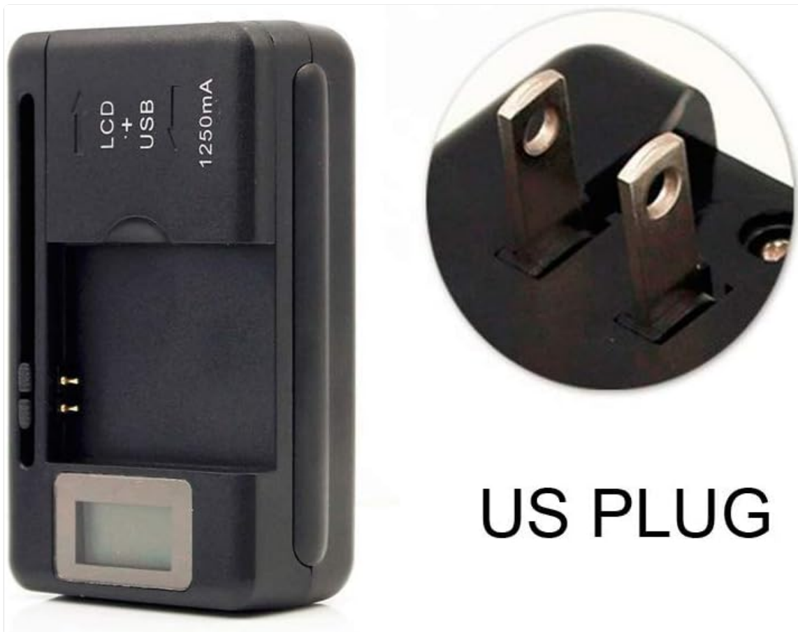
Figure 1: Charger with foldable US plug extended.