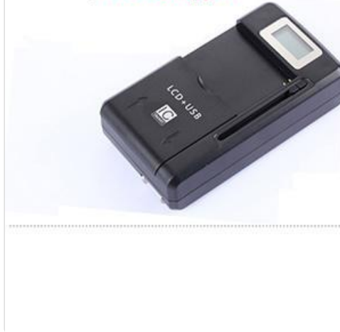
Figure 4: LCD display showing battery charge progress.