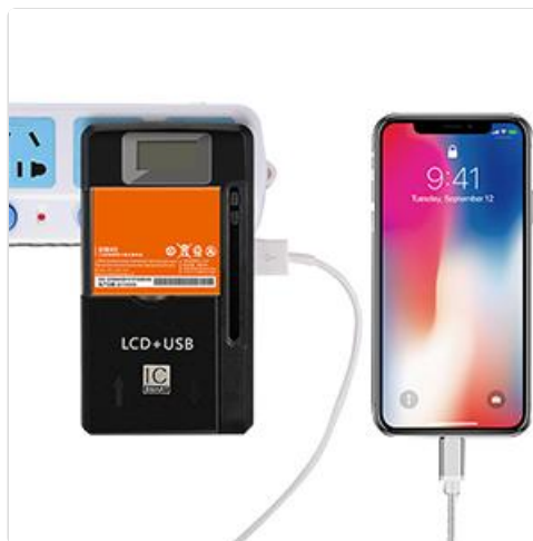
Figure 5: Charging a smartphone via the USB output port.