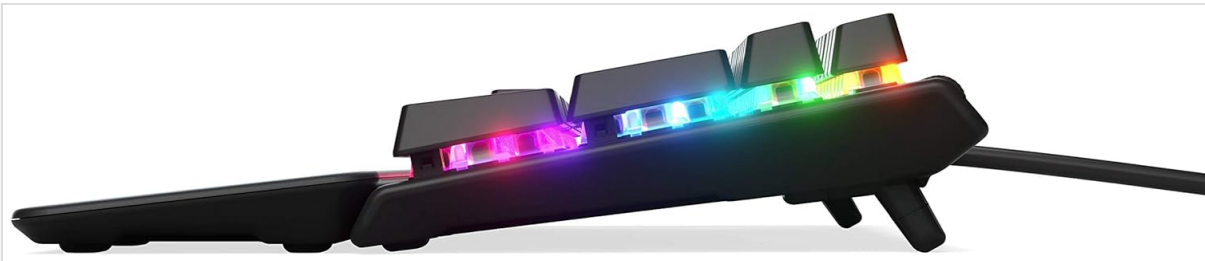
Figure 2: Adjustable feet on the underside of the keyboard for ergonomic positioning.