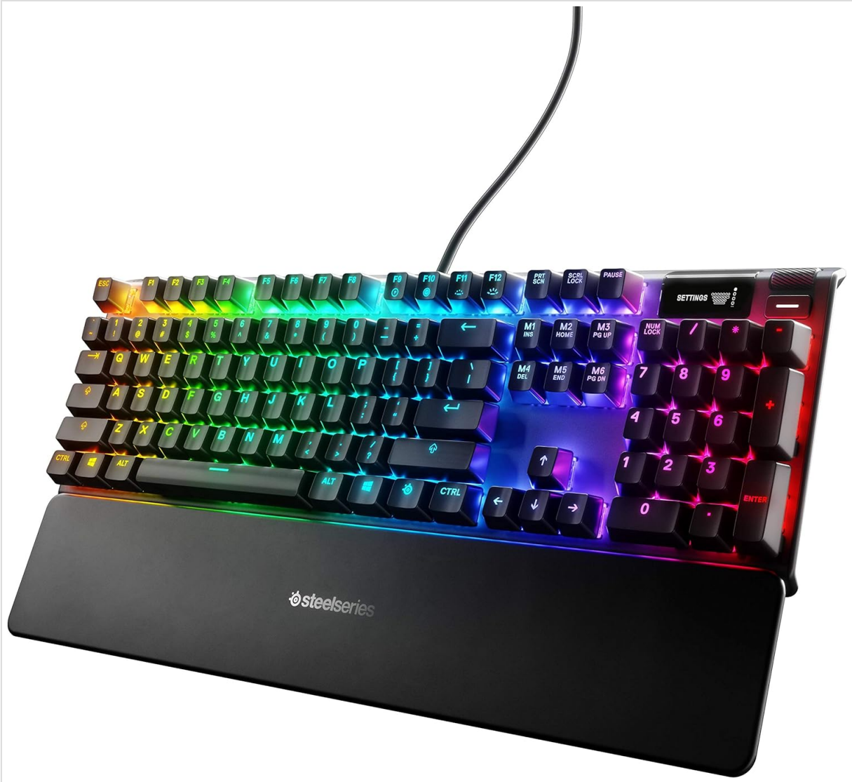
Figure 1: SteelSeries Apex 7 Mechanical Gaming Keyboard with RGB illumination and wrist rest.