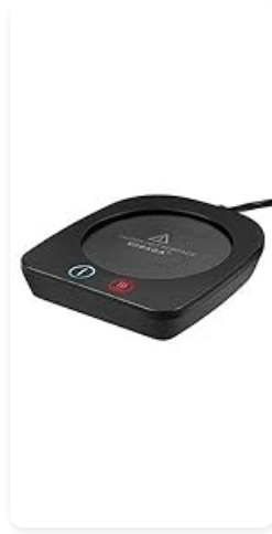
Image: The 4-hour auto shut-off feature ensures safety and energy saving.