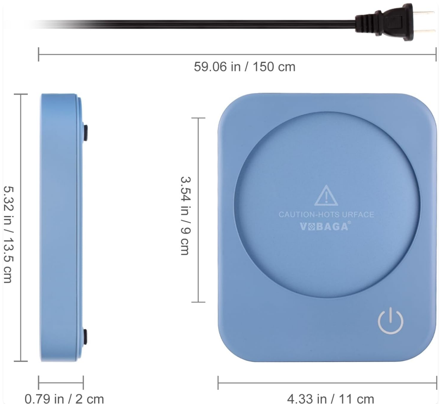
Image: Dimensions of the VOBAGA Coffee Mug Warmer, showing its compact size and cord length.