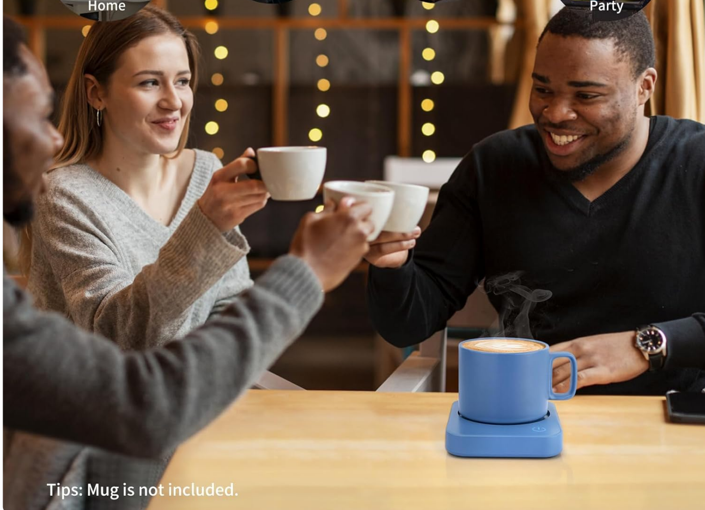
Image: The VOBAGA Coffee Mug Warmer keeping a beverage warm in an office setting.