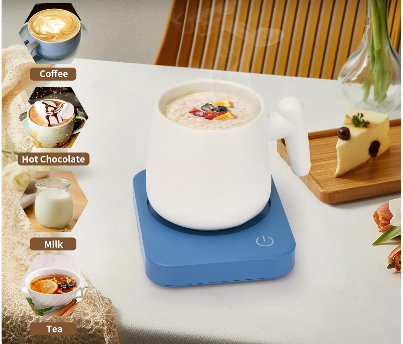
Image: The VOBAGA Coffee Mug Warmer is compatible with various mug types, including ceramic, stainless steel, and glass, for versatile use.