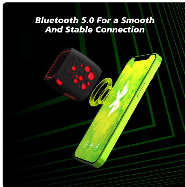
Figure 4: The ALLWAY Mini Bluetooth Speaker establishing a smooth and stable connection with a smartphone using Bluetooth 5.0 technology.