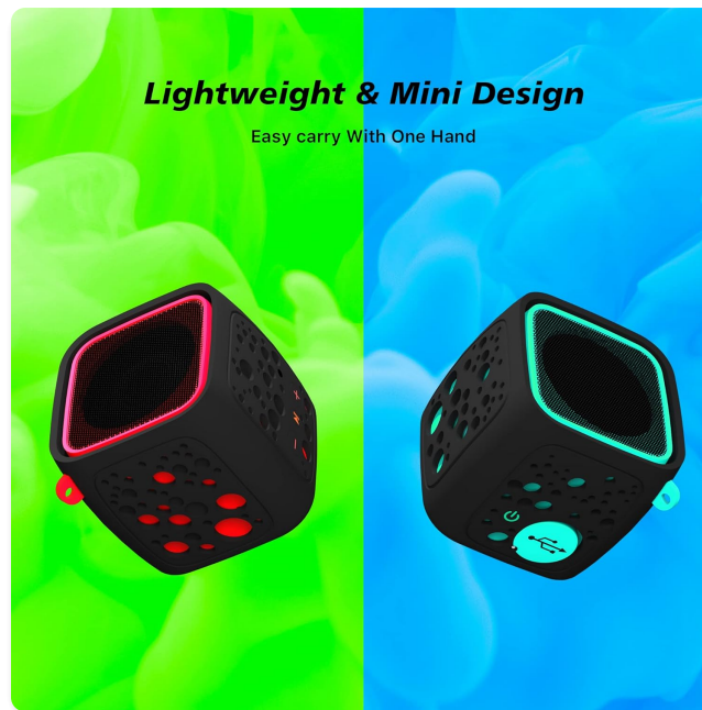
Figure 1: The ALLWAY Mini Bluetooth Speaker highlighting its compact and lightweight design, making it easy to carry with one hand. The image displays two speakers, one with red accents and one with teal accents, against a vibrant background.

The ALLWAY Mini Bluetooth Speaker features a minimalist design with essential controls for ease of use.