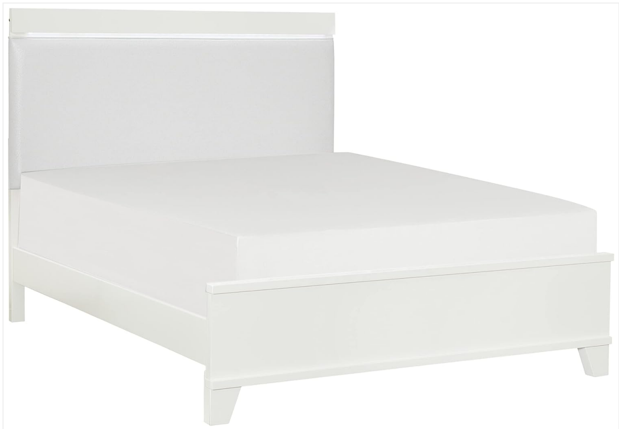
Image 2: Side view of the Eleonore Queen Panel Bed, showcasing the panel design and headboard.