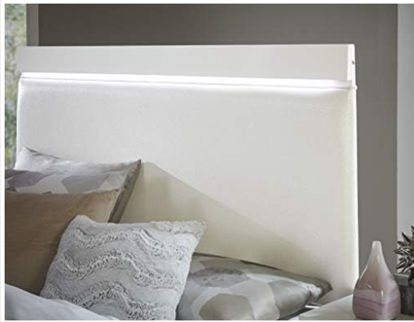
Image 4: Close-up view of the headboard, showing the integrated LED lighting strip.