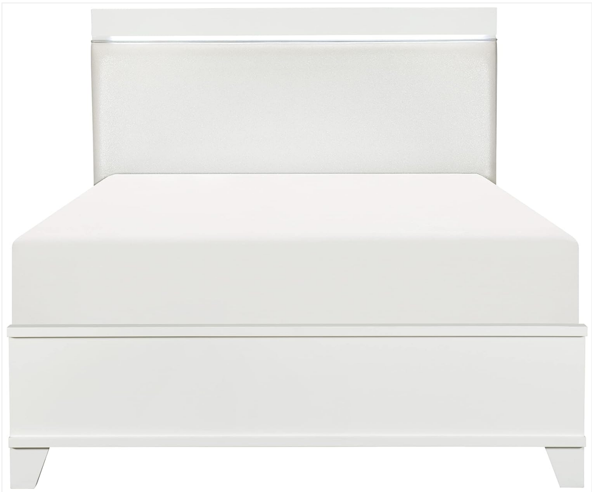
Image 3: Front view of the Eleonore Queen Panel Bed, highlighting the headboard and footboard design.