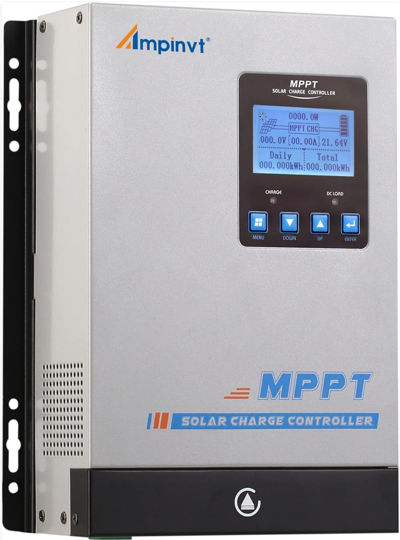
Front view of the AMPINVT 80 Amp MPPT Solar Charge Controller, showing the LCD display and control buttons.