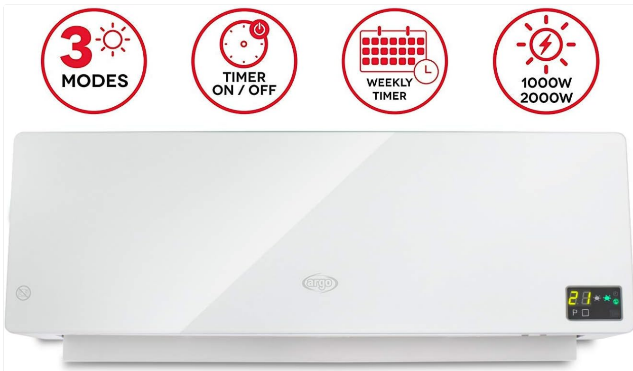
Image 1: Front view of the Argo Chic White heater highlighting its 3 modes, daily/weekly timer, and 1000W/2000W power settings.