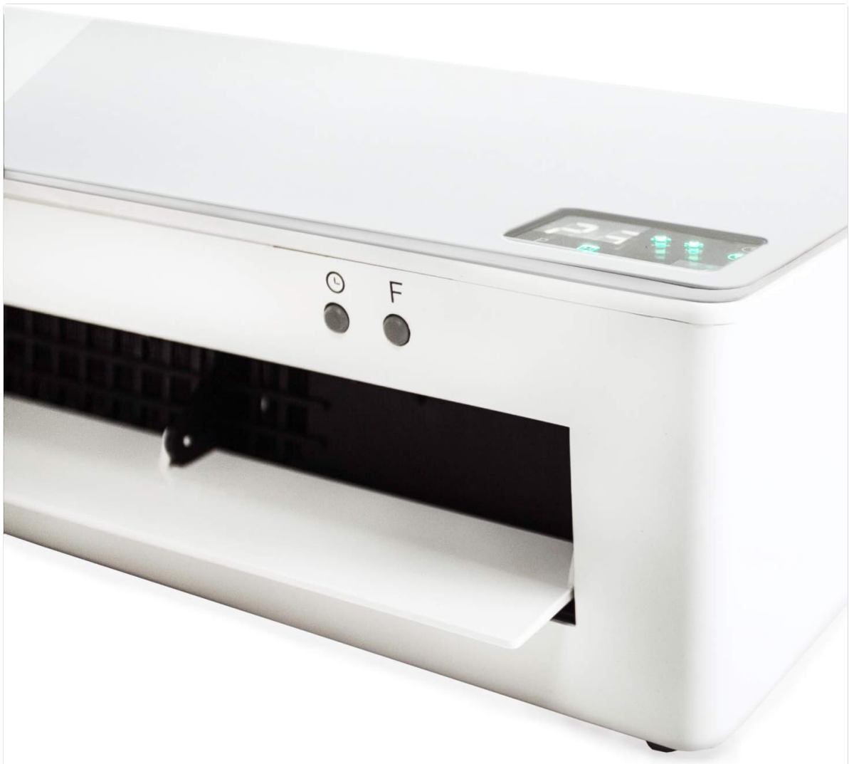
Image 6: Close-up of the air outlet with the oscillating flap, which helps distribute warm air evenly.