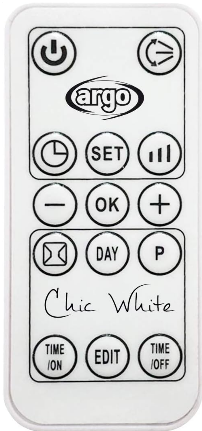
Image 5: The remote control for the Argo Chic White heater, featuring buttons for power, mode, temperature adjustment, and timer settings.