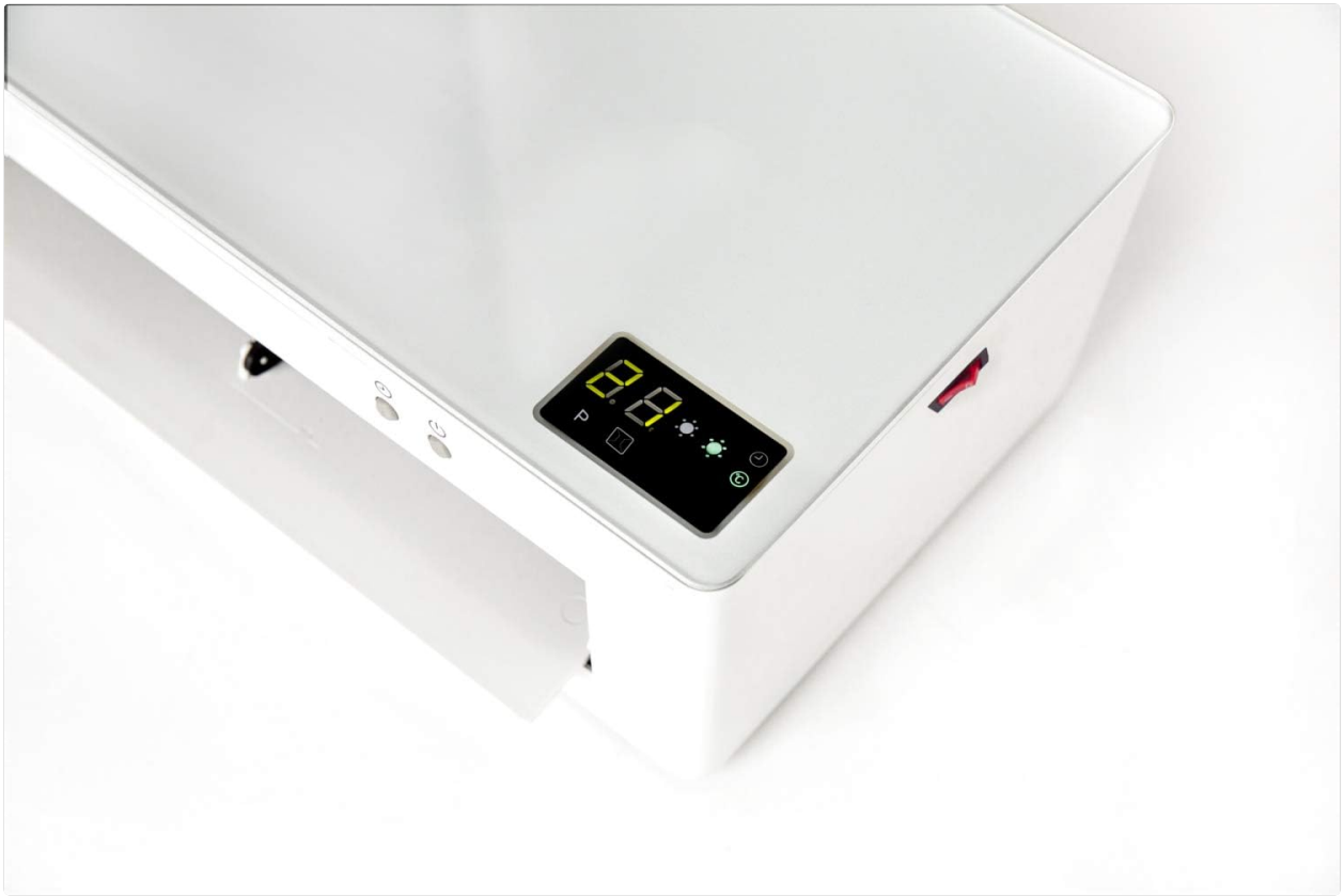
Image 4: Close-up view of the LED display and touch controls on the top right of the heater's front panel.

The LED display shows the current temperature and selected settings. Touch-sensitive buttons allow for basic control.