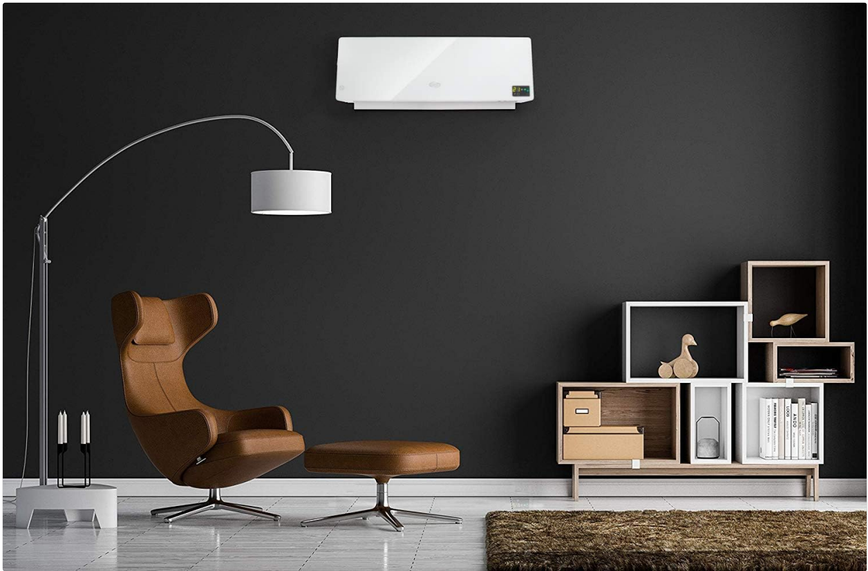
Image 3: The Argo Chic White heater elegantly mounted on a wall in a modern living space.