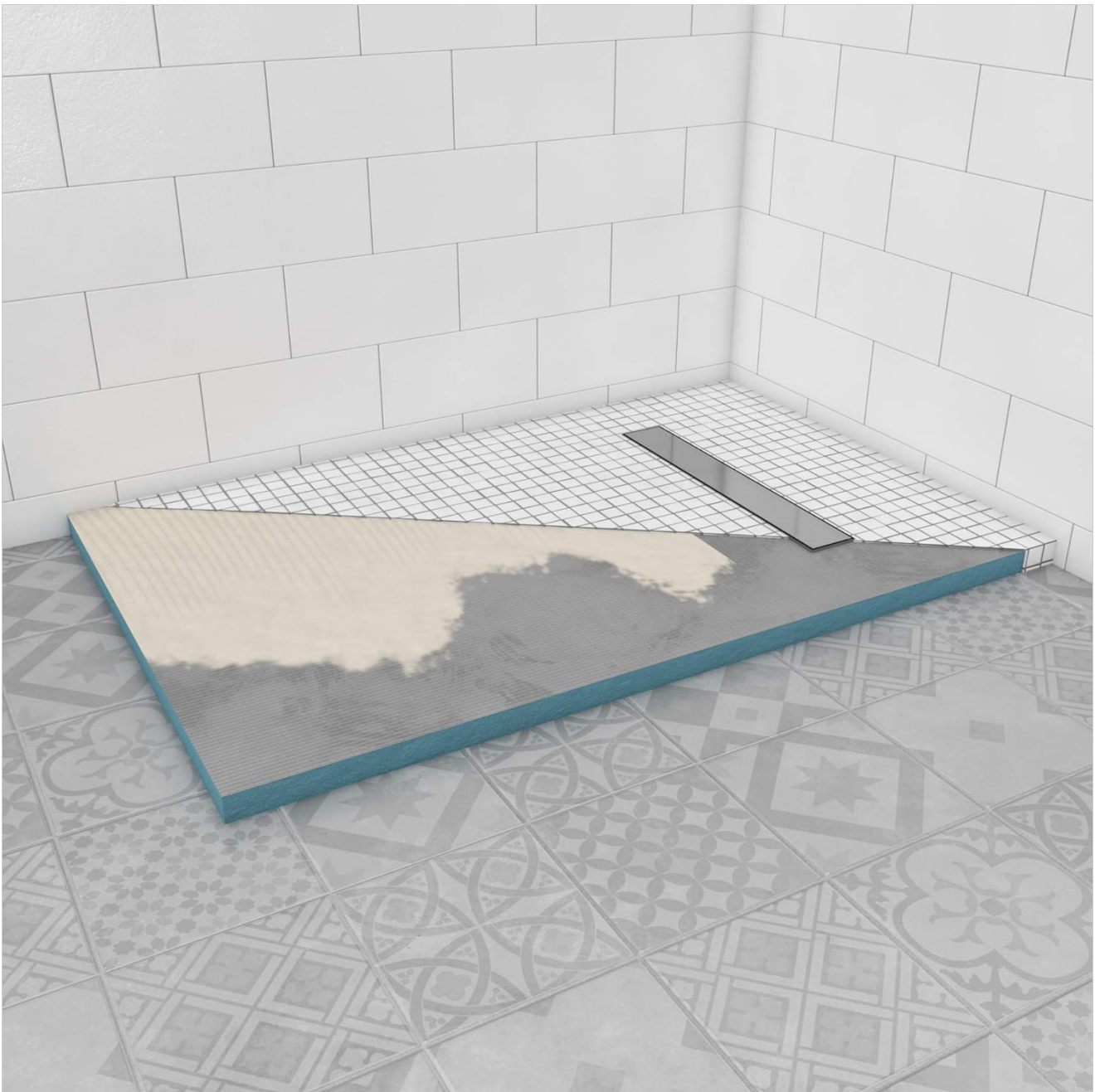
Image: An Aurlane shower tray partially tiled, demonstrating the process of applying tiles over the waterproof polystyrene base. The integrated drain is visible.