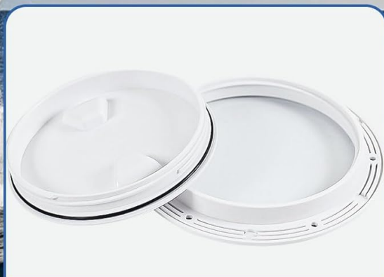
Simple and elegant