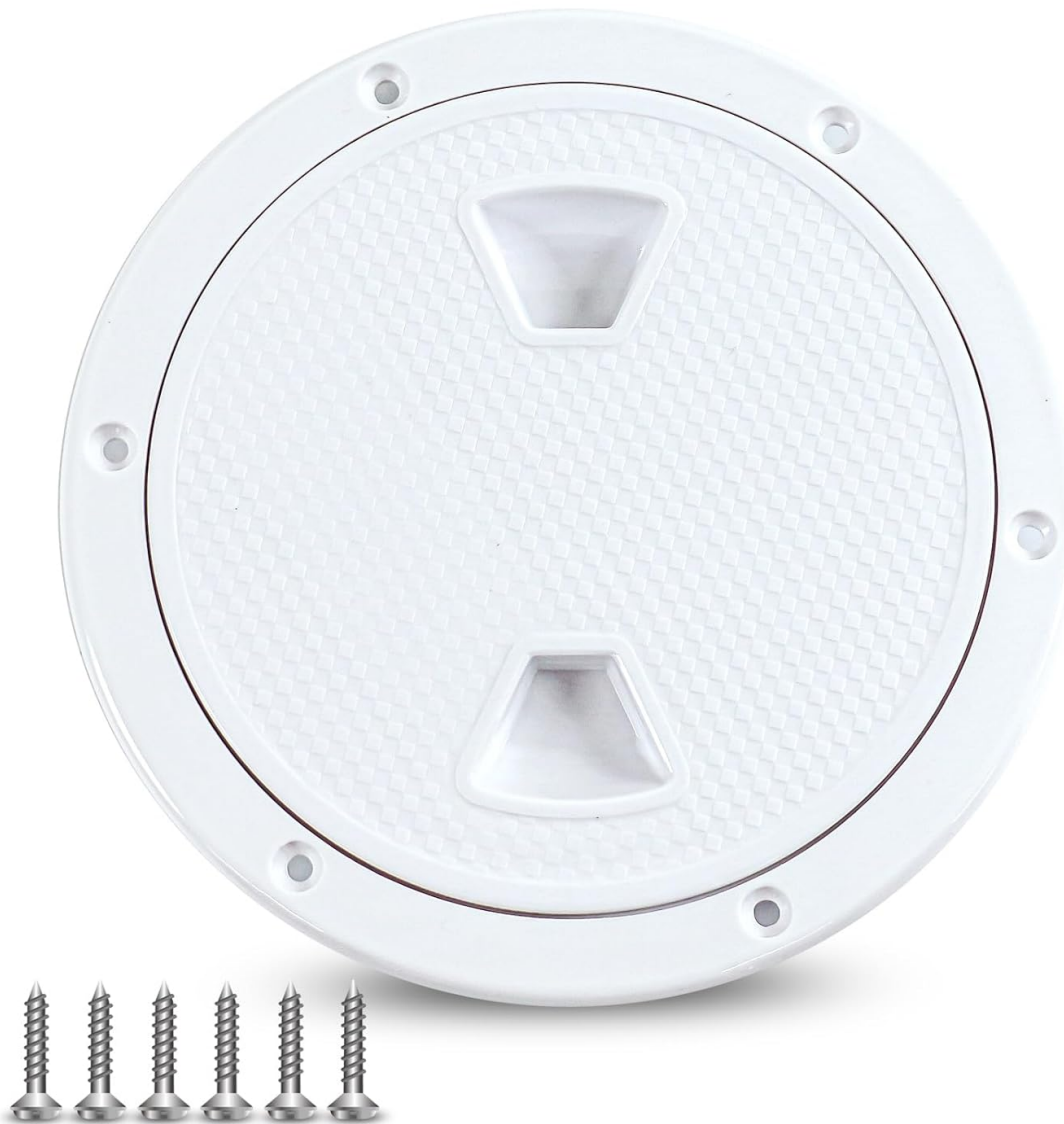
Figure 1: Hoffen 8-inch Round Inspection Hatch with mounting screws.