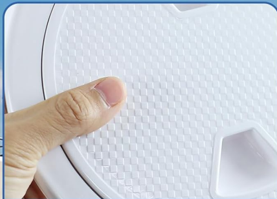
Clear and exquisite texture