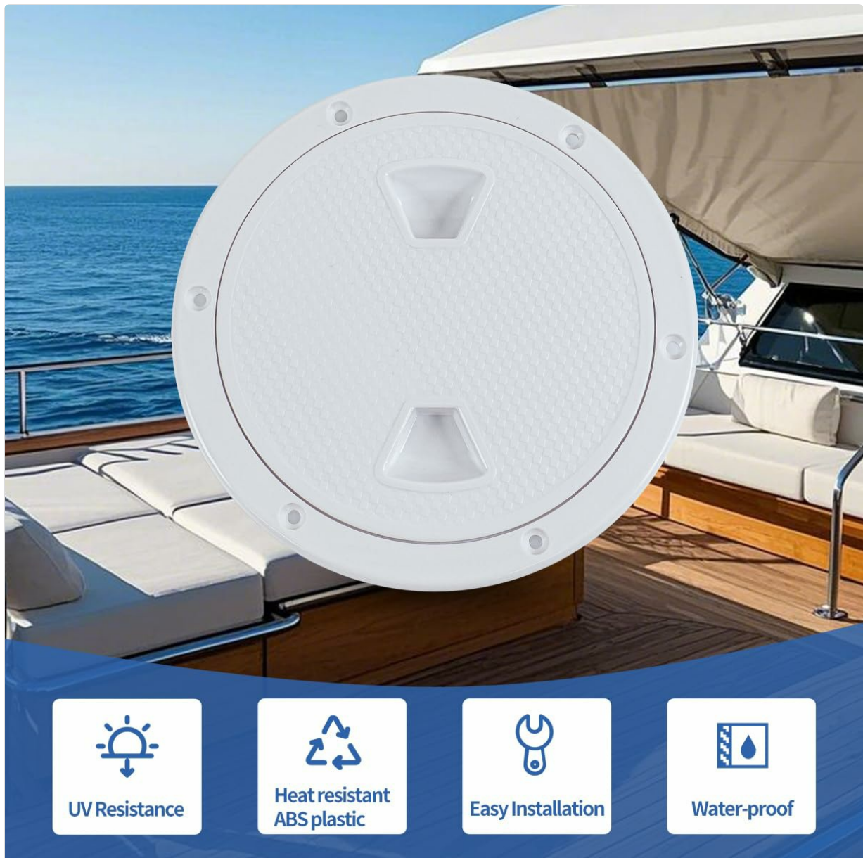
Figure 4: Example of a Hoffen hatch installed on a marine deck, showcasing its integration and weather-resistant properties.