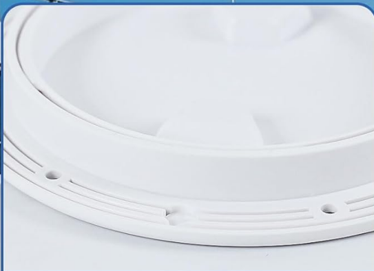
Heat resistant ABS plastic