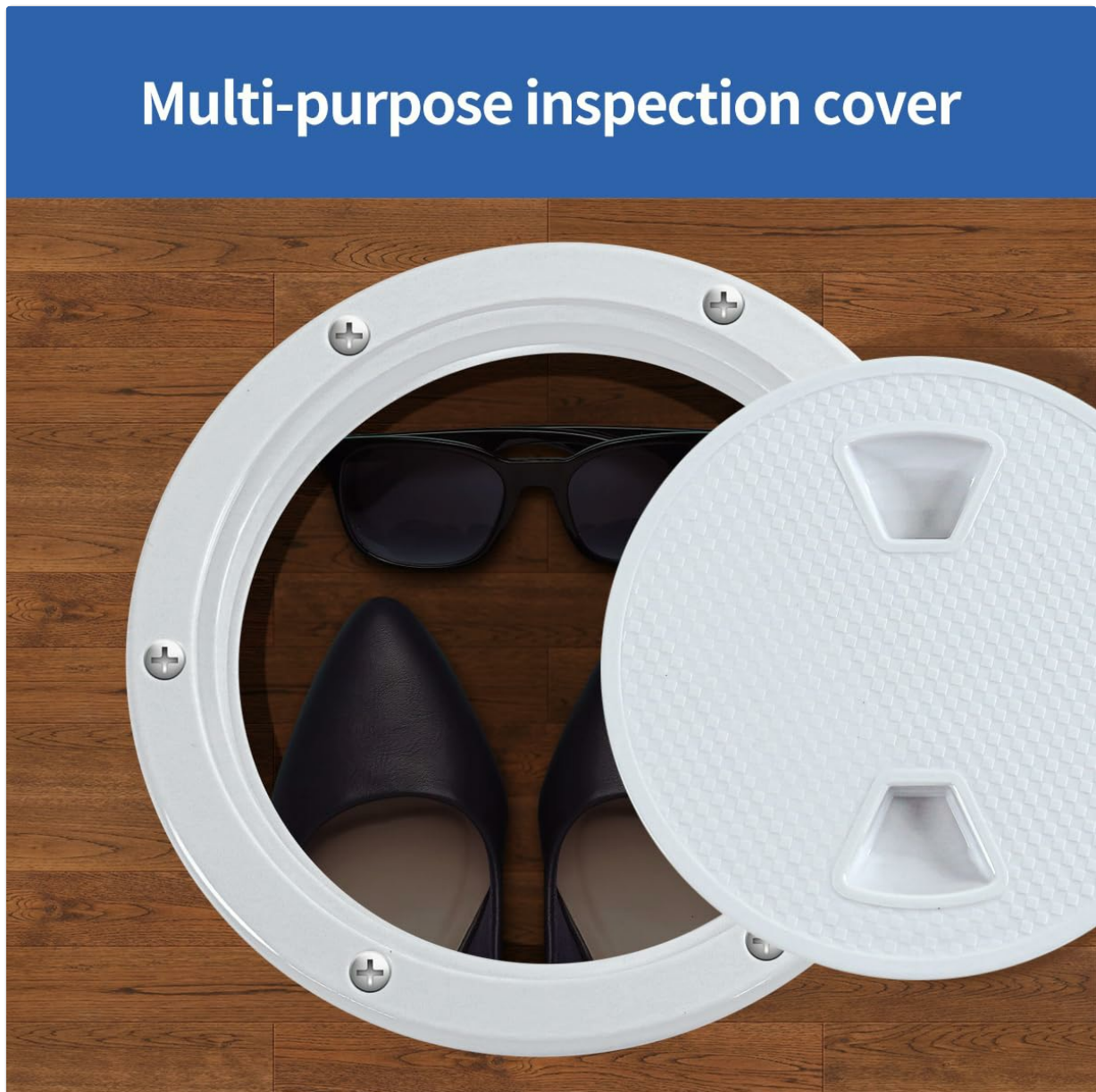
Figure 5: The hatch cover detached, revealing the storage space beneath, suitable for various items.