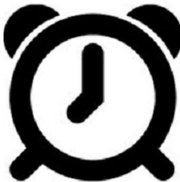
Figure 4: Daily Alarm display.