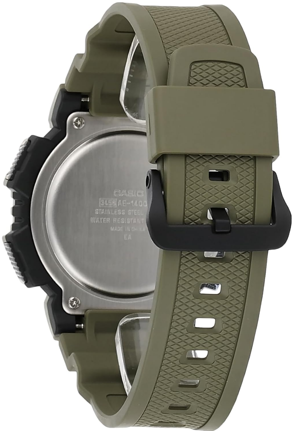
Figure 2: Side view showing watch buttons for adjustment.