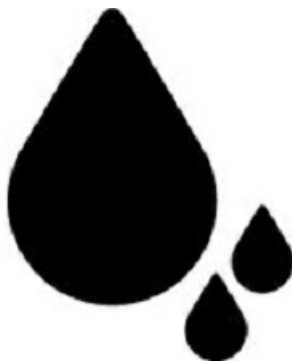
Figure 5: Water Resistance icon.

Your Casio AE-1400WH-3AVCF watch is water resistant to 100 meters (10 BAR). This means it is suitable for swimming, showering, and snorkeling. However, it is not recommended for scuba diving. Do not operate buttons while the watch is wet or submerged.