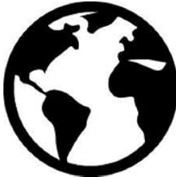
Figure 3: World Time display with digital map.