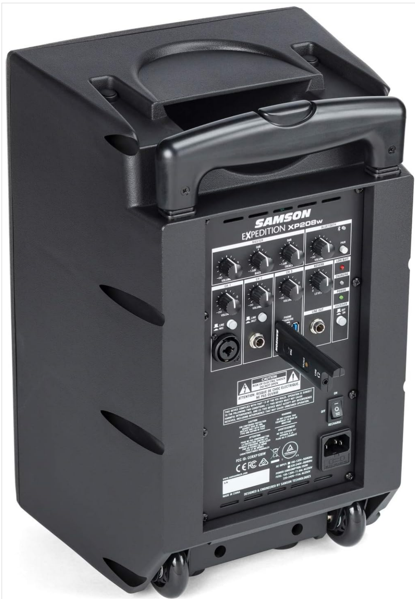
Figure 3: Rear panel with XPD2 USB receiver connected.