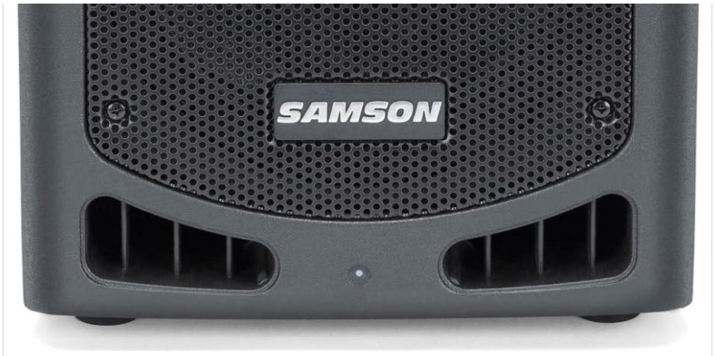
Figure 2: Front view of the XP208w PA System.