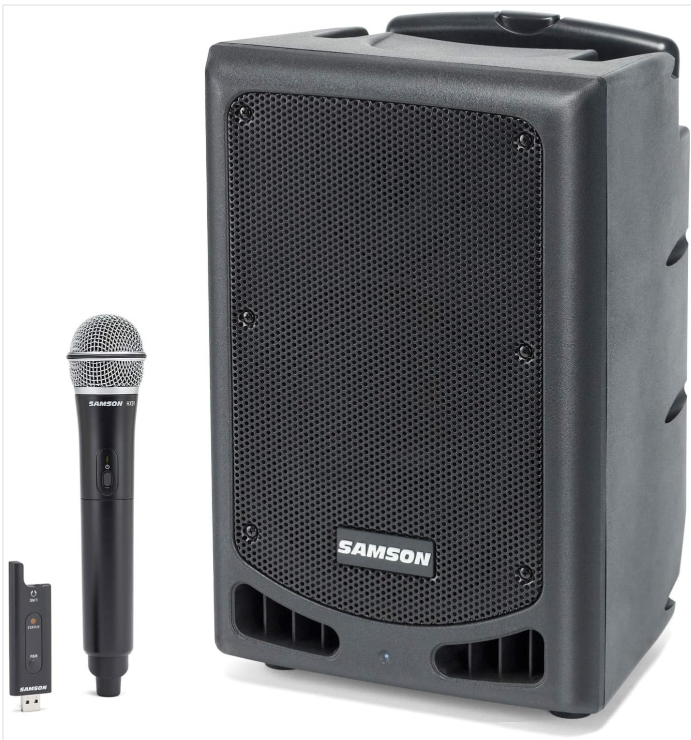
Figure 1: Samson Expedition XP208w Portable PA System.