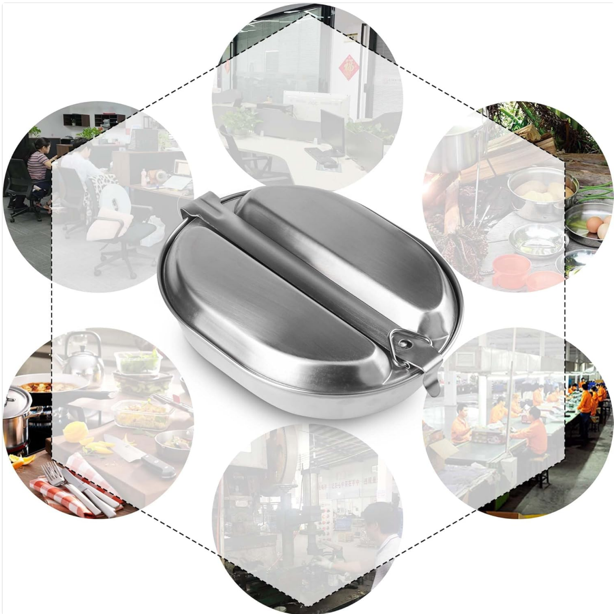
Figure 3.1: Mess Kit in its compact, closed state.