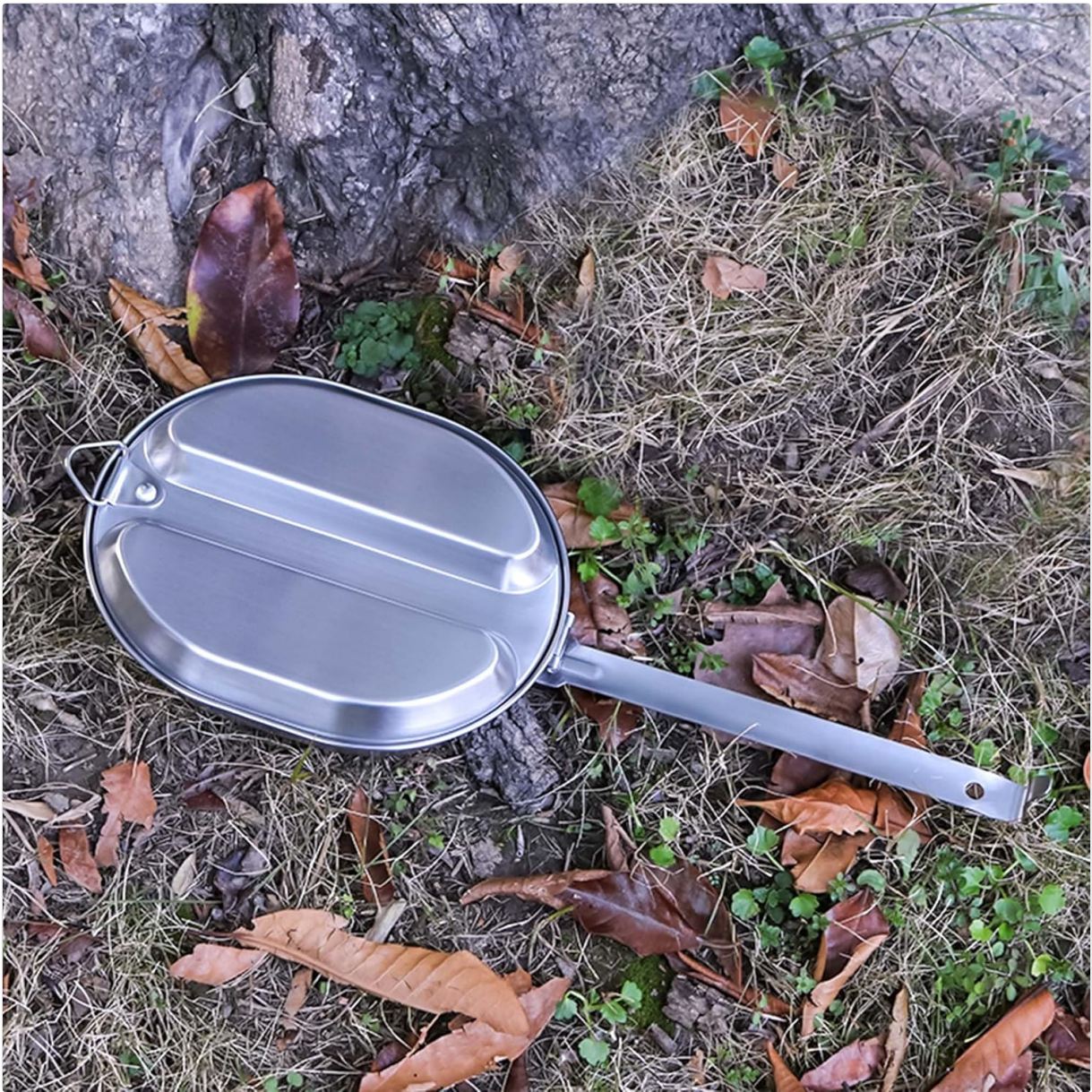
Figure 4.2: Mess Kit in an outdoor setting.