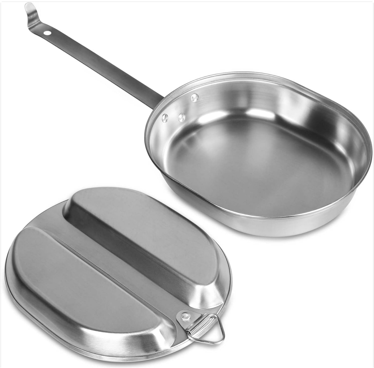
Figure 2.1: Mess Kit components laid out.