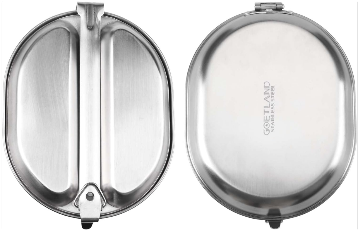
Figure 4.1: Top and bottom view of the closed mess kit.