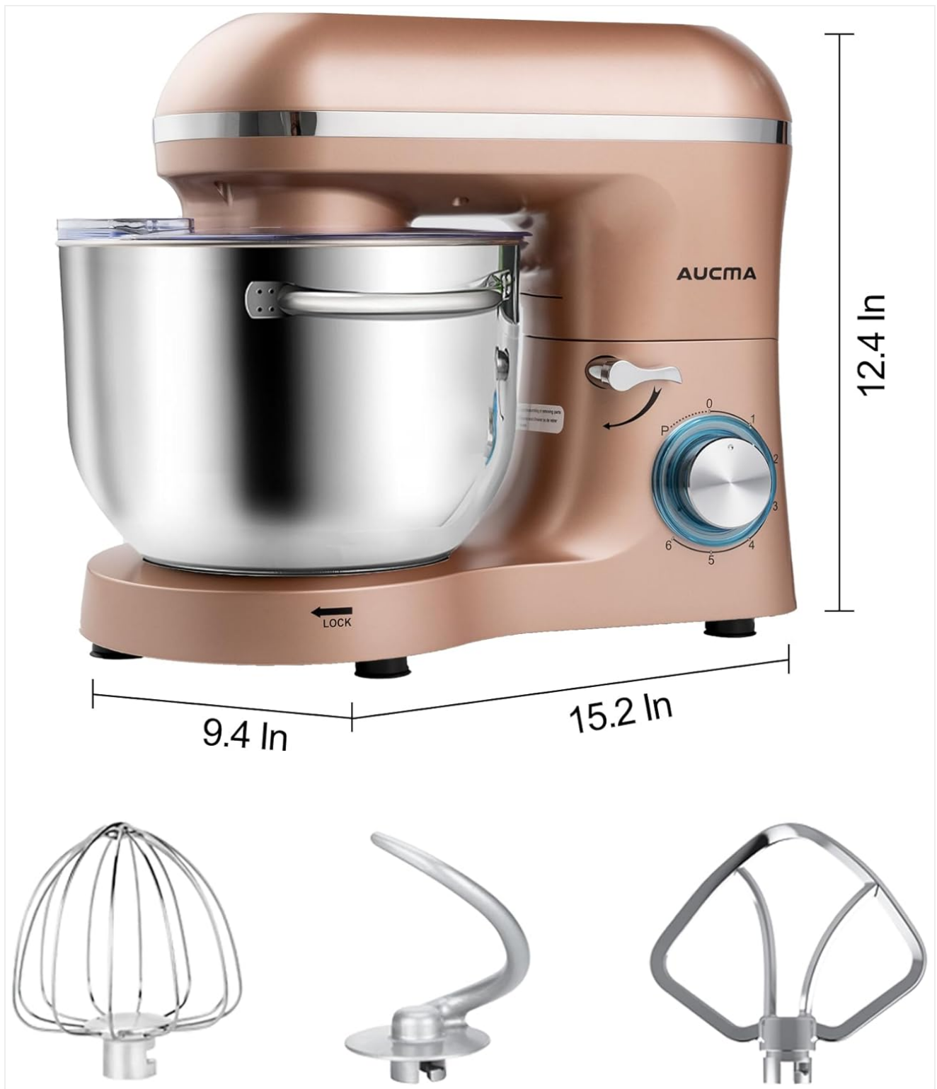
Figure 8.1: Key dimensions of the Aucma Stand Mixer for placement and storage reference.