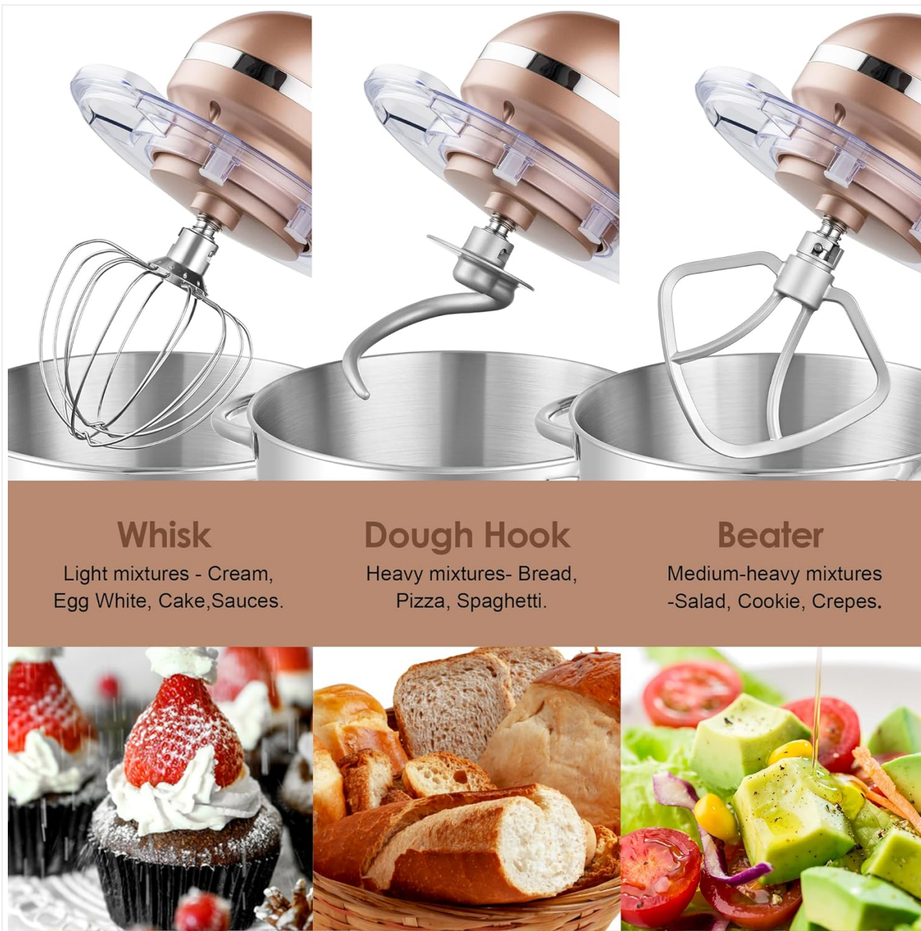
Figure 3.2: The three primary attachments: whisk for light mixtures, dough hook for heavy mixtures, and beater for medium-heavy mixtures.