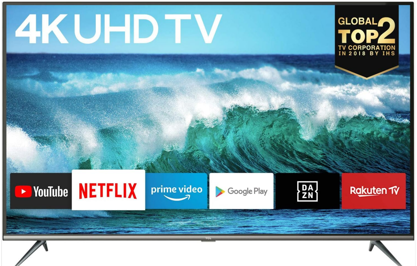
Figure 4.1: Front view of the TCL 55EP640 Smart TV. This image shows the television with its stand attached, displaying a dynamic ocean scene on the screen. Prominently featured are logos for popular streaming services, indicating the TV's smart capabilities.

To attach the TV stand, place the TV face down on a soft, flat surface to prevent scratches. Align each stand piece with the corresponding slots on the bottom of the TV and secure them with the provided screws.