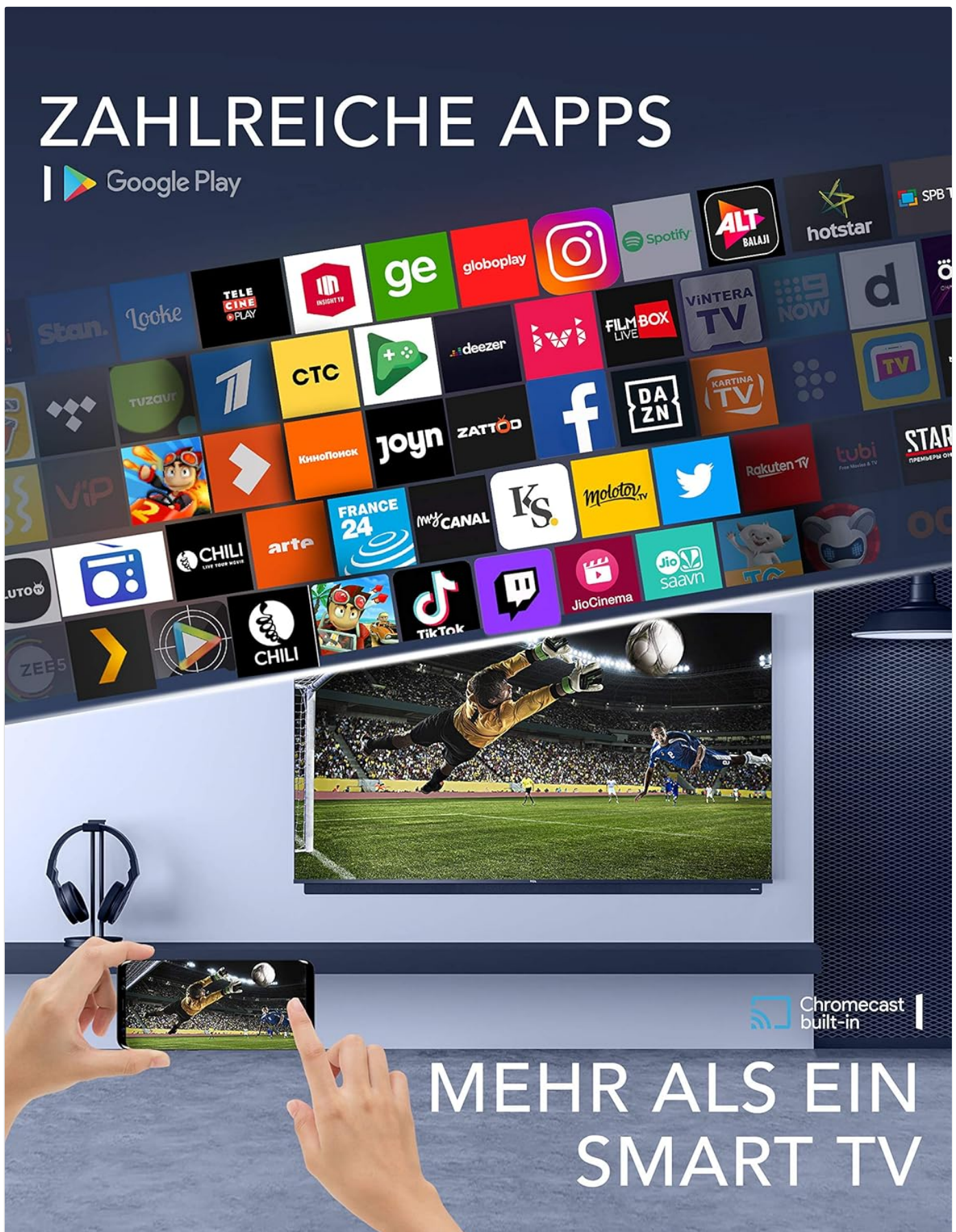
Figure 5.2: Google Play Store and Chromecast functionality. This image displays the Google Play Store interface on the TV, showcasing a variety of apps. It also illustrates a smartphone casting content to the TV, emphasizing the built-in Chromecast feature.