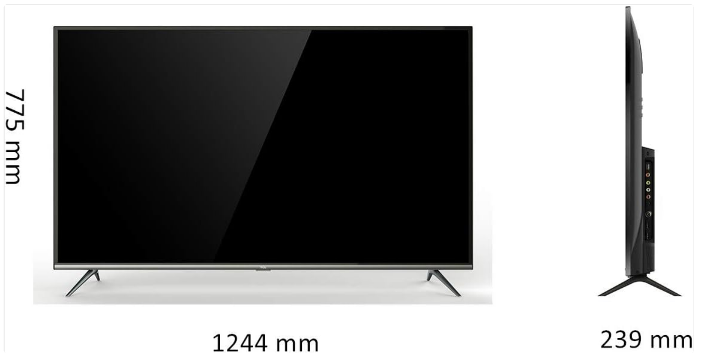
Figure 4.2: TCL 55EP640 Smart TV dimensions. This image provides a front and side view of the TV with measurements: 1244 mm width (front), 775 mm height (side), and 239 mm depth (side, including stand).