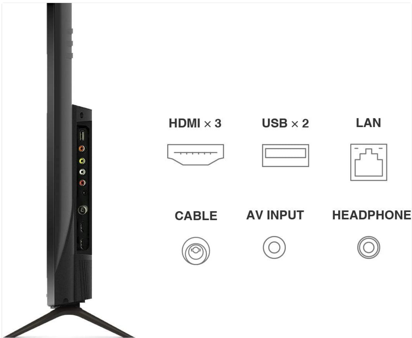
Figure 4.3: Connectivity ports of the TCL 55EP640 Smart TV. This diagram illustrates the available input/output ports on the television, including 3 HDMI ports, 2 USB ports, a LAN port, a Cable input, an AV input, and a Headphone jack.