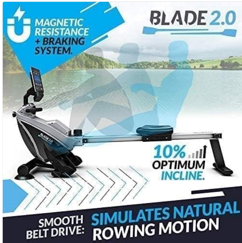
Image: The Bluefin Fitness Blade 2.0 Rower illustrating its smooth belt drive for natural rowing motion and the 10% optimum incline for added resistance.

The Bluefin Fitness Blade 2.0 is designed for comfort during your workout. It features ergonomic grip handlebars, anti-slip secure foot pedals with adjustable straps, and a padded cushioned seat to ensure a comfortable and stable rowing experience.