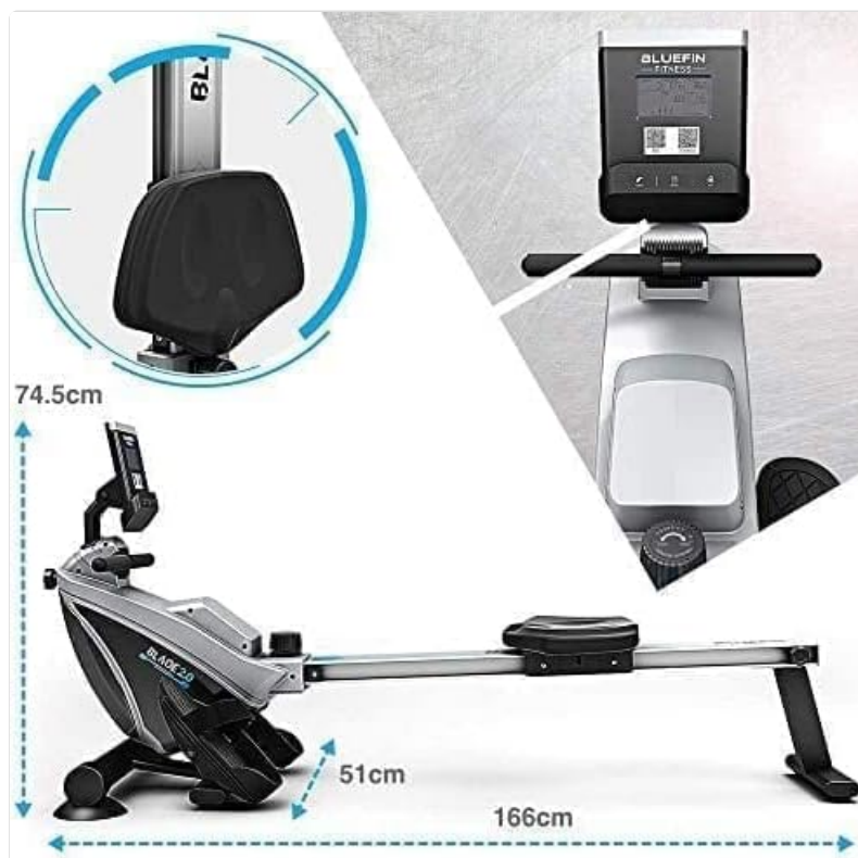
Image: The Bluefin Fitness Blade 2.0 Rower displaying its key dimensions: 166cm length, 51cm width at the base, and 74.5cm height to the top of the console.