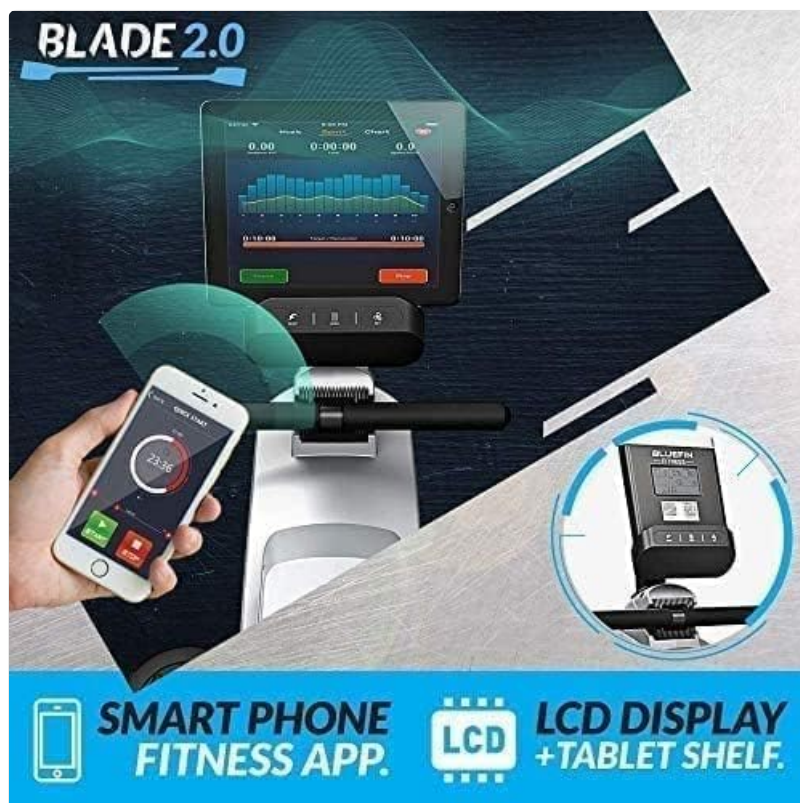
Image: The LCD digital fitness console of the Bluefin Fitness Blade 2.0 Rower, showing its integration with a smartphone fitness app

The backlit multifunctional LCD display allows you to measure time, distance, calories burned, and strokes per minute. Use the console to track your progress and work towards your workout goals. The console also features a tablet shelf for convenience.