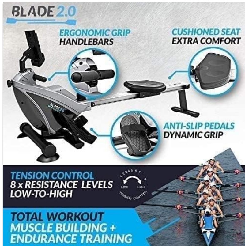
Image: Close-up view highlighting the ergonomic grip handlebars, padded cushioned seat, anti-slip secure foot pedals, and the 8-level tension control knob on the Bluefin Fitness Blade 2.0 Rower.